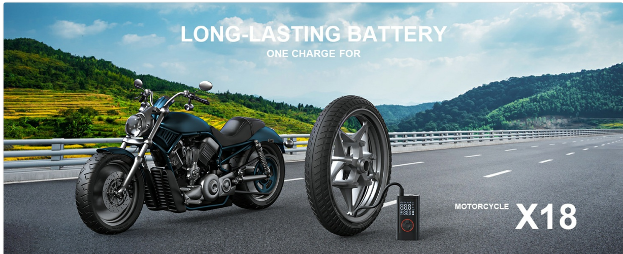
Image 3.1: Included components of the JUSUOX Portable Tire Inflator.