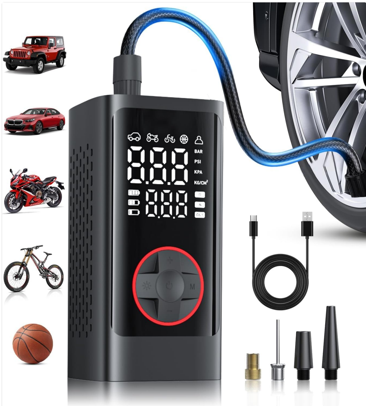
Image 1.1: JUSUOX Portable Tire Inflator ATJ-004 with included accessories and examples of use cases.