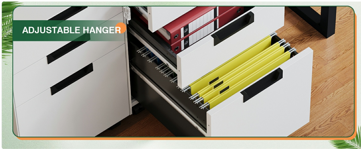
Image: A visual guide demonstrating the versatility of the bottom drawer to store Letter, Legal, and A4 sized hanging files.