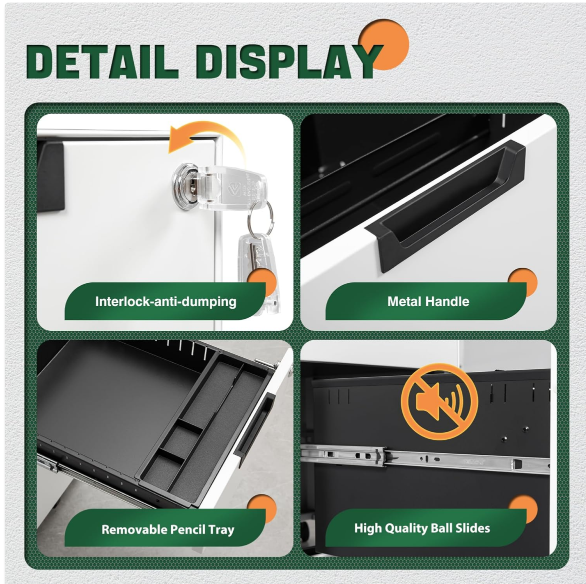
Image: Detailed view of the drawers, illustrating the interlock-anti-dumping feature, sleek metal handles, a removable pencil tray in the top drawer, and the smooth ball-bearing slides.