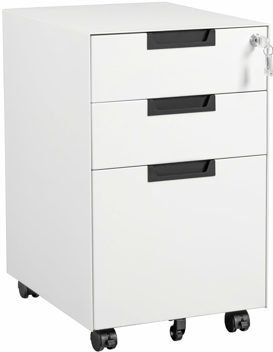
Image: The Letaya 3-Drawer Mobile File Cabinet in white, positioned under a desk in a modern home office environment.