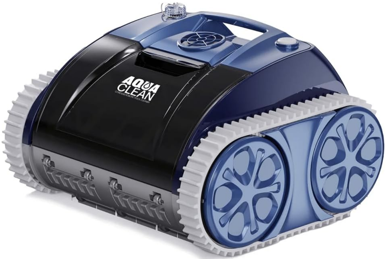
The AquaClean AC1000 PRO, a cordless robotic pool cleaner, designed for efficient pool maintenance.