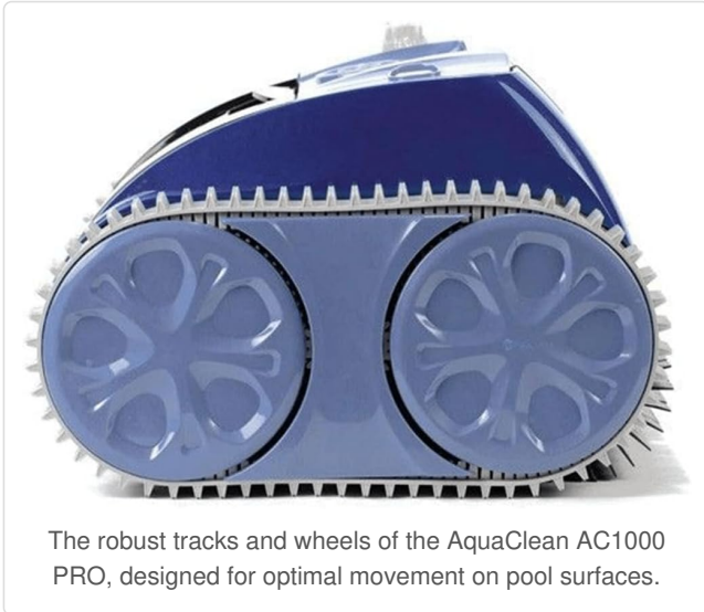
The robust tracks and wheels of the AquaClean AC1000 PRO, designed for optimal movement on pool surfaces.

Ensure the filter basket is properly installed and clean before placing the cleaner in the pool.