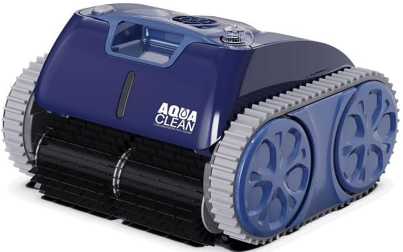
Side view of the AquaClean AC1000 PRO, highlighting its robust scrubbing brushes and durable tracks for comprehensive cleaning.