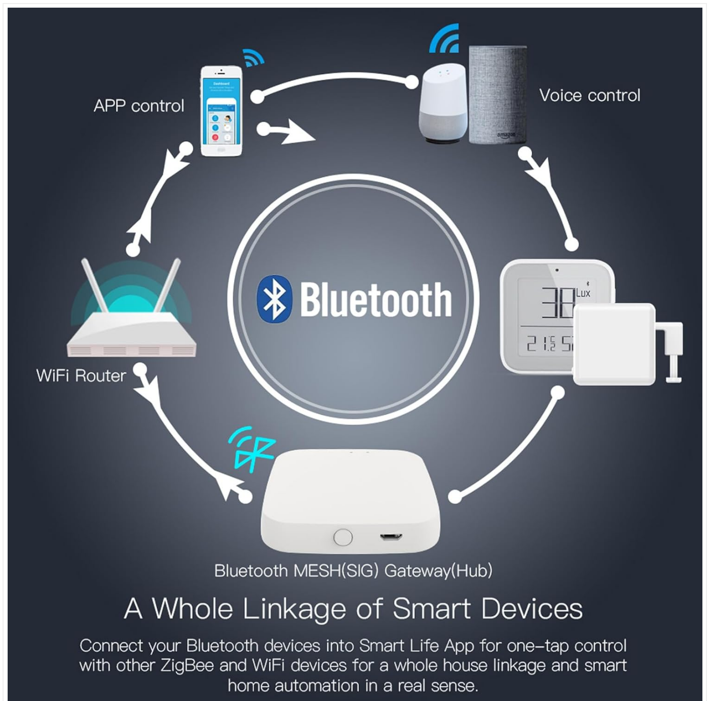
Image: A network diagram illustrating how the Bluetooth Mesh Gateway acts as a central point, connecting to various Bluetooth-enabled smart devices such as air conditioners, fans, thermostats, sensors, switches, and alarms.

Once your gateway is added to the Tuya Smart Life app, you can begin adding compatible Bluetooth SIG Mesh devices.