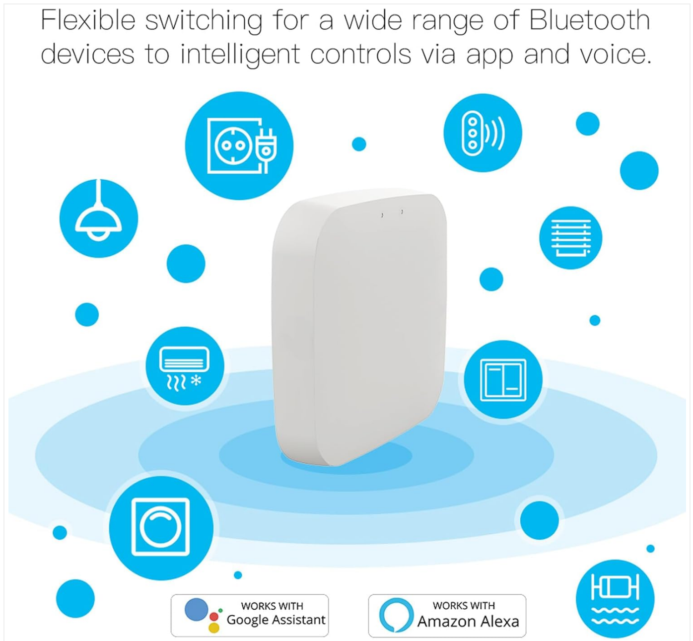
Image: A diagram illustrating the connectivity of the Bluetooth Mesh Gateway with a WiFi router, various Bluetooth devices, a smartphone for app control, and voice assistants for voice control.