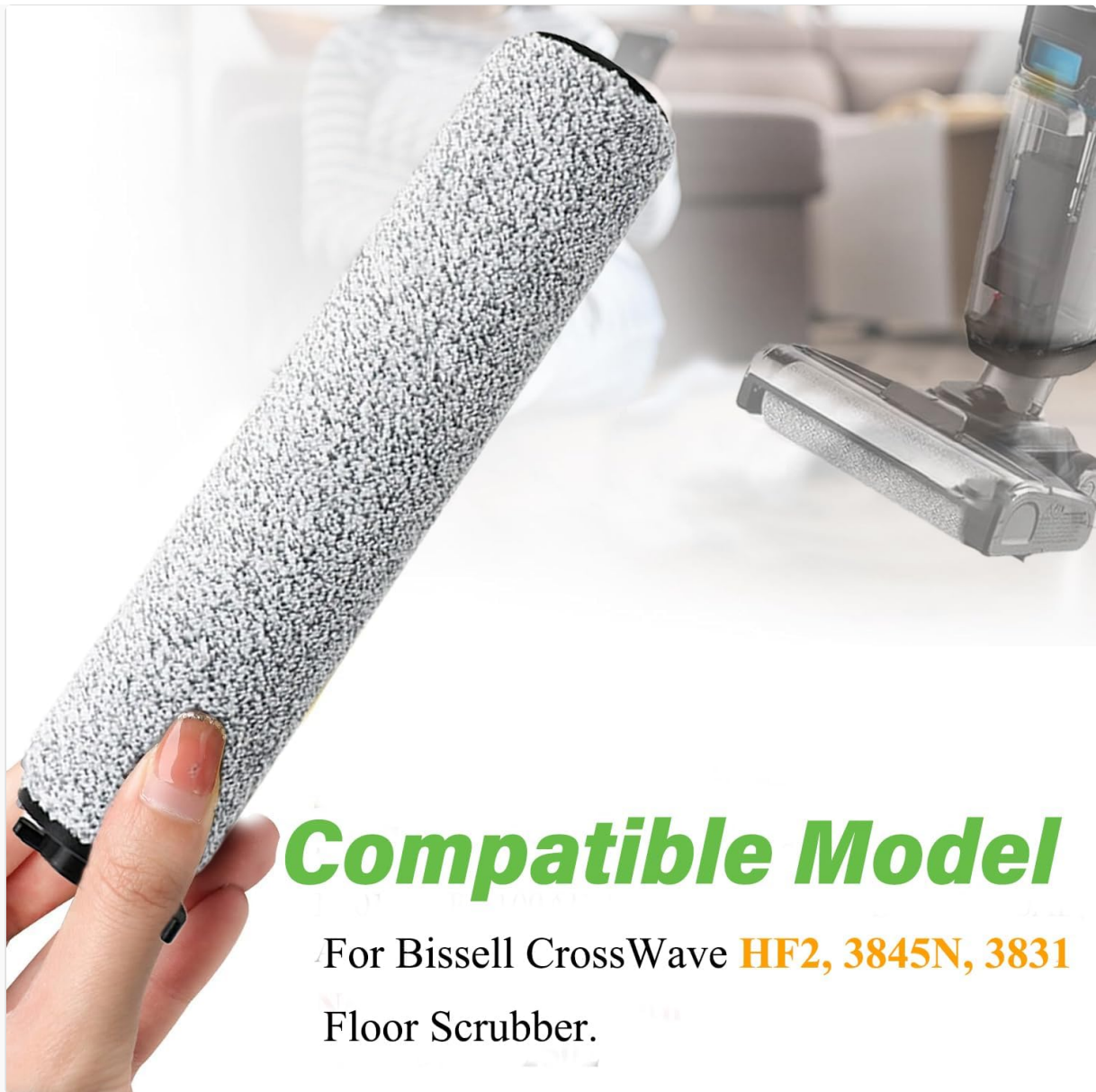
Figure 2: Compatible models for the roller brush.

This image shows a hand holding one of the roller brushes, with text overlay confirming compatibility with Bissell CrossWave HF2, 3845N, and 3831 Floor Scrubber models.