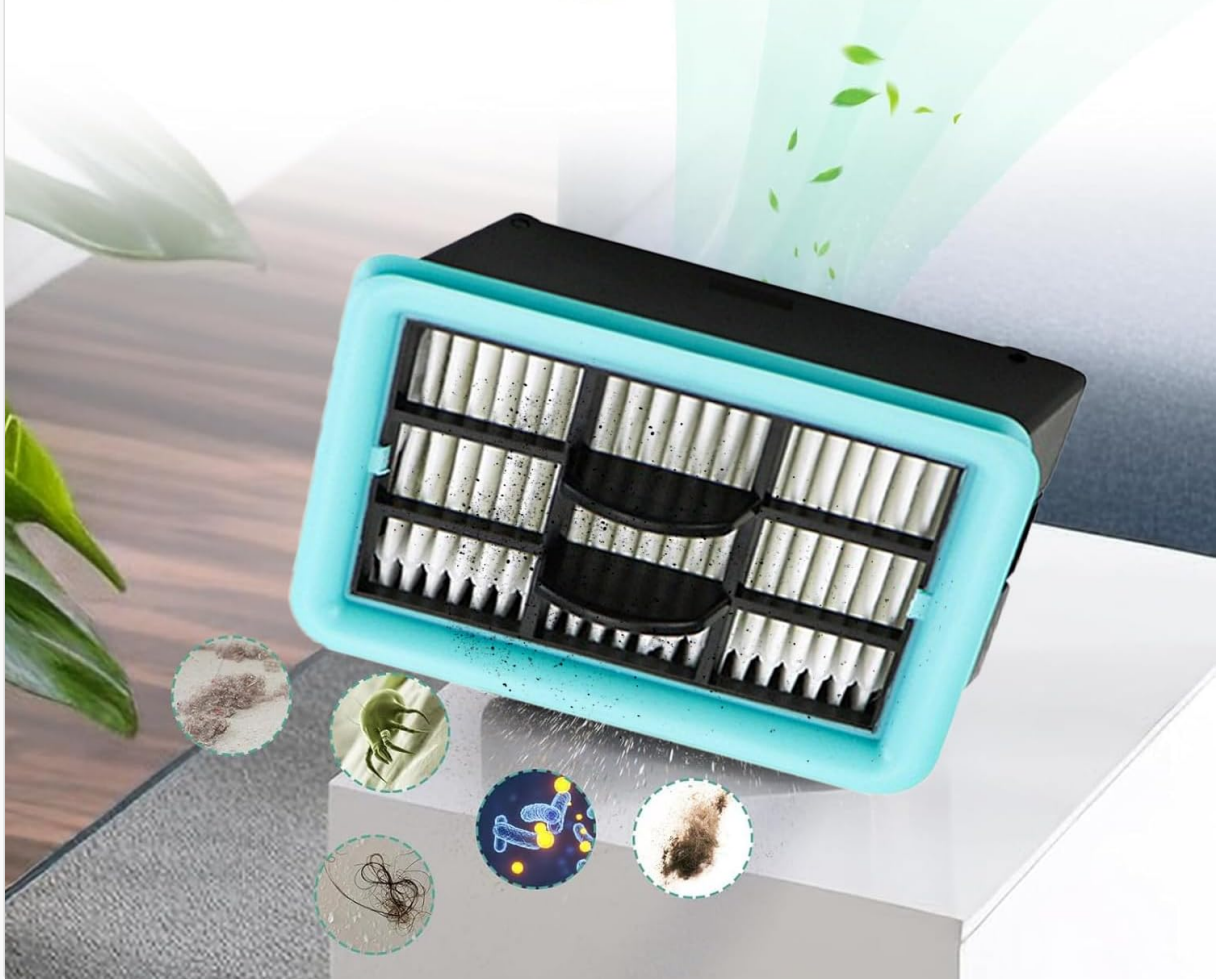
Figure 4: High Efficiency Filtration of the HEPA filter.

filter replacement captures 99.99% of dirt in the air from small to 0.1 microns