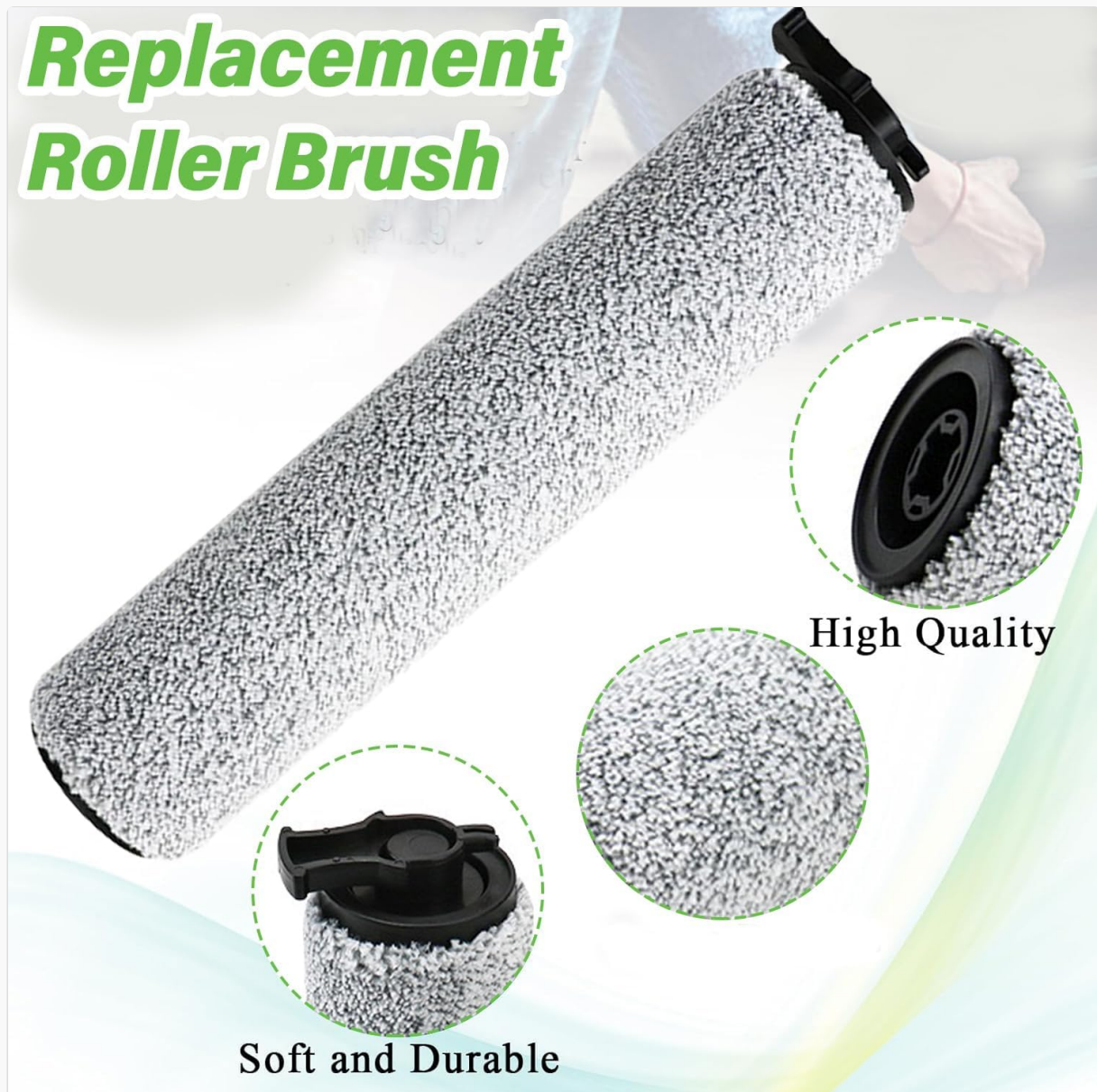
Figure 3: Replacement Roller Brush details.

7. Replace Cover: Reattach the brush roll cover, ensuring it snaps securely into place.