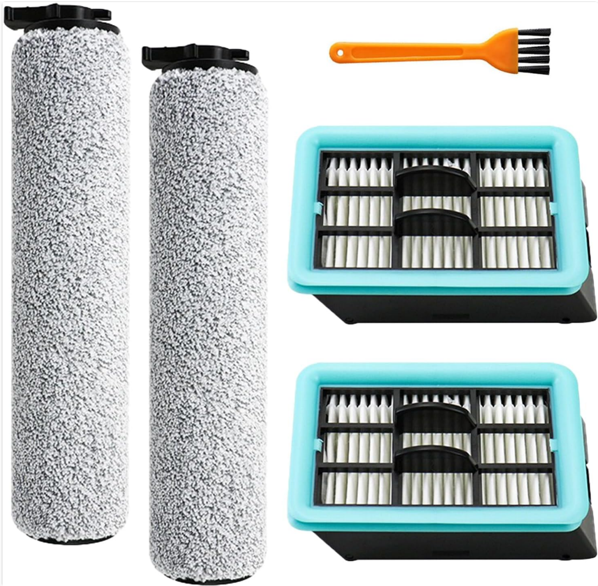
Figure 1: Overview of the replacement parts kit.

This image displays the full contents of the replacement kit: two grey and white roller brushes, two blue and black HEPA filters, and a small orange cleaning brush.