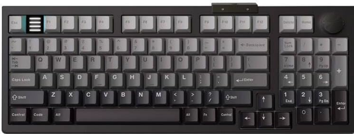
An overhead view of the Darmoshark TOP98 Gaming Keyboard, showcasing its full layout including the alphanumeric keys, function row, navigation cluster, numeric keypad, and a rotary knob in the top right corner. The keyboard features a black chassis with dark grey and black keycaps.

The Darmoshark TOP98 Gaming Keyboard features a compact yet functional layout, designed for both gaming and productivity.