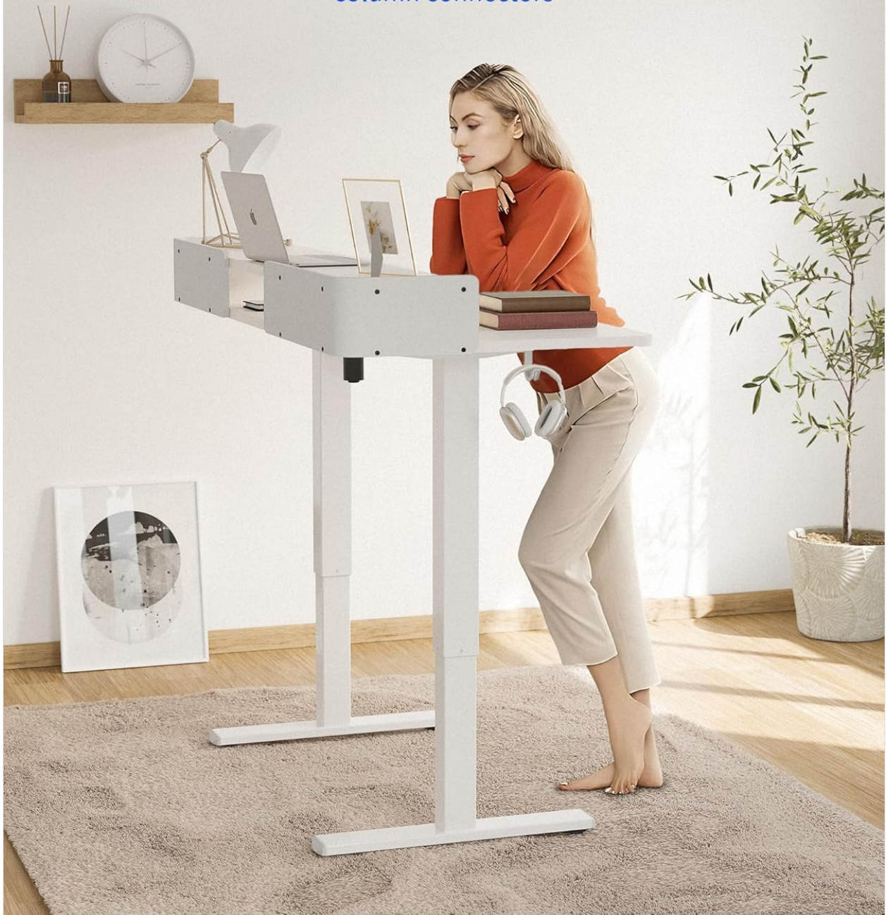
Image 4.1: The desk's sturdy steel frame and aviation-grade lift column connectors ensure stability.

Sturdy frame with aerospace-grade lifting column connectors