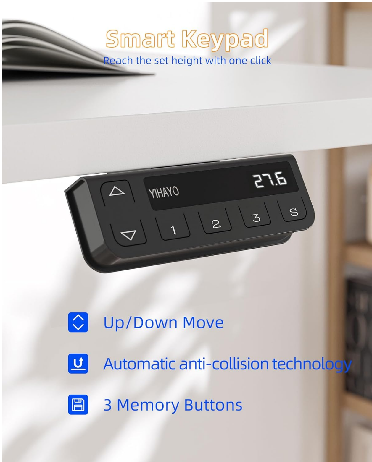
Image 5.2: The smart keypad allows for precise height adjustments and saving up to three preferred positions.