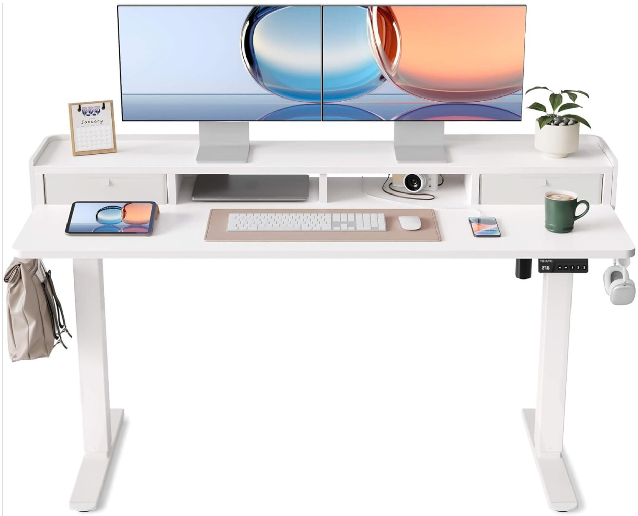
Image 1.1: The YIHAYO Electric Standing Desk with integrated monitor stand and drawers, showcasing its design and features.