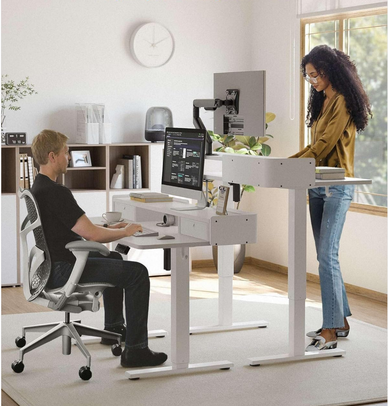
Image 5.1: Illustrates the desk's height adjustment capabilities, accommodating both sitting and standing postures.