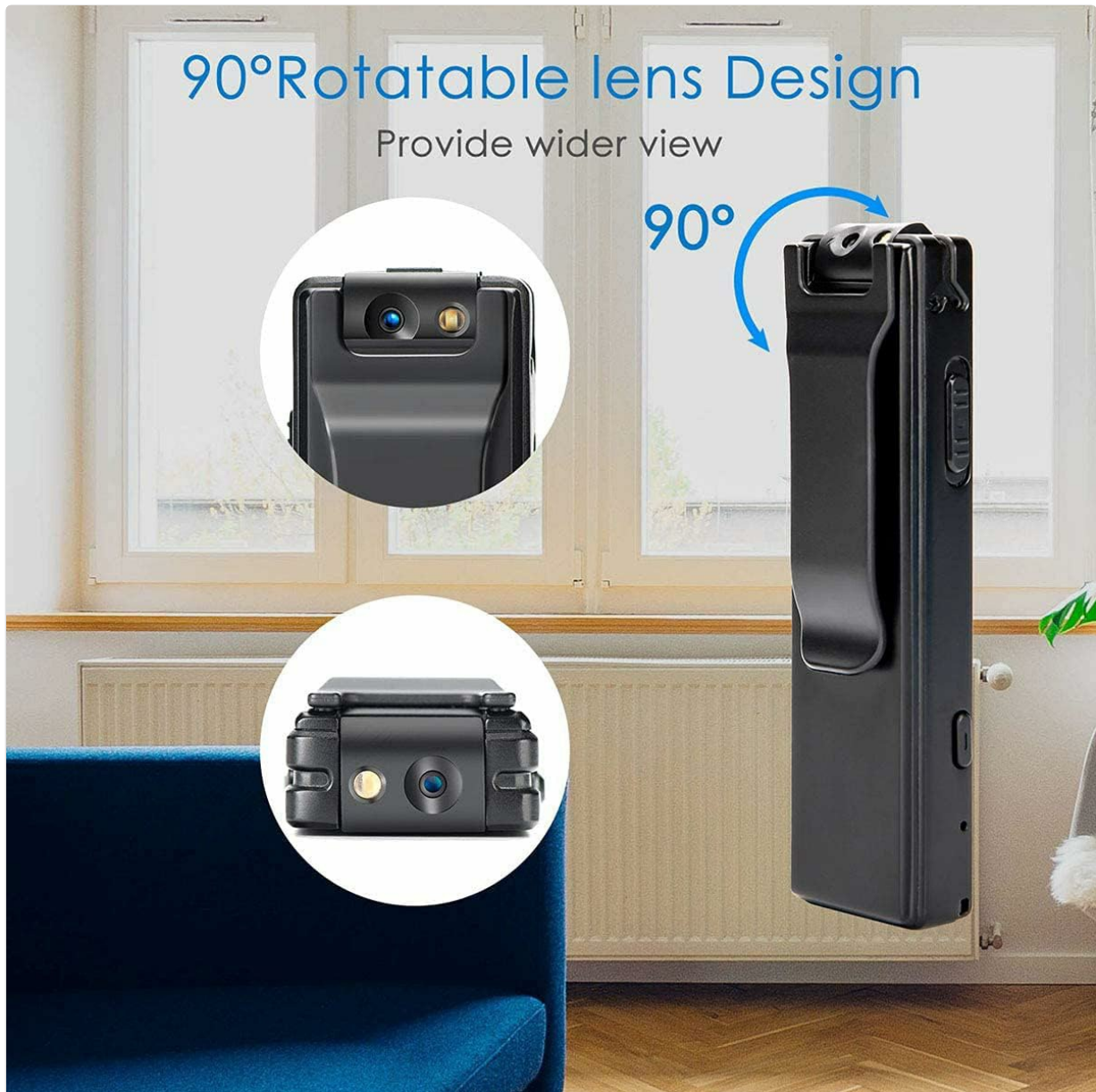
Image: The CAPOXO camera featuring its 90-degree rotatable lens, allowing for flexible recording angles.