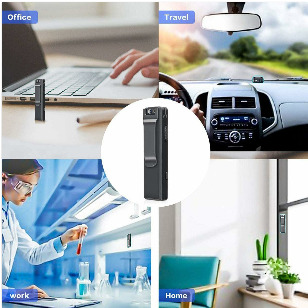
Image: The CAPOXO camera shown in different usage environments, including an office, car, laboratory, and home, demonstrating its versatility.