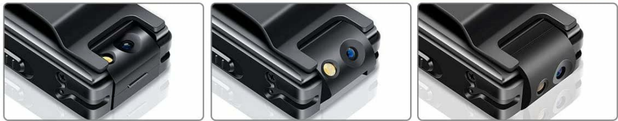
Image: Close-up view of the CAPOXO camera's rotatable lens mechanism, highlighting its design for wider field of view.