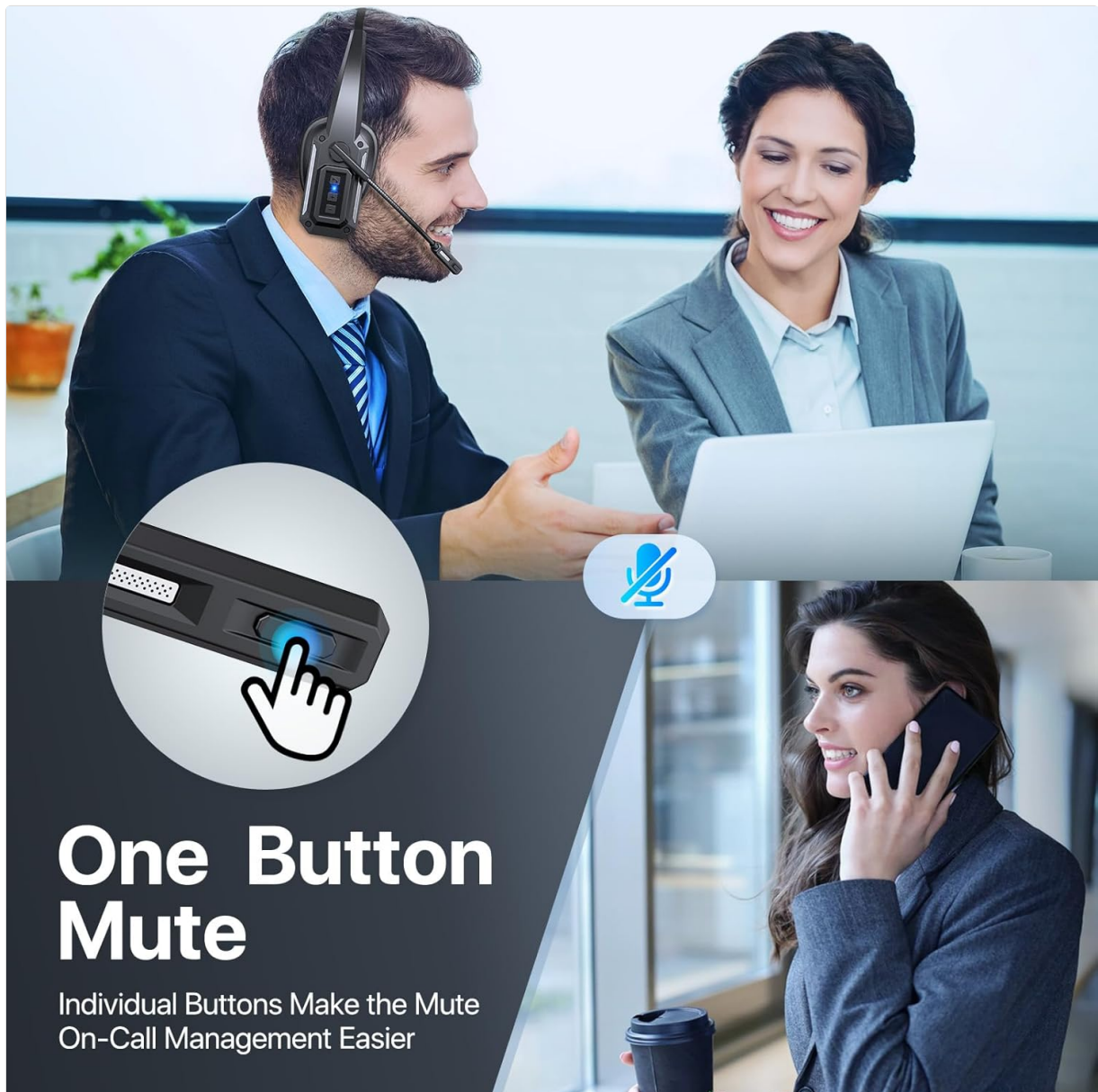
Image: The mute button is located on the microphone boom for quick access during calls.