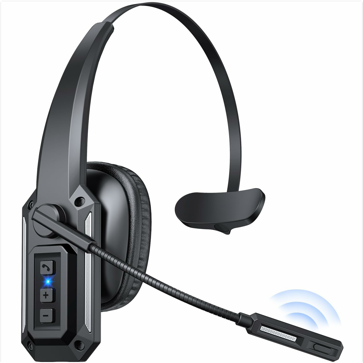
Image: The CPTEA A18 Trucker Bluetooth Headset, a wireless headset designed for clear communication.