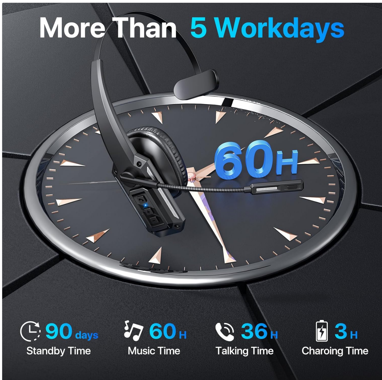
Image: Visual representation of the headset's impressive battery life, including 90 days standby, 60 hours music, 36 hours talk time, and 3 hours charging time.

A full charge provides up to 60 hours of music playback or 36 hours of talk time, with a standby time of over 90 days.