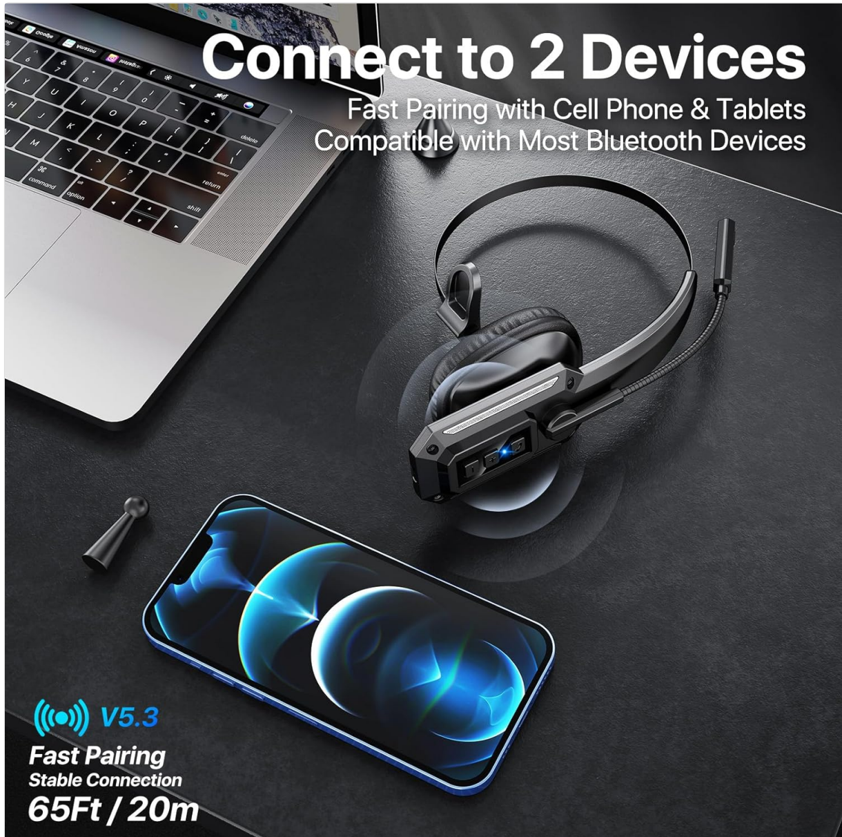
Image: The headset supports dual-device connection, allowing simultaneous pairing with a phone and another device like a laptop.

If no connection is made within 5 minutes, the headset will automatically shut down. To re-enter pairing mode, power off and then power on the headset again.