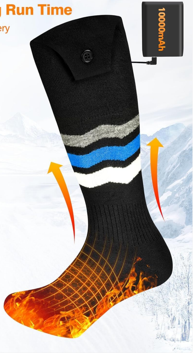
Image: Battery capacity and temperature settings with corresponding run times.

High max temperature (158°F) | Up to 10.5 hours battery life