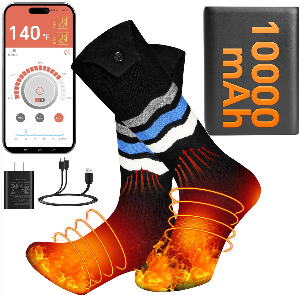
Image: Overview of WAMOVAL Heated Socks components, including batteries and charging accessories.

Your browser does not support the video tag.