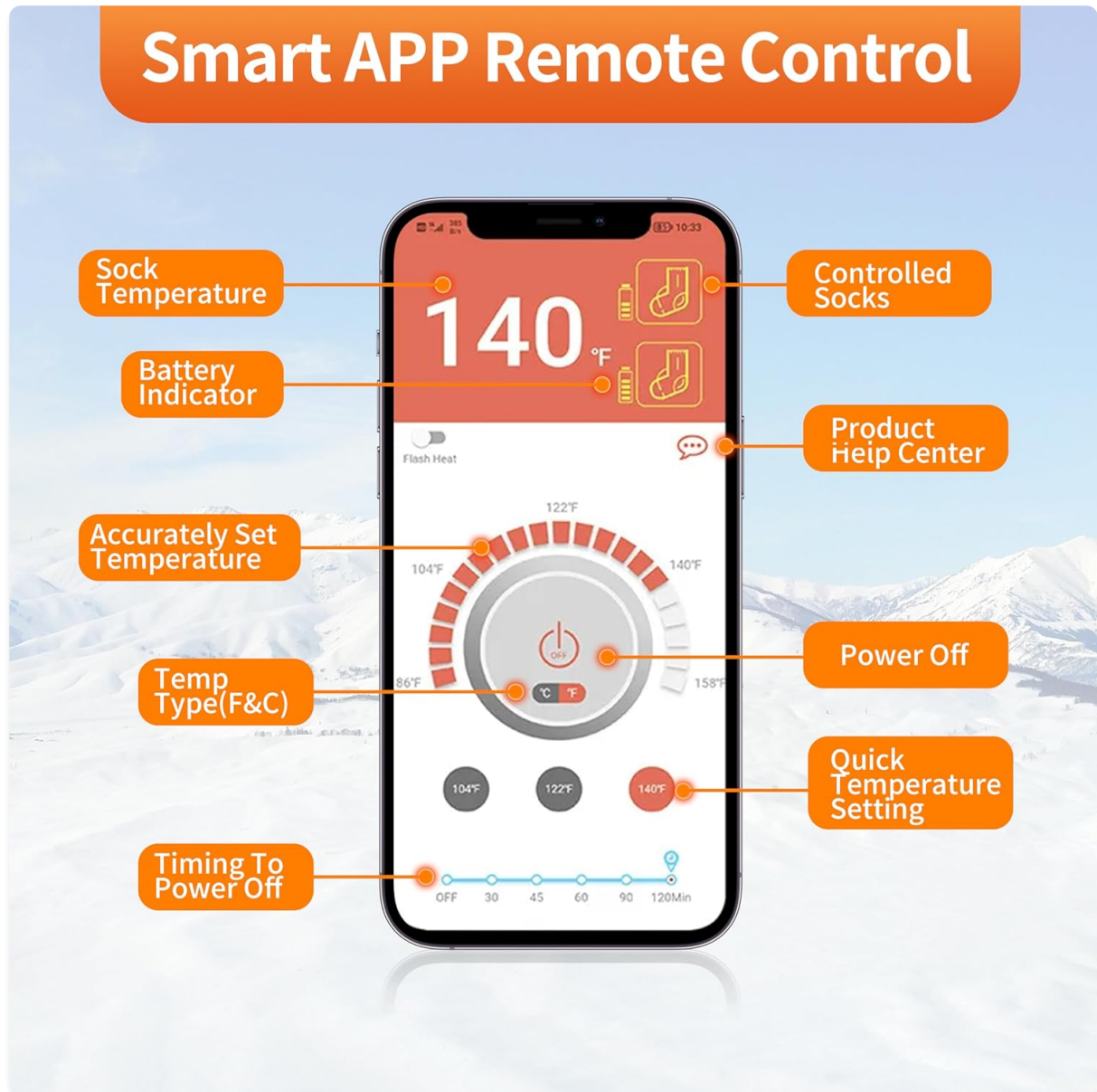
Image: Detailed view of the smartphone application for controlling the heated socks.

Your browser does not support the video tag.