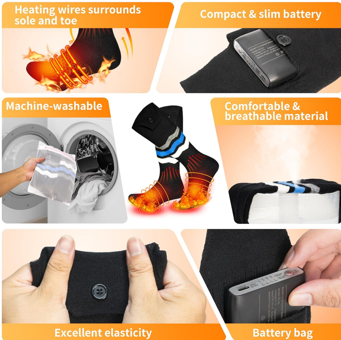
Image: Visual guide to washing instructions and battery placement.