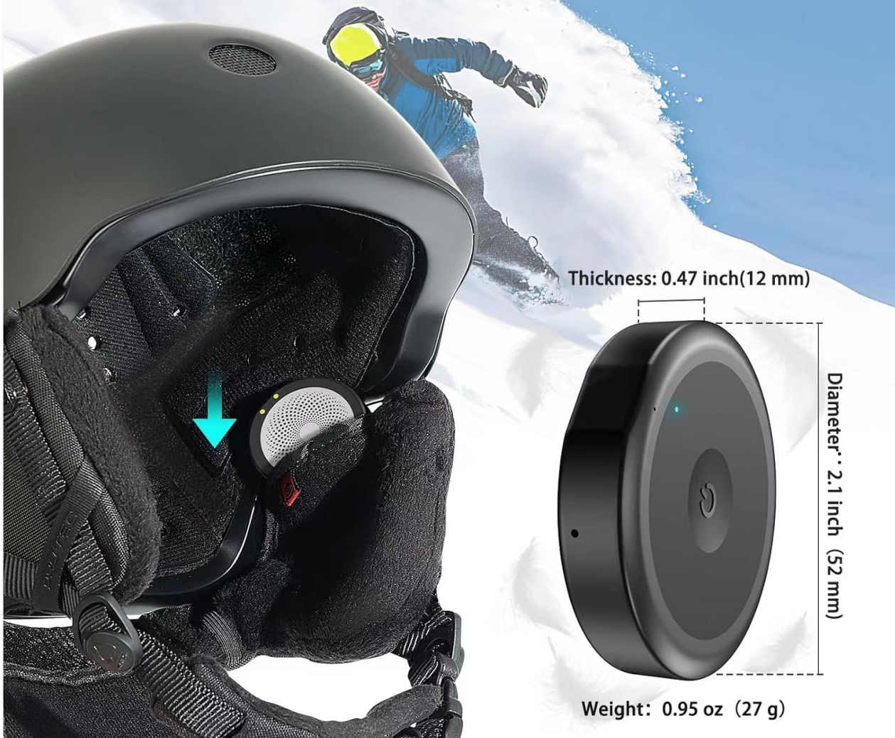
Image: A visual representation of the speaker's compact dimensions, highlighting its slim profile for helmet integration.