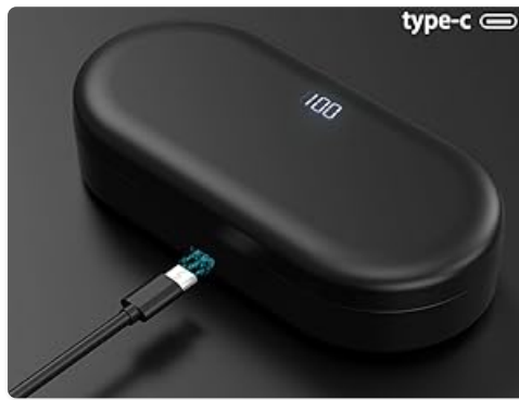
Image: The charging case with the USB-C cable connected, illustrating the charging process.