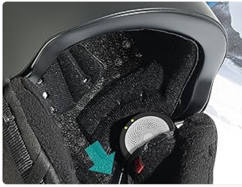
Image: A hand demonstrating the insertion of a speaker into a helmet's ear flap.