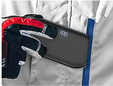
Image: The charging case held in a hand, displaying the battery percentage on its LED screen.