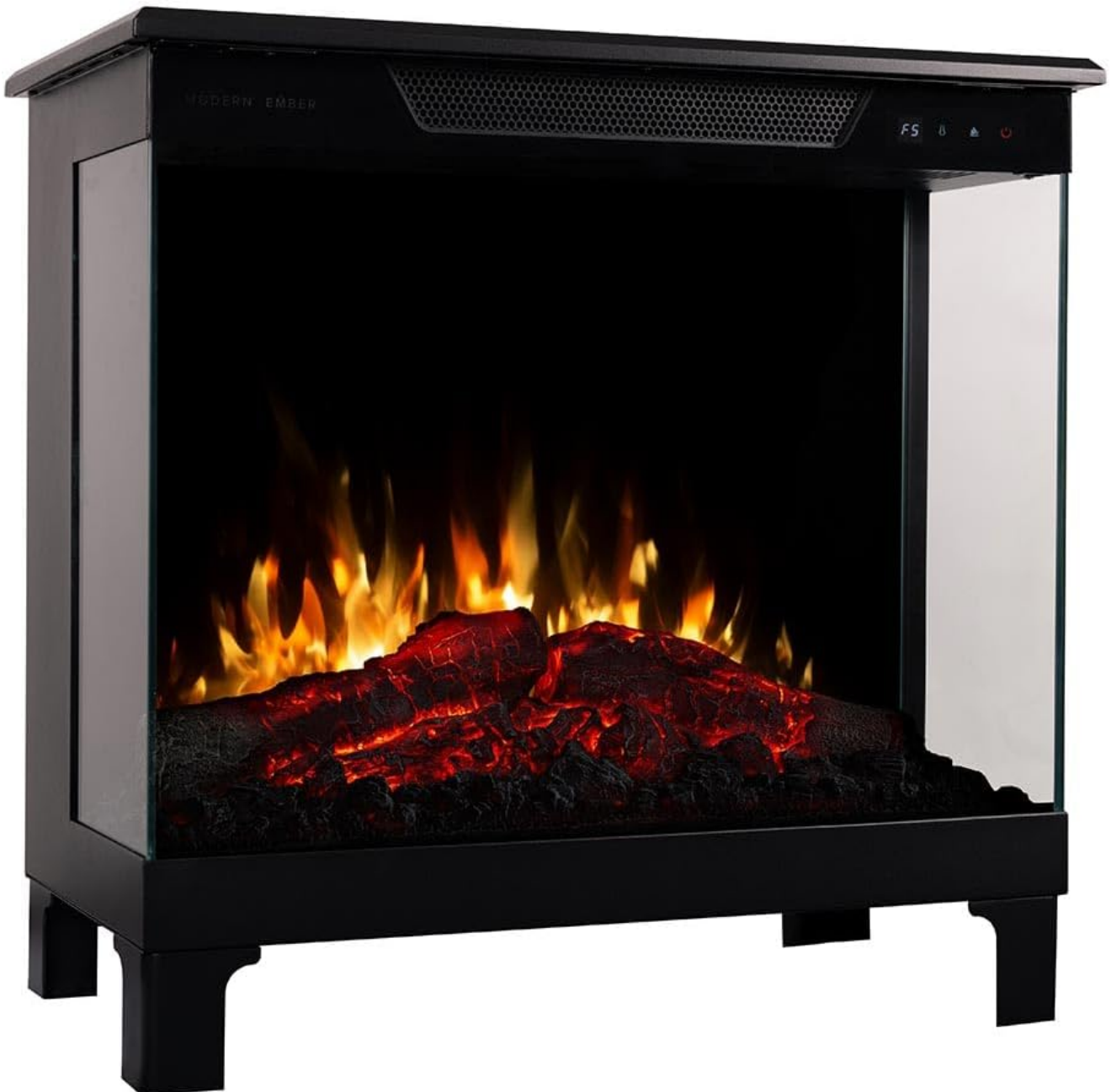
Image 1: Front view of the Modern Ember Skyline Electric Fireplace, showcasing the realistic flame effect and three-sided glass design.

This electric fireplace is designed to provide supplemental heating and ambient flame effects for indoor spaces. It features smart control options, multiple flame colors, and an optional crackling sound effect.