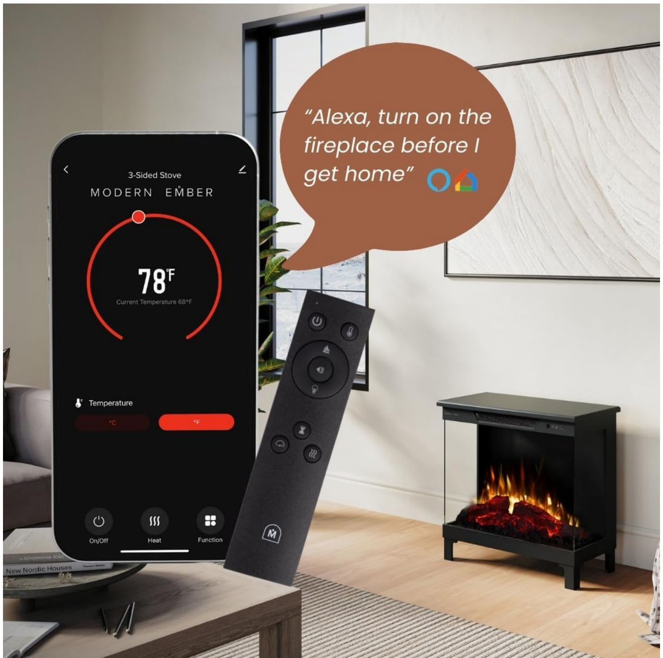
Image 5: Smartphone app interface for smart control and remote control.