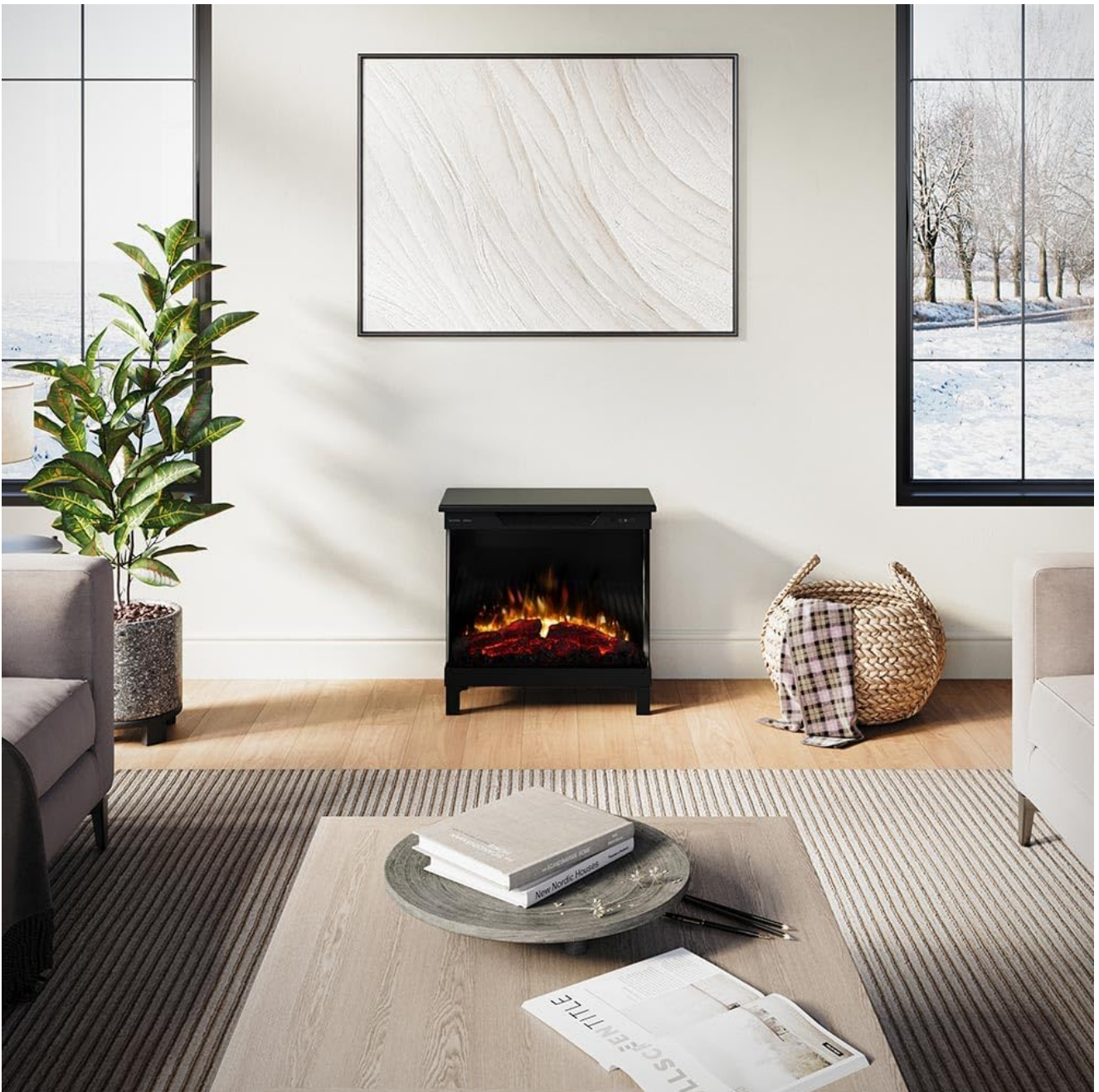
Image 2: The electric fireplace positioned in a room, demonstrating suitable placement.