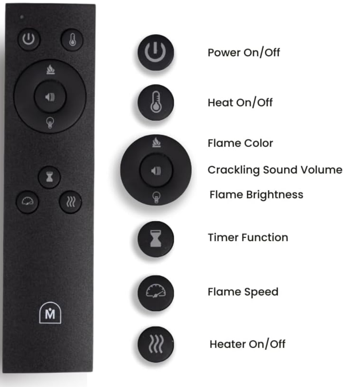
Image 4: Remote control with labeled buttons for various functions.