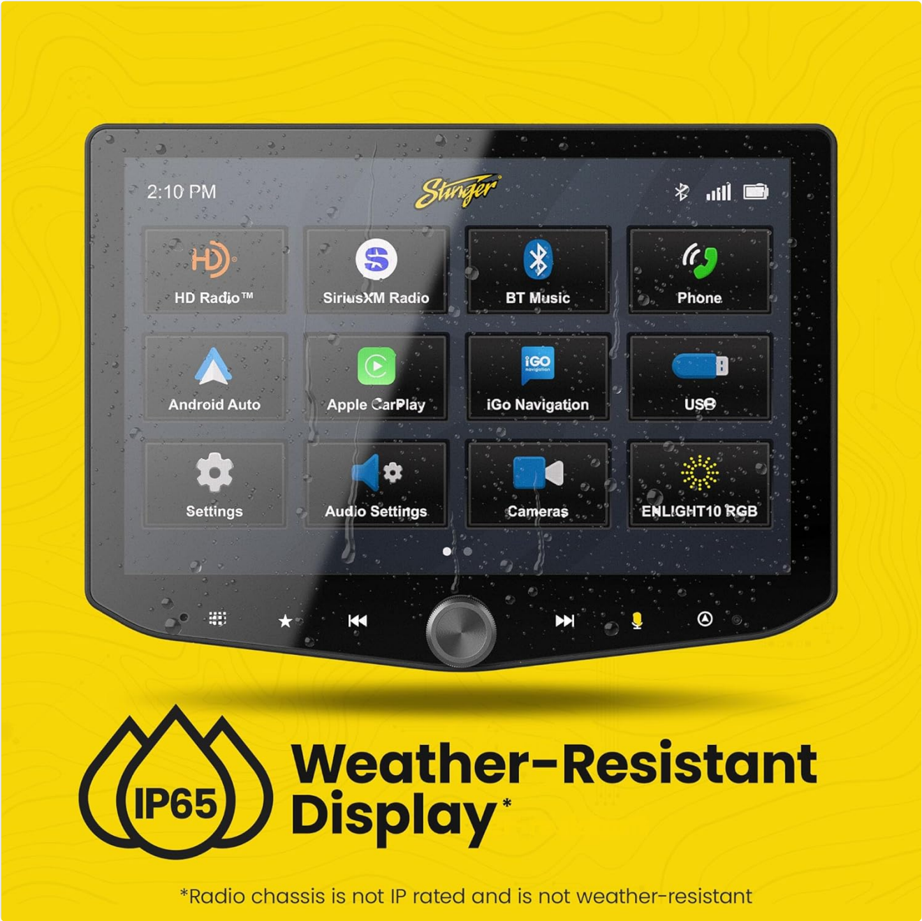
Image: The Stinger HORIZON10 display with water droplets, demonstrating its IP65 weather-resistant feature.

If you encounter issues with your Stinger HORIZON10, refer to the following common problems and solutions: