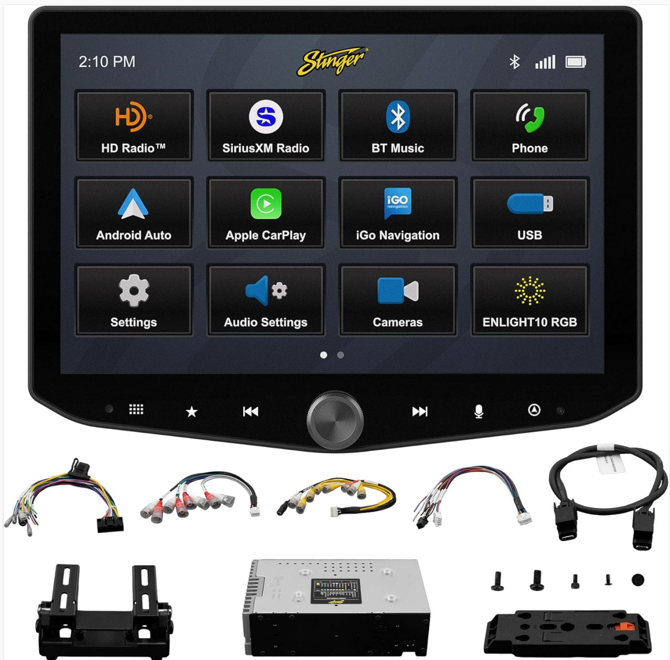
Image: All components included with the Stinger HORIZON10 car stereo system.