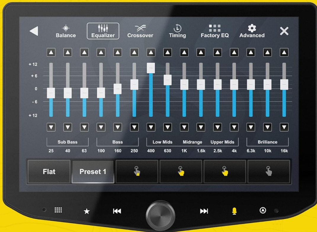
Image: Screenshot of the Stinger HORIZON10's advanced audio settings, showing the 15-band equalizer.