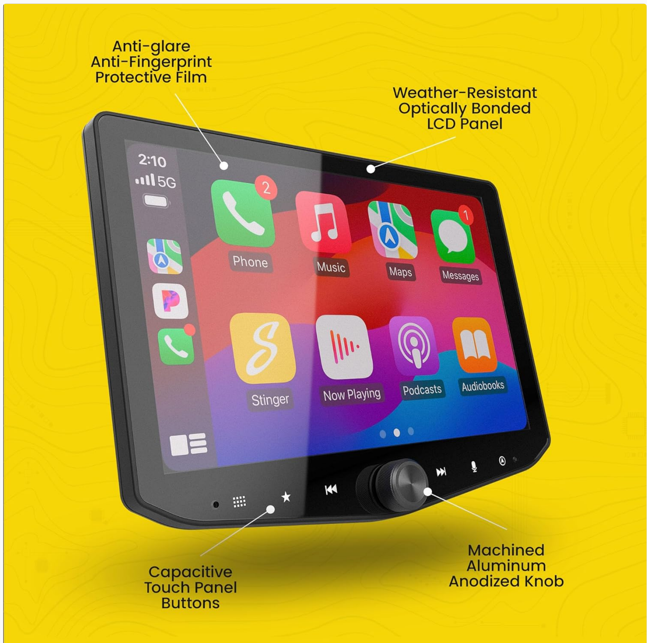
Image: Detailed view of the Stinger HORIZON10 touchscreen, highlighting its capacitive touch buttons and anodized knob.

The HORIZON10 features a large 10.1" 1280x800 HD floating touchscreen with anti-glare and anti-fingerprint film protection. Navigate through menus and applications by tapping, swiping, and pinching on the screen. The capacitive touch panel buttons and machined aluminum anodized knob provide additional tactile control.