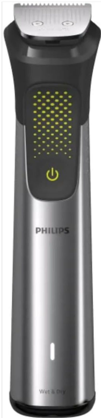
Image: The main Philips Series 9000 All-In-One Trimmer unit, showcasing its sleek design and power button. The Philips Series 9000 All-In-One Trimmer features a high-quality stainless steel handle with an ergonomic rubber grip for comfortable and controlled use. It is equipped with self-sharpening stainless steel blades designed for long-lasting performance without the need for oil. The device is water-resistant, allowing for convenient use in the shower and easy cleaning under running water.