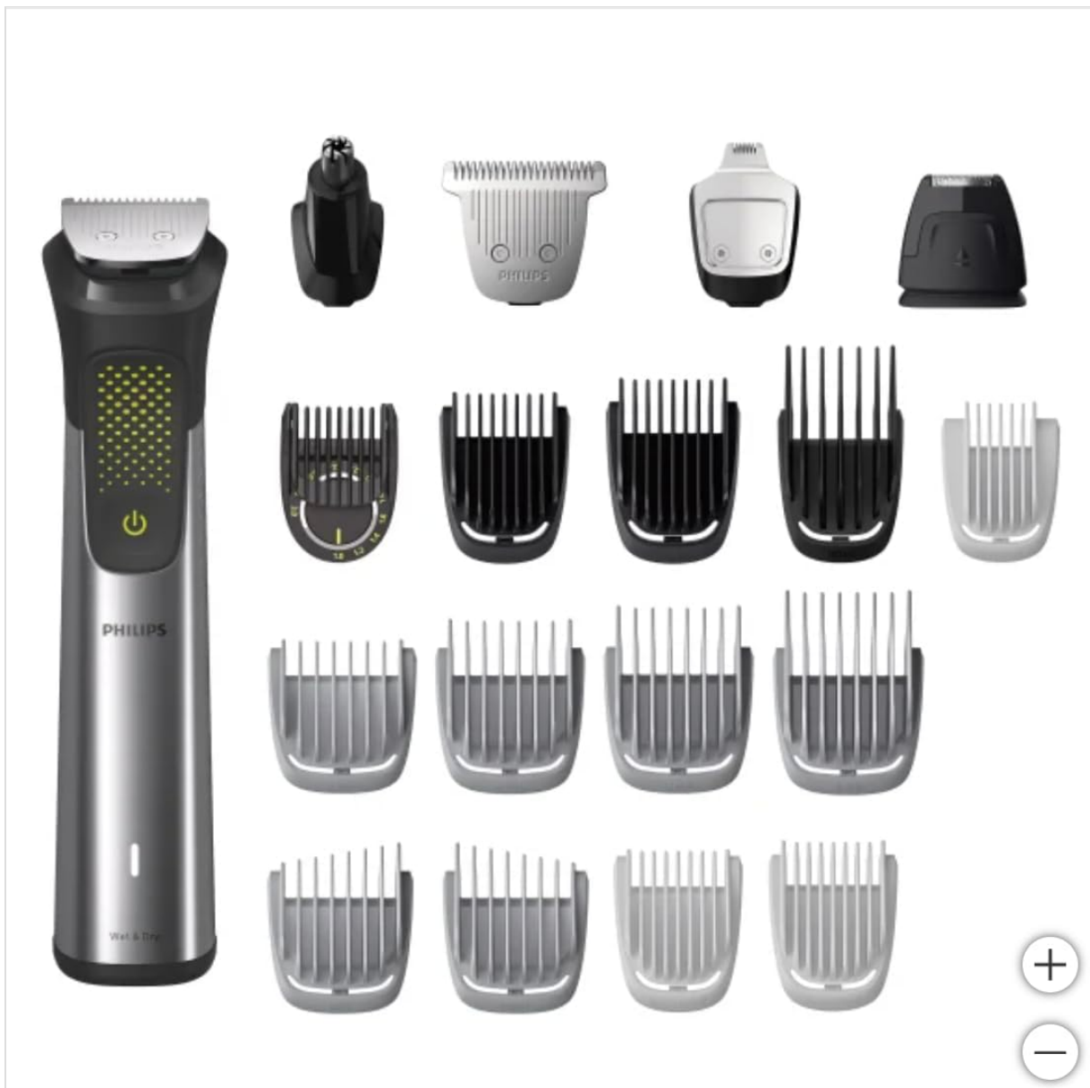
Image: The Philips Series 9000 All-In-One Trimmer with all its attachments, including various combs, a nose/ear trimmer, and different trimming heads.

Your Philips Series 9000 All-In-One Trimmer package includes the following items: