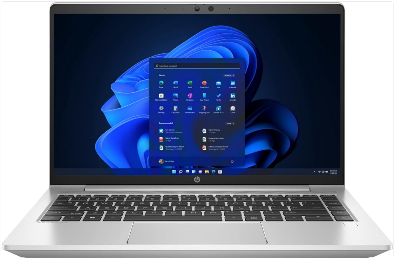
Figure 1: Front view of the HP ProBook 445 G10 laptop with the lid open, showcasing the display and keyboard.