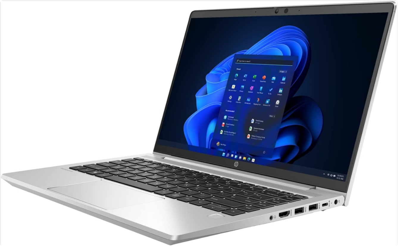
Figure 4: Angled view of the HP ProBook 445 G10, providing a comprehensive look at its open form factor.