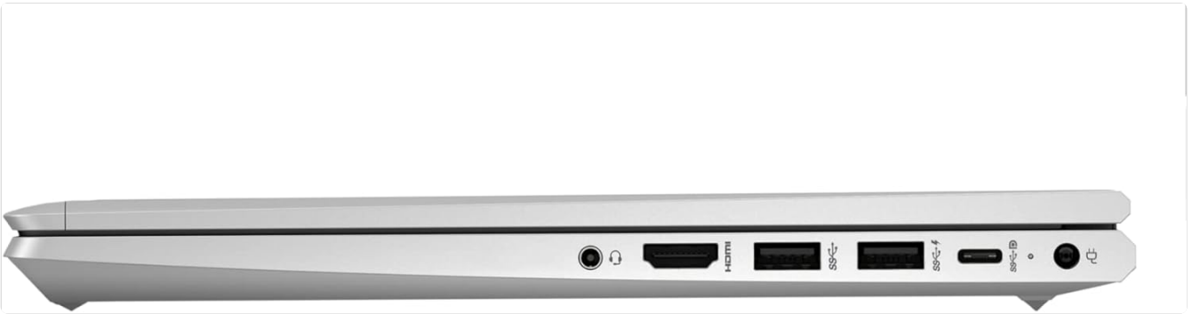
Figure 3: Side view of the HP ProBook 445 G10, illustrating the available ports including USB, HDMI, and audio jack.