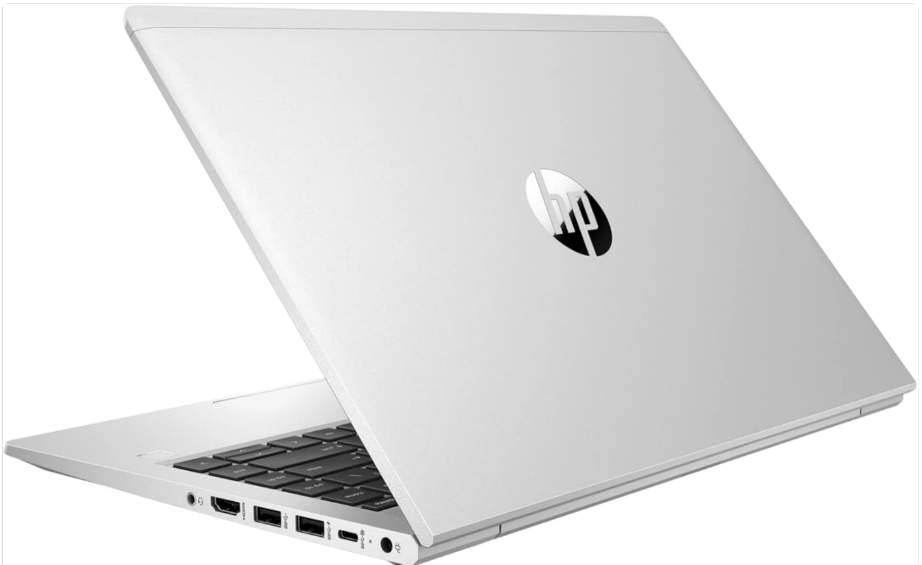
Figure 2: Rear view of the HP ProBook 445 G10 laptop with the lid closed, highlighting the sleek design and HP logo.