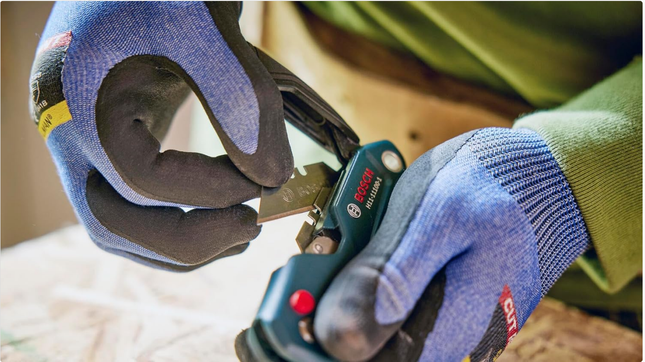
Image 4.1: A user wearing gloves demonstrates the process of installing a new utility blade into the BOSCH H11-11100-1 Folding Utility Knife, highlighting the tool-free blade change mechanism.

6. Test the blade security by gently pulling on it.