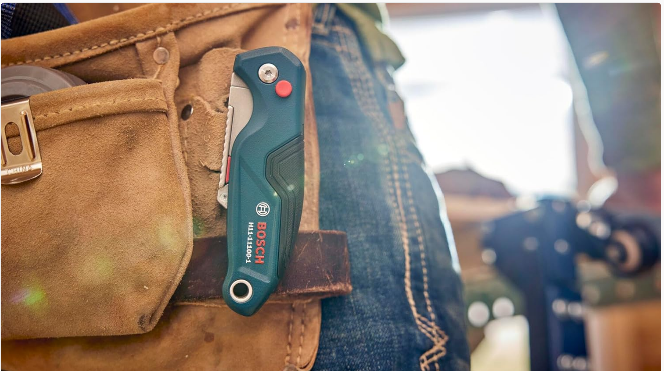
Image 5.4: The BOSCH H11-11100-1 Folding Utility Knife is shown securely clipped to a worker's belt, demonstrating its portability and convenient access.