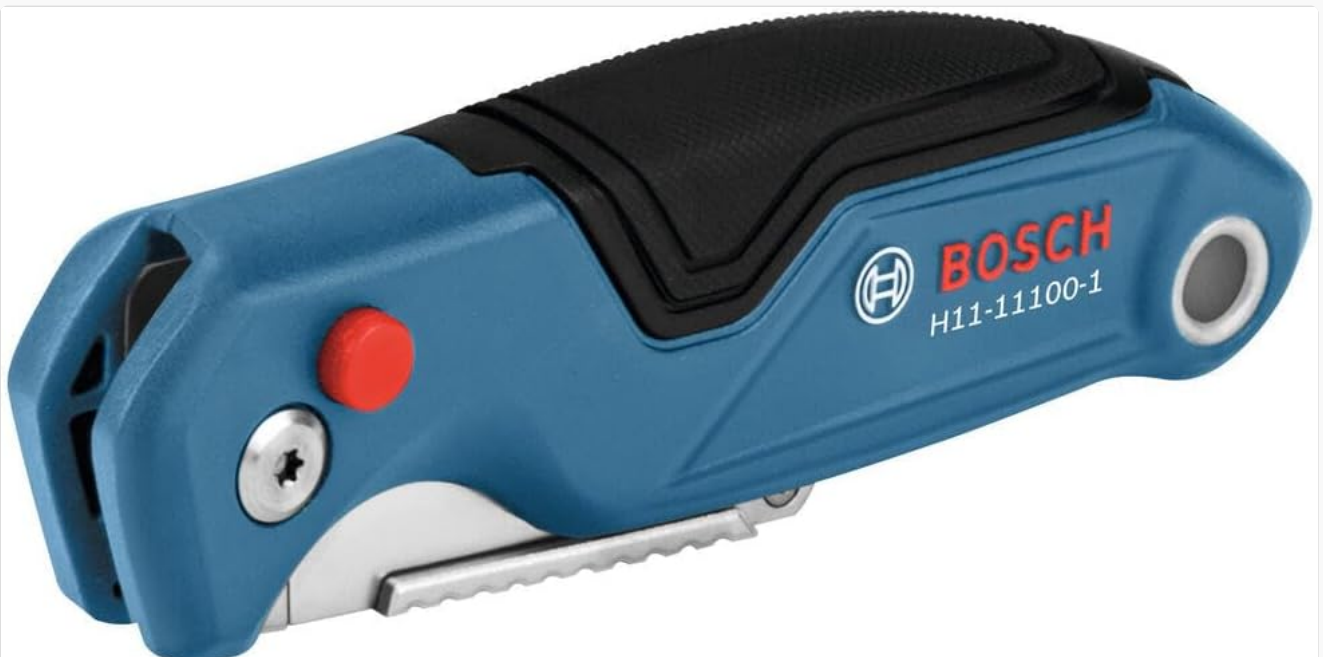
Image 5.1: The BOSCH H11-11100-1 Folding Utility Knife shown in its compact, folded state, ready for storage or transport.