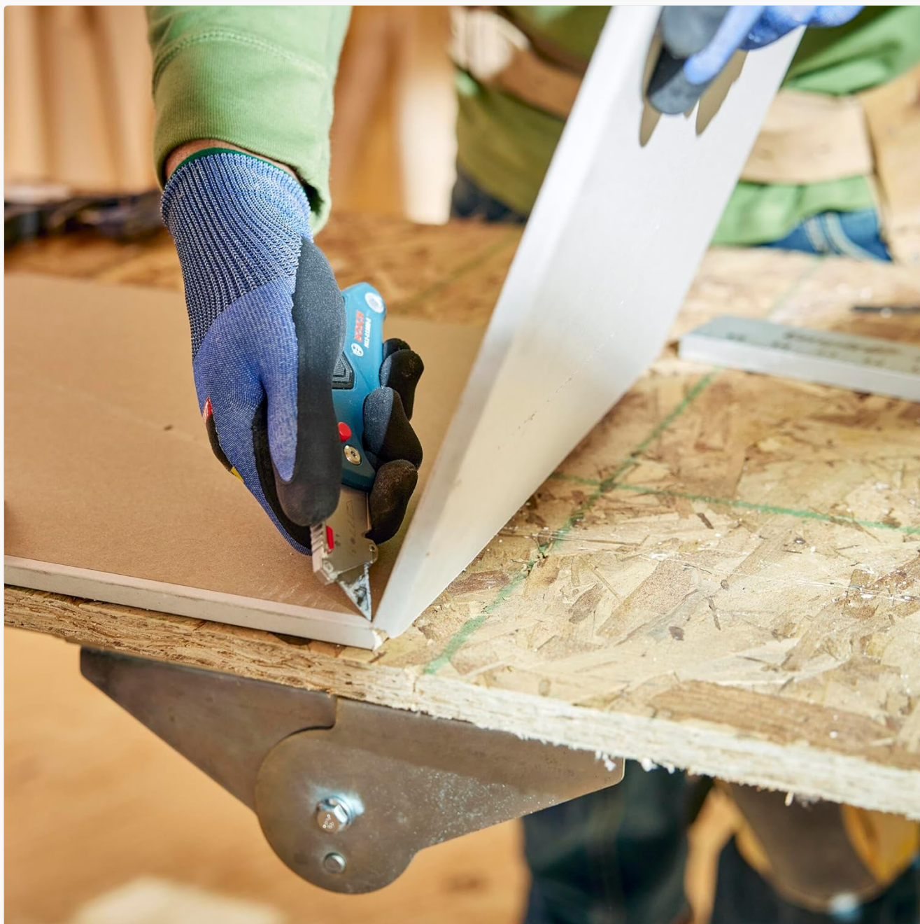
Image 5.2: A gloved hand uses the BOSCH H11-11100-1 Folding Utility Knife to precisely cut a piece of drywall on a workbench.