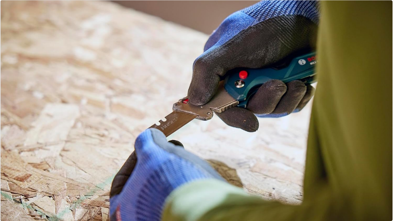
Image 6.1: A gloved hand demonstrates the removal of a used utility blade from the BOSCH H11-11100-1 Folding Utility Knife, utilizing the quick-release mechanism.

Replace blades as soon as they become dull to maintain cutting efficiency and safety. Refer to Section 4 for detailed blade installation steps.