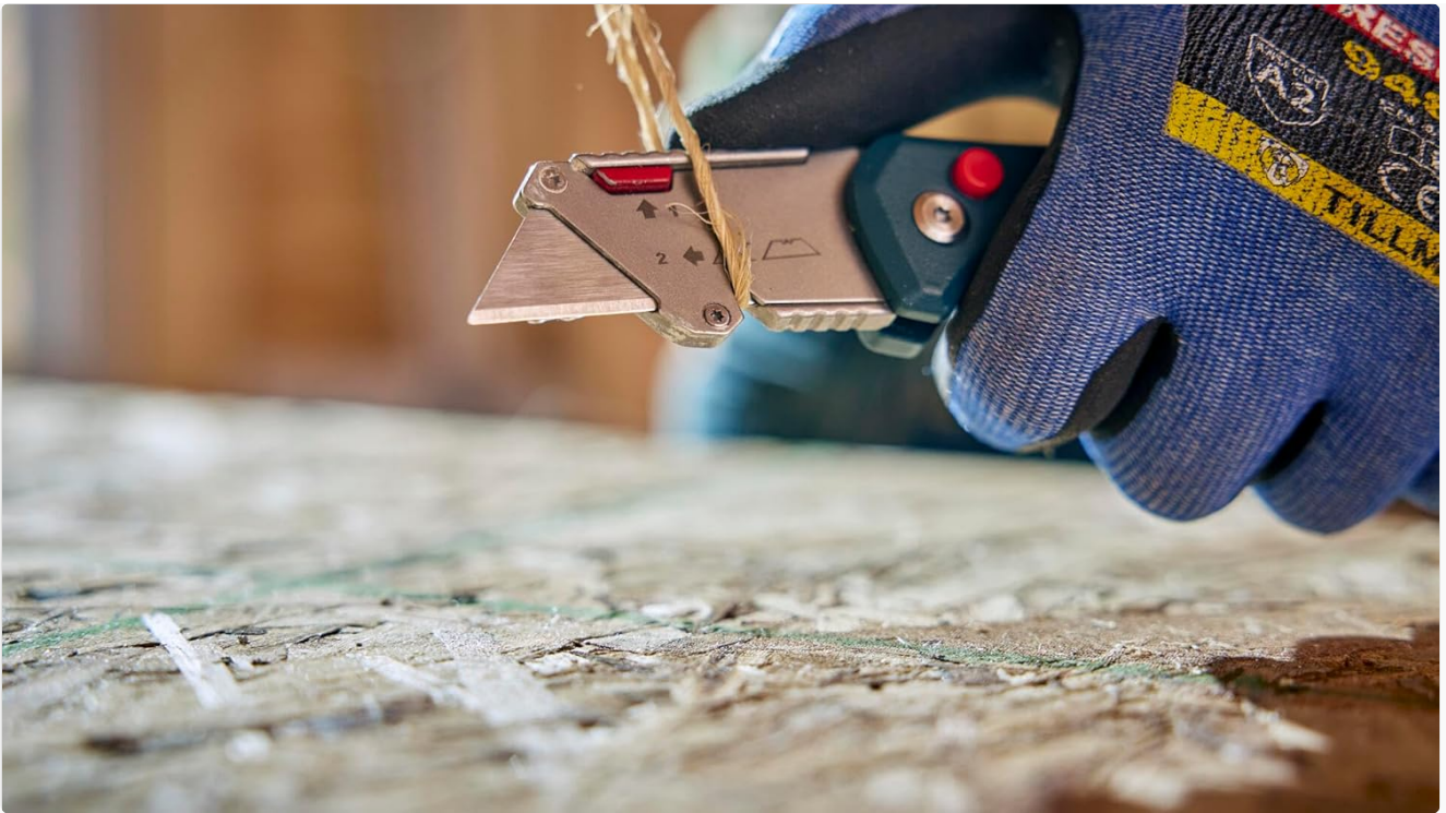
Image 5.3: A close-up view of a gloved hand using the integrated strap cutter on the BOSCH H11-11100-1 Folding Utility Knife to cut a piece of twine.