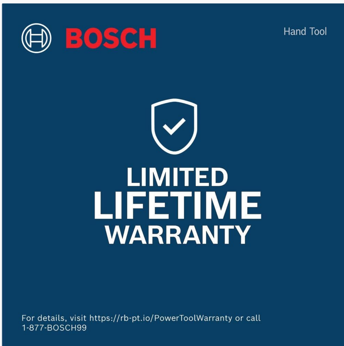
Image 9.1: A graphic indicating the BOSCH Limited Lifetime Warranty, with details available via a provided URL or phone number.

This BOSCH product is covered by a Limited Lifetime Warranty. For detailed information regarding warranty terms, conditions, and registration, please visit the official BOSCH website or contact customer support.