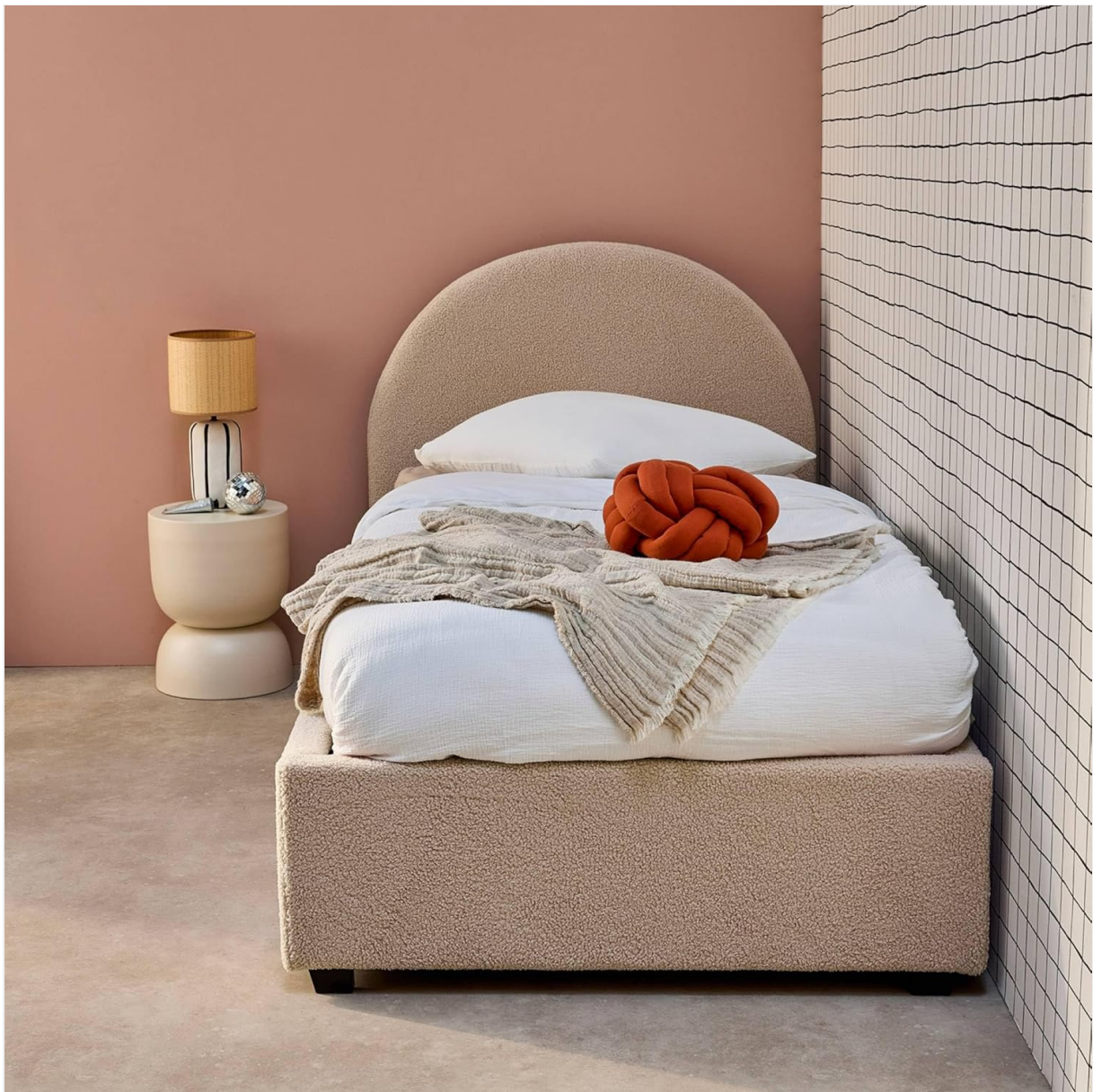
Figure 1: sweeek Cameron Storage Bed, fully assembled.