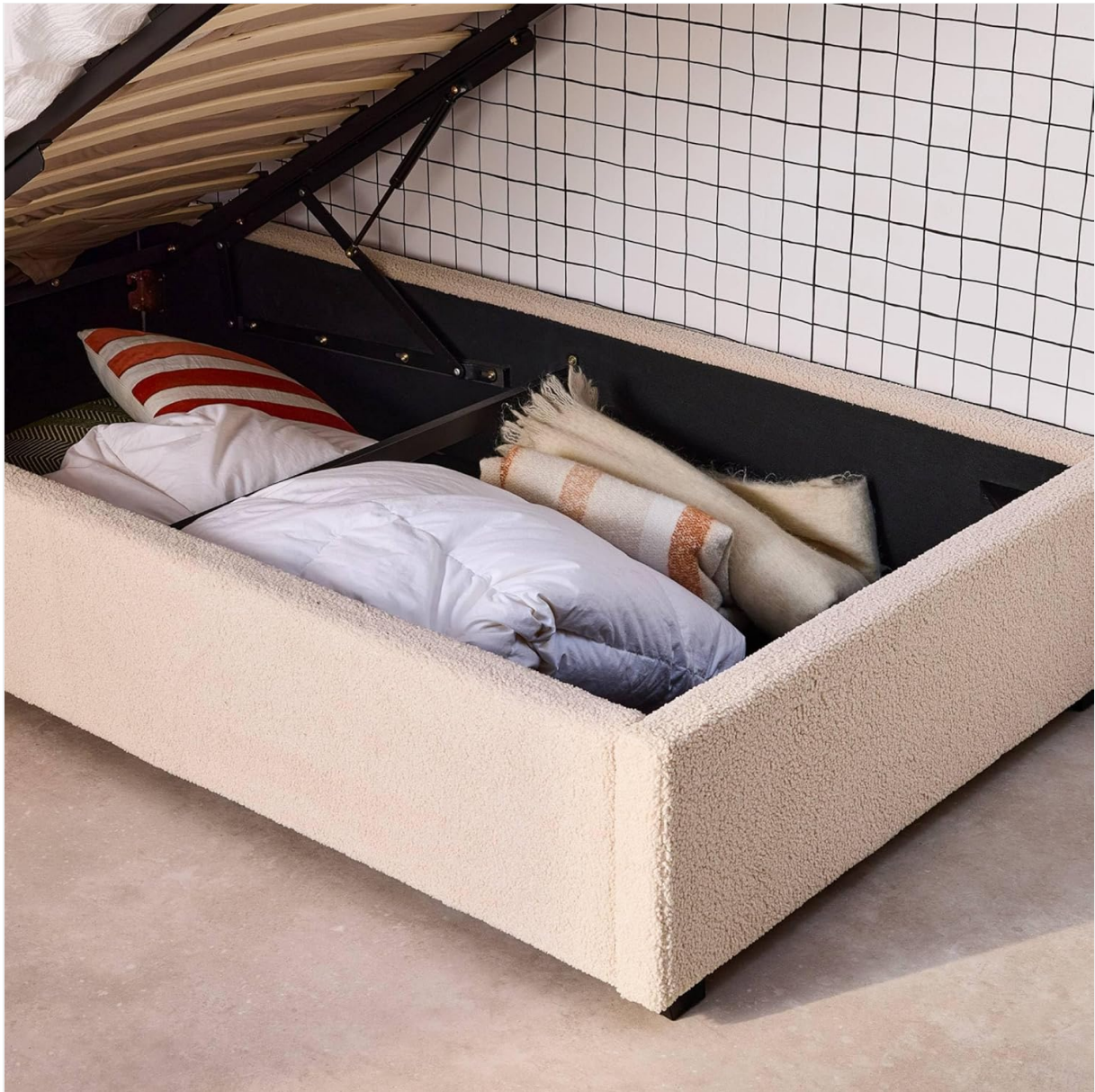
Figure 3: Storage compartment with slatted base lifted.