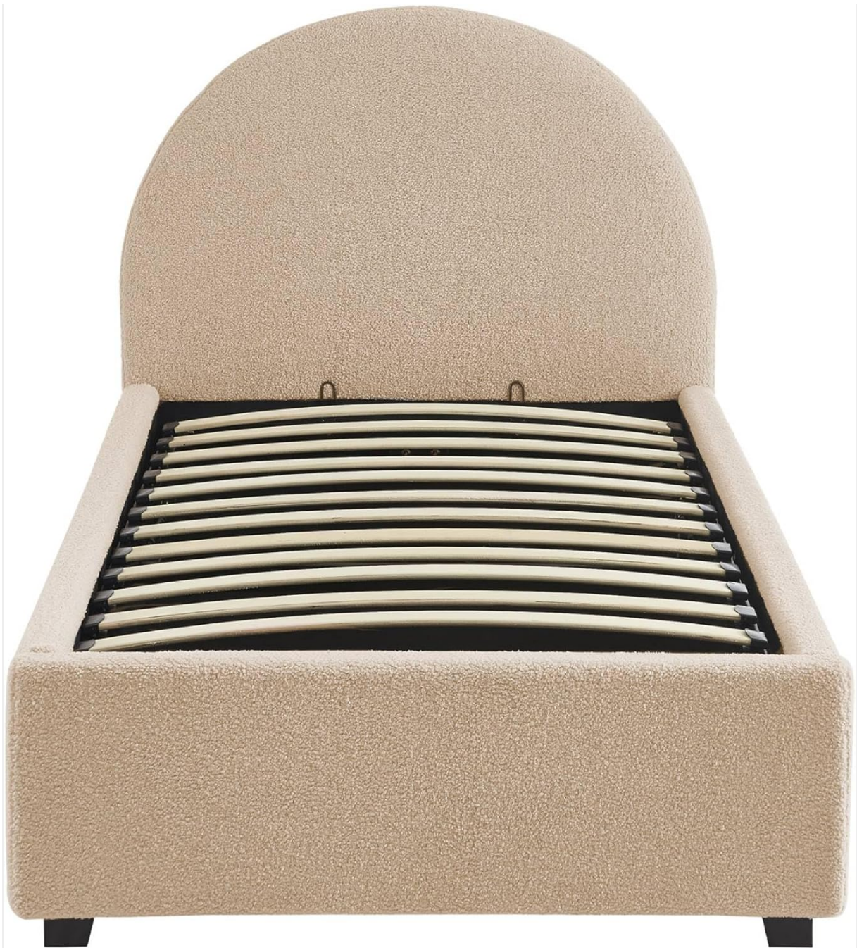
Figure 2: Detail of the slatted base and lifting mechanism.