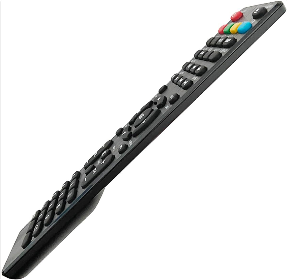
Figure 1: Effireli YK-ATV50UHD replacement remote control, side view, showing button layout.