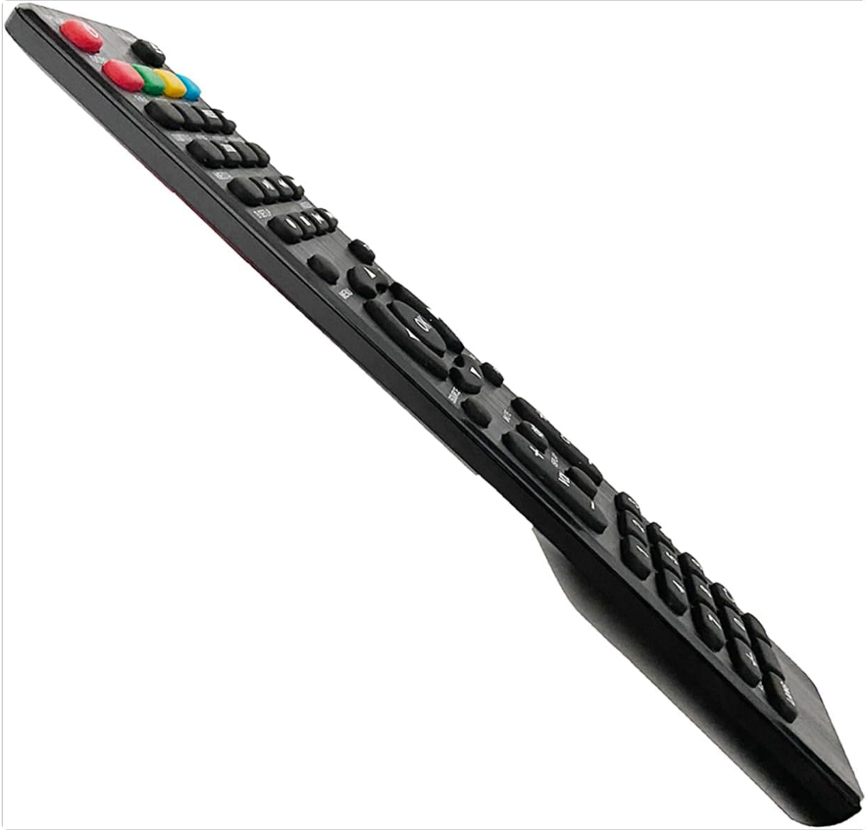
Figure 3: Effireli YK-ATV50UHD replacement remote control, angled view, highlighting the ergonomic design and button arrangement.