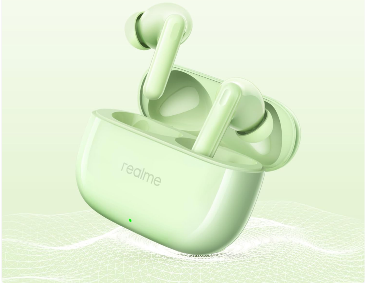
Image: realme Buds N1 earbuds in their charging case, visually representing the 360° Spatial Audio Effect.