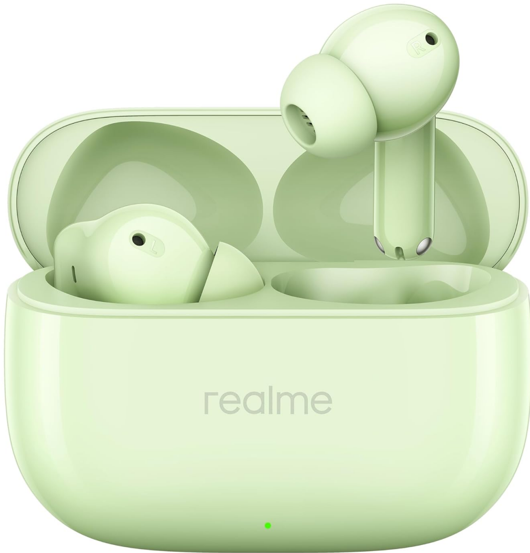
Image: realme Buds N1 True Wireless Earbuds in their Energizing Green charging case.