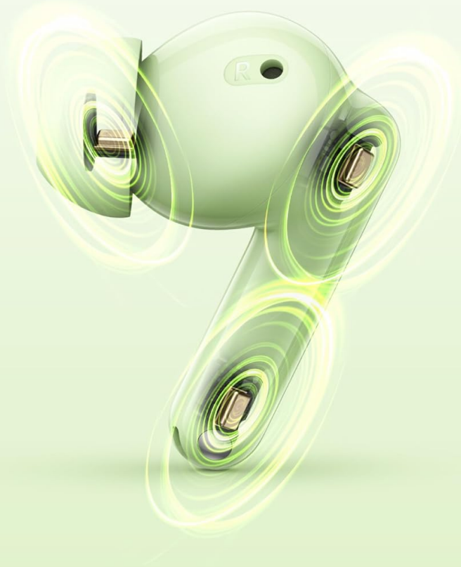
Image: An illustration of the realme Buds N1 earbud demonstrating its adjustable three-level noise reduction feature.