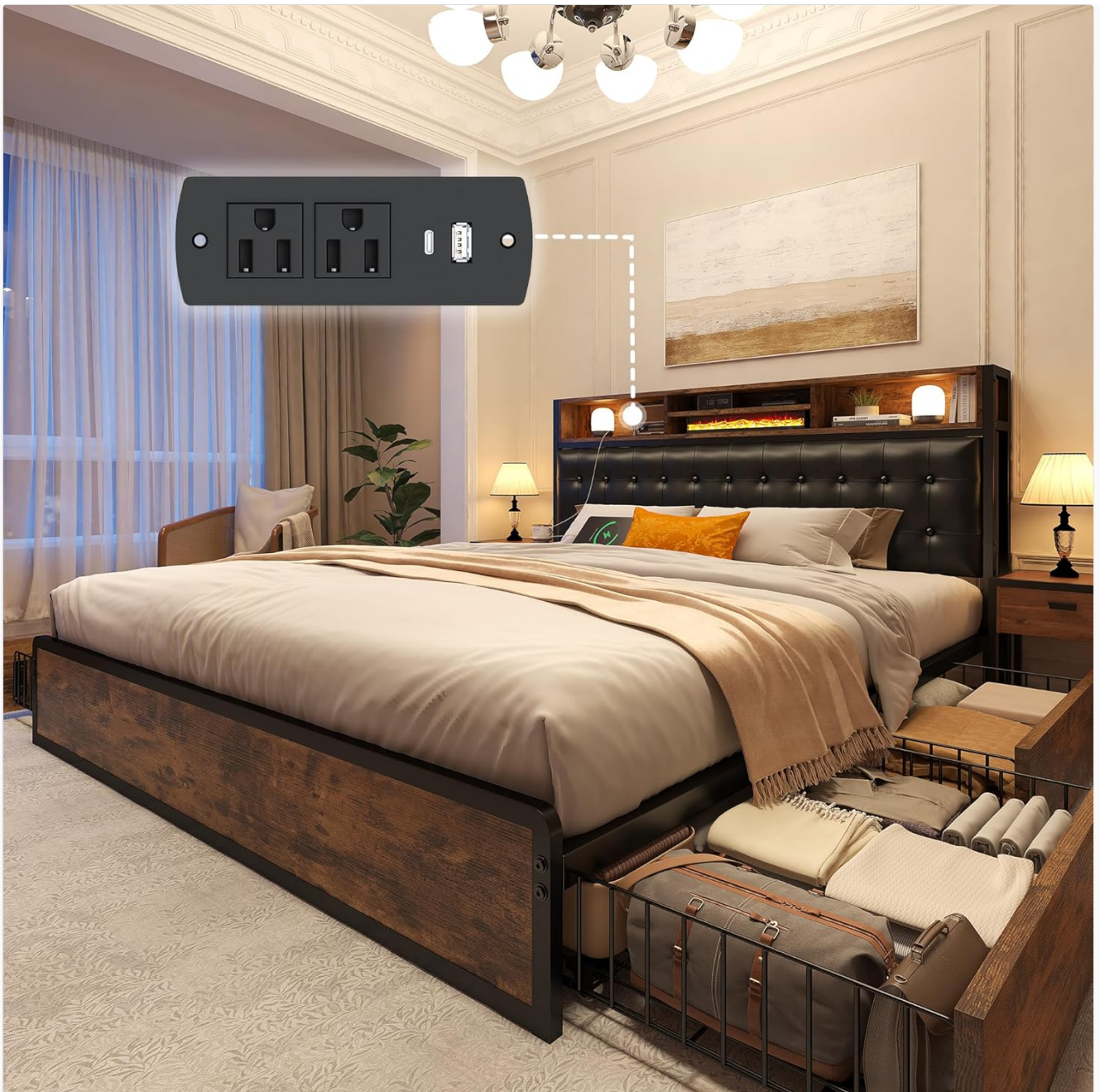
Figure 4.2: Fully assembled EnHomee Full Bed Frame.