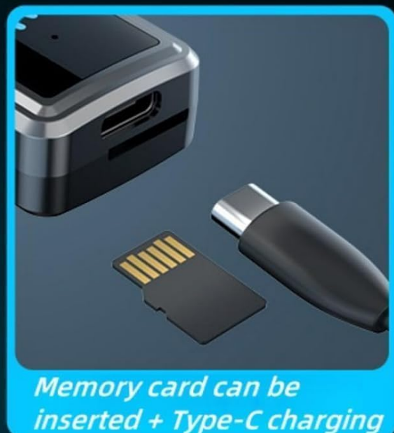
Image: Collage showing universal compatibility, three-button function, comfortable in-ear style, and memory card slot with Type-C charging.