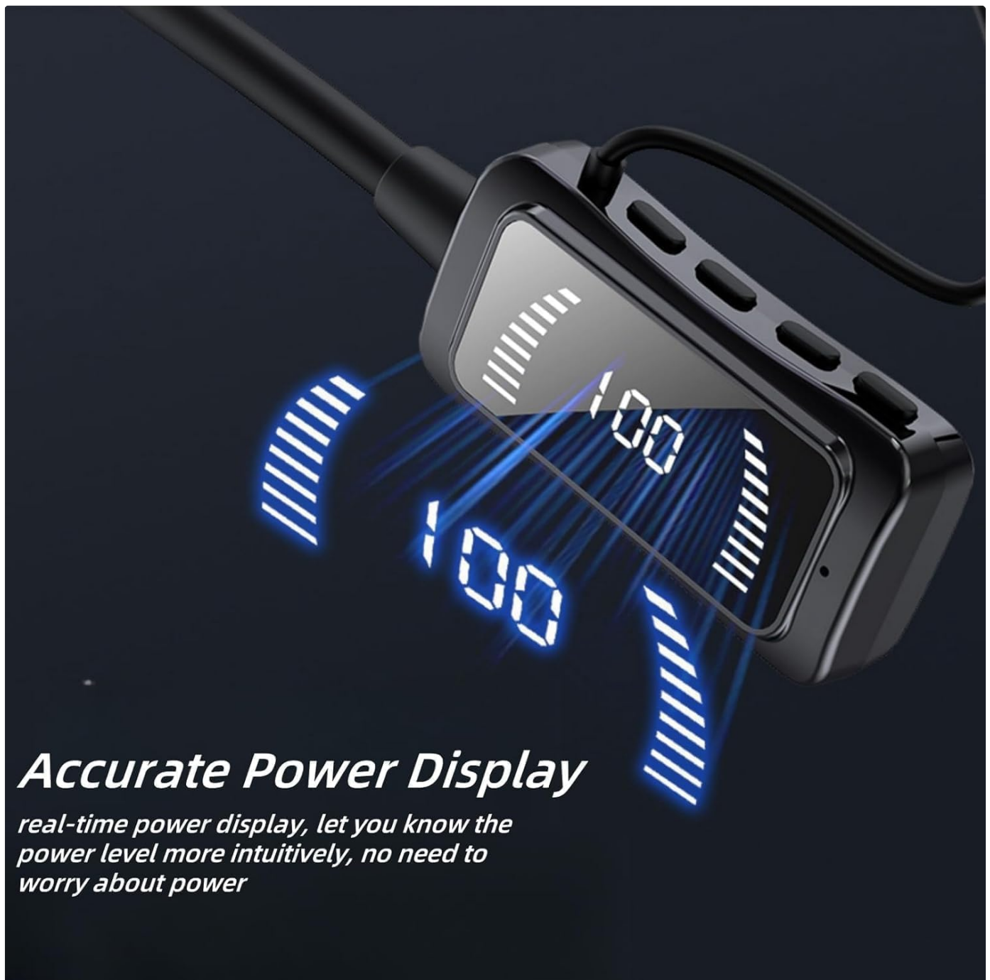
Image: The accurate power display on the earphone unit, showing real-time battery level.