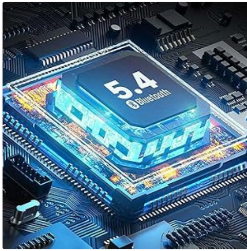
Image: Close-up of the internal chip, indicating Bluetooth 5.4 technology.