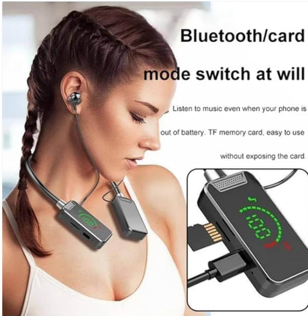
Image: The earphone unit displaying the option to switch between Bluetooth and TF card playback modes.