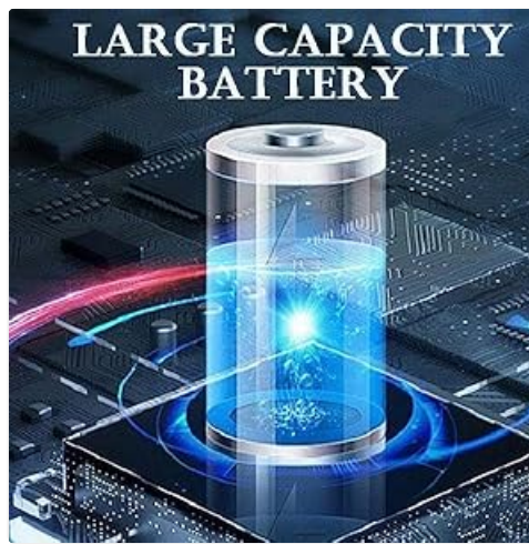
Image: Illustration of the internal battery, indicating its large capacity for extended use.