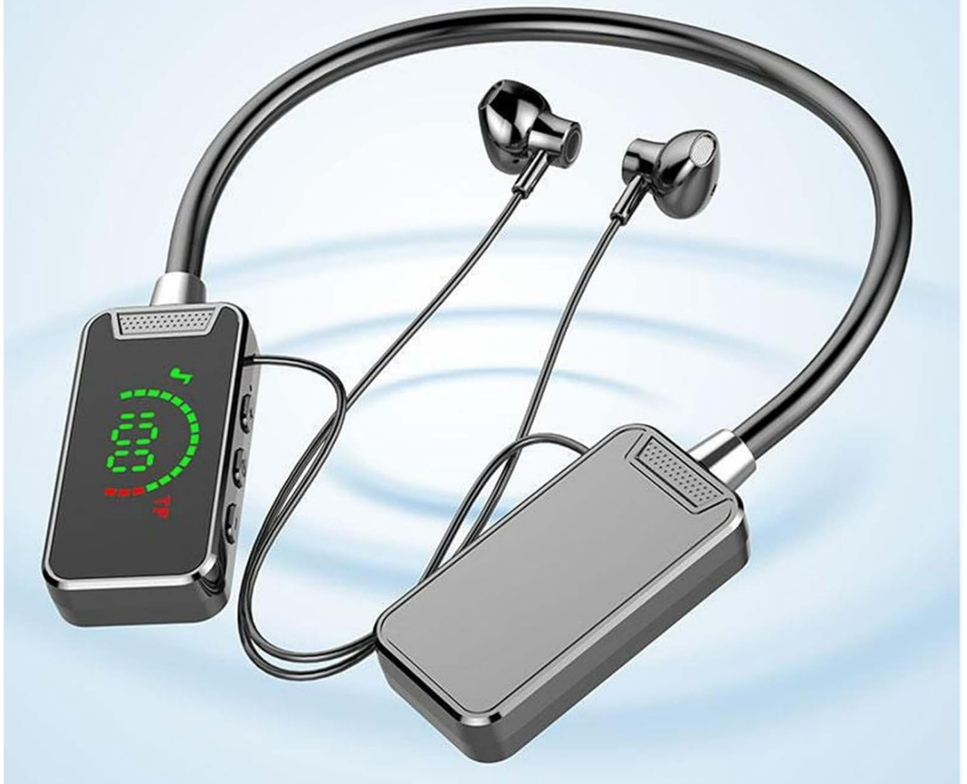
Image: The earphones showcasing their waterproof and sweatproof construction.