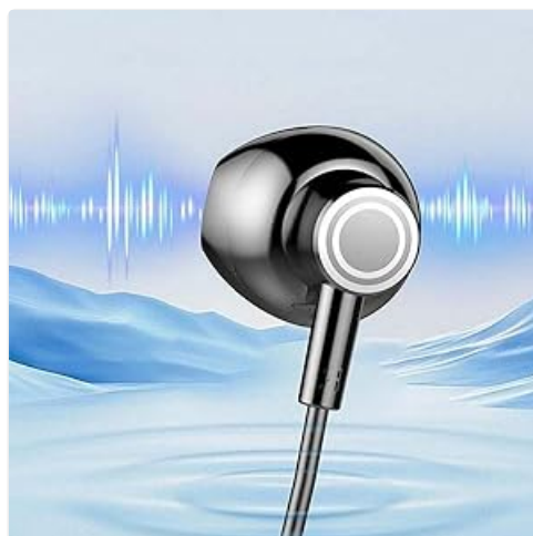
Image: Close-up of an earbud, illustrating sound wave output for enhanced audio quality.