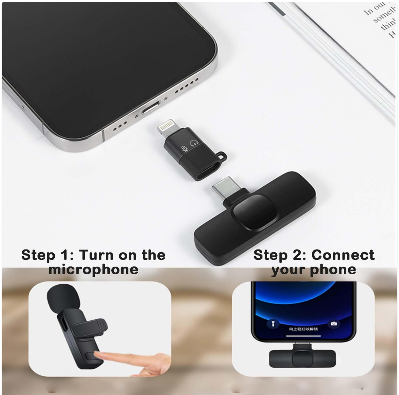
Image: The Generic Wireless Sound Card Earphones, showcasing their design and components.