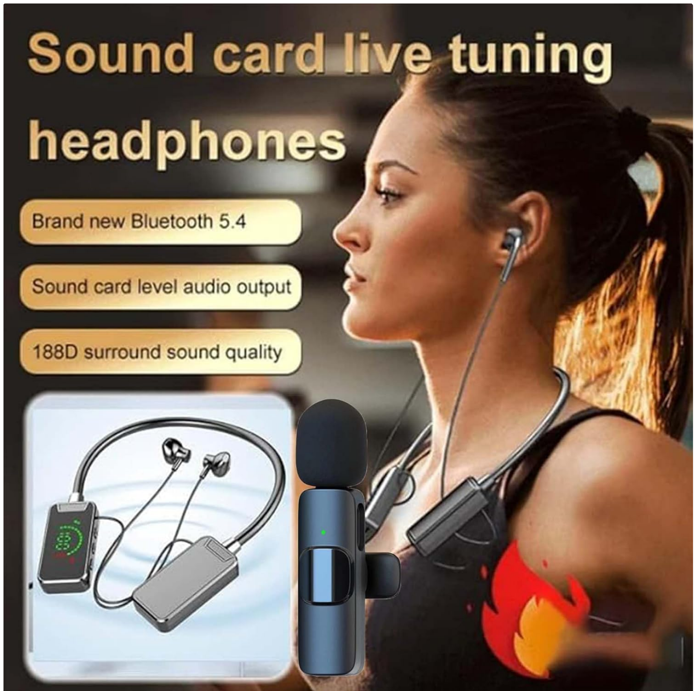
Image: The earphones highlighting Bluetooth 5.4, sound card level audio output, and 188D surround sound quality.