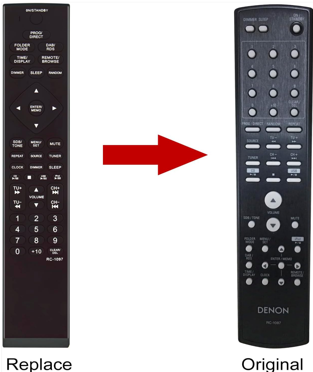
Image: Front view of the ECONTROLLY RC-1097 remote control, displaying all buttons for various functions.