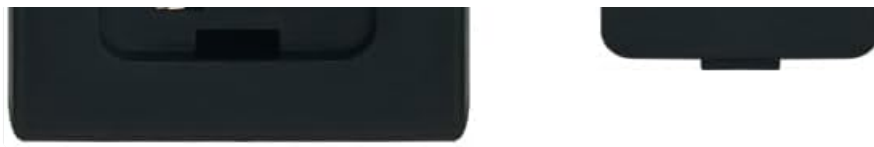
Image: The back of the RC-1097 remote control with the battery compartment open, illustrating the correct orientation for inserting two AAA batteries.