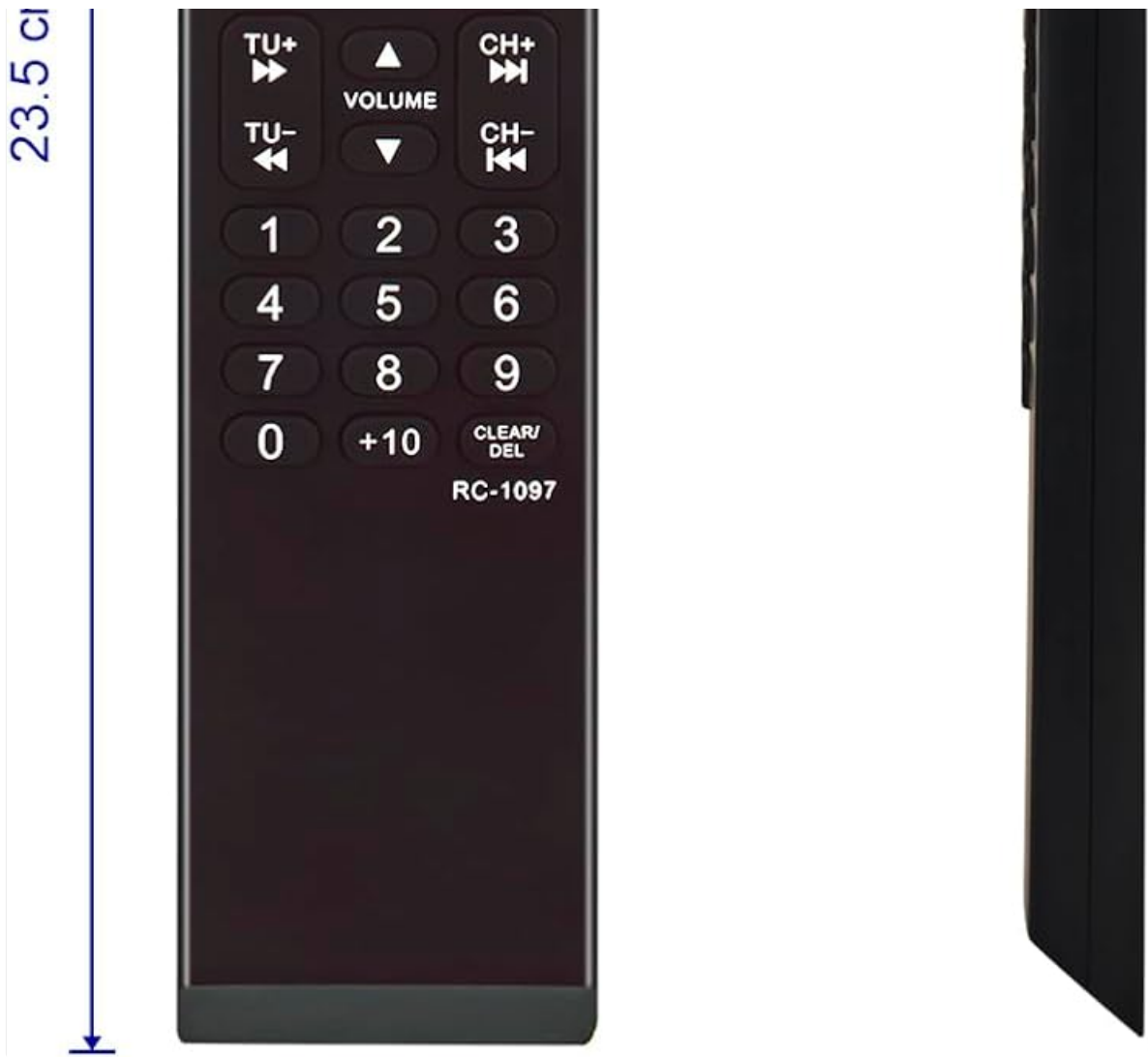
Image: Side view of the RC-1097 remote control with approximate dimensions shown.