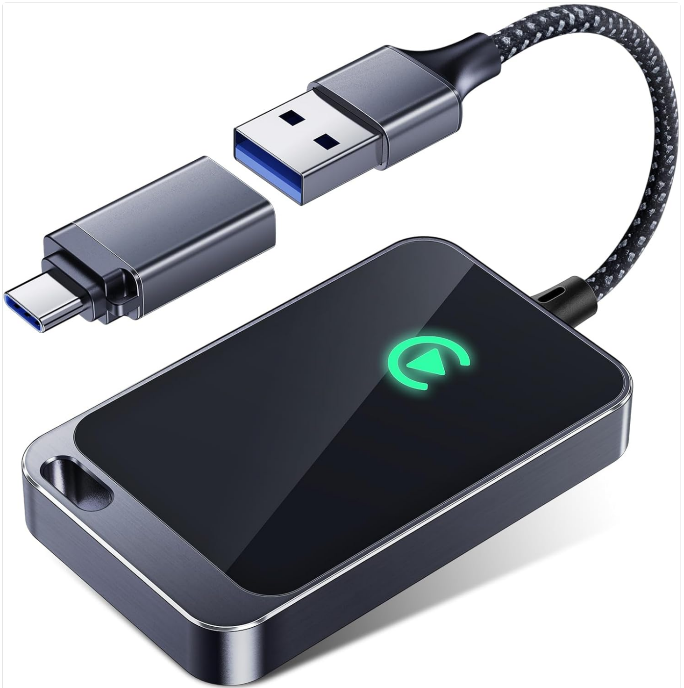
Figure 1: Jemluse Wireless CarPlay Adapter and accessories.