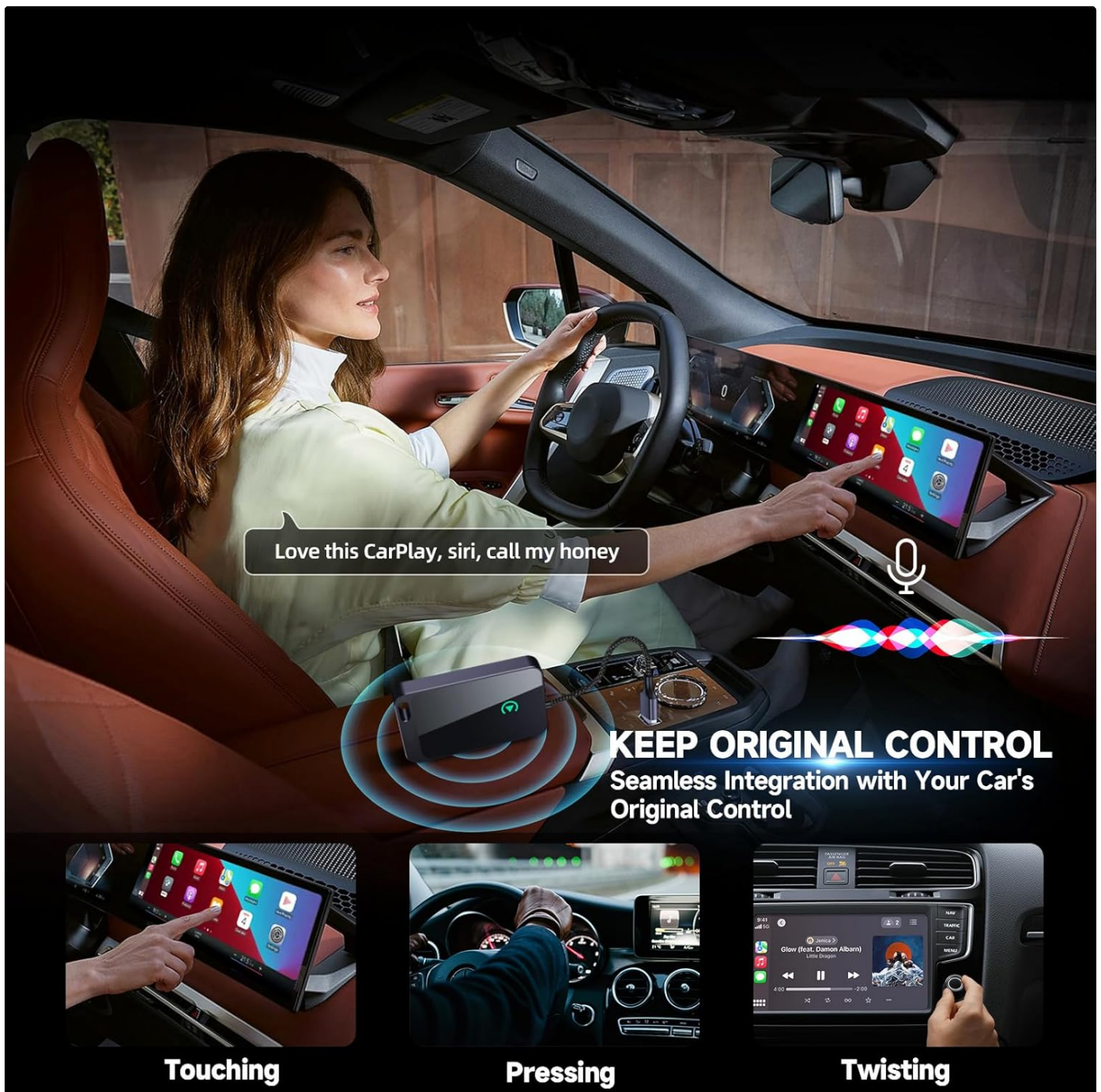
Figure 4: Seamless integration with your car's original controls (touching, pressing, twisting).