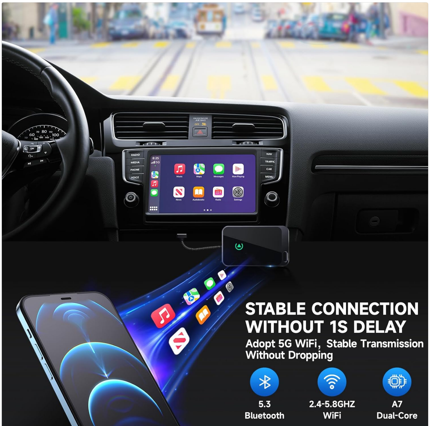
Figure 3: Wireless CarPlay connection established on the car's display.

For subsequent connections, simply keep Wi-Fi and Bluetooth enabled on your iPhone. The adapter will automatically connect to the last used iPhone within approximately 10 seconds of starting the car.