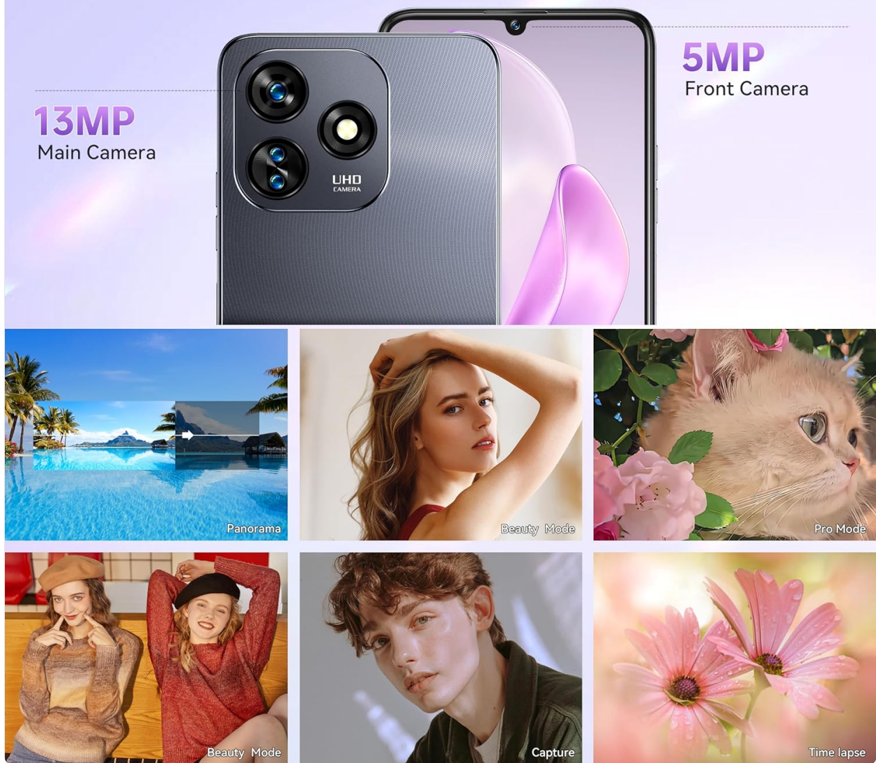
Image: An illustration of the OUKITEL C51's camera capabilities, highlighting the 13MP main and 5MP front cameras, along with various shooting modes.