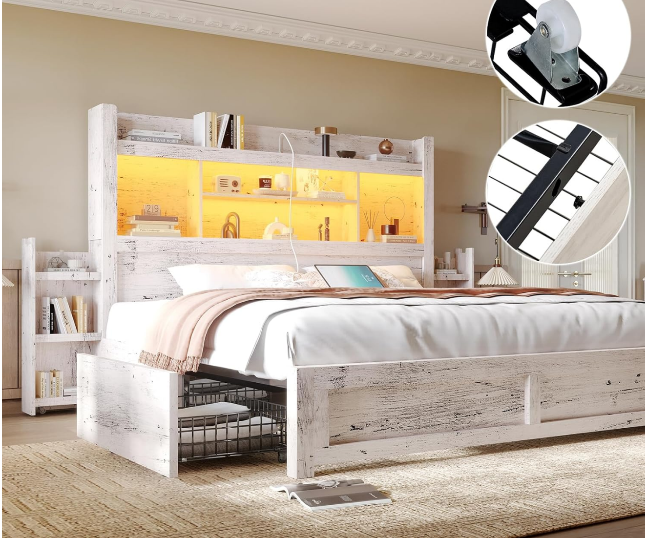
Image: Under-bed rolling storage drawers.