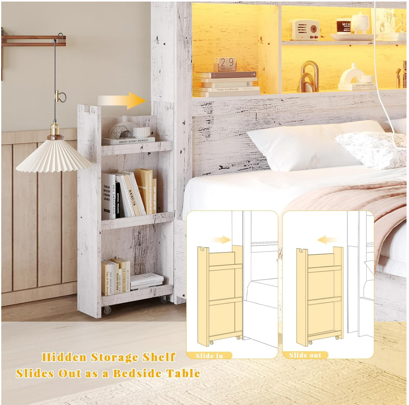
Image: Detachable side rack functioning as a hidden storage shelf.