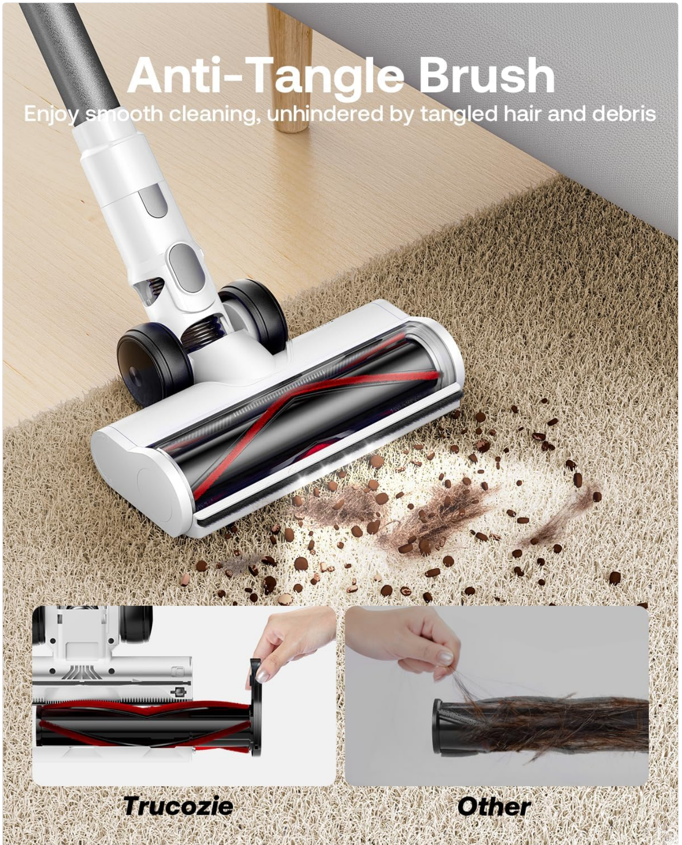
Image: A comparison image showing the Trucozie anti-tangle brush with minimal hair wrapped around it, next to a generic brush with significant hair tangles. This highlights the effectiveness of the anti-tangle design.

Enjoy smooth cleaning, unhindered by tangled hair and debris