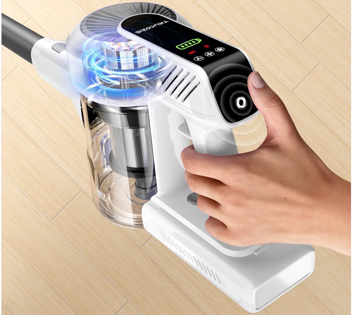
Image: A close-up of the vacuum's handle and control panel, showing a hand operating the unit. The display indicates battery level and suction mode. This illustrates the powerful brushless motor and 3-level suction.

3-Level Suction & Clog Alerts for Efficient Cleaning