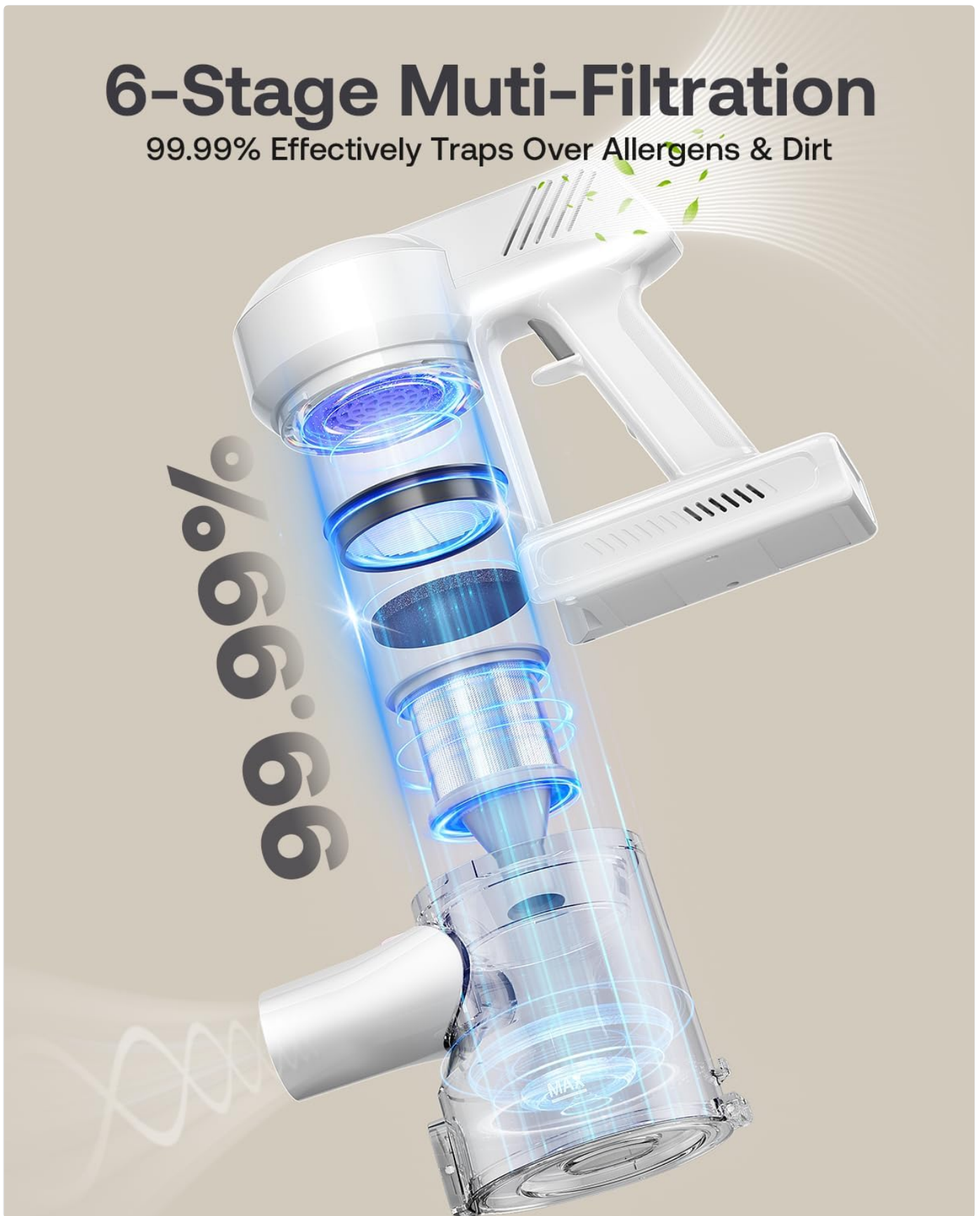
Image: An exploded view diagram illustrating the 6-stage multi-filtration system, showing how it effectively traps allergens and dirt.

99.99% Effectively Traps Over Allergens & Dirt