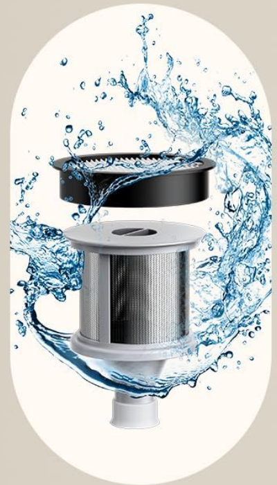
Washable HEPA Filter

Image: A visual representation of the one-click dust removal feature, showing debris falling from the dust cup into a trash bin. This highlights the ease of emptying without touching the mess.