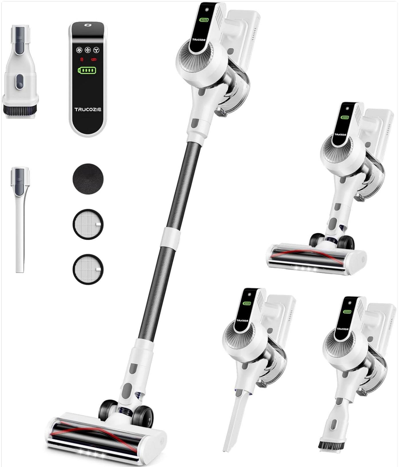
Image: The Trucozie T351 Cordless Vacuum Cleaner shown with its main body, extension tube, motorized brush head, and various

The Trucozie T351 Cordless Vacuum Cleaner is designed for versatile and efficient cleaning. Below is an overview of the main unit and included accessories.