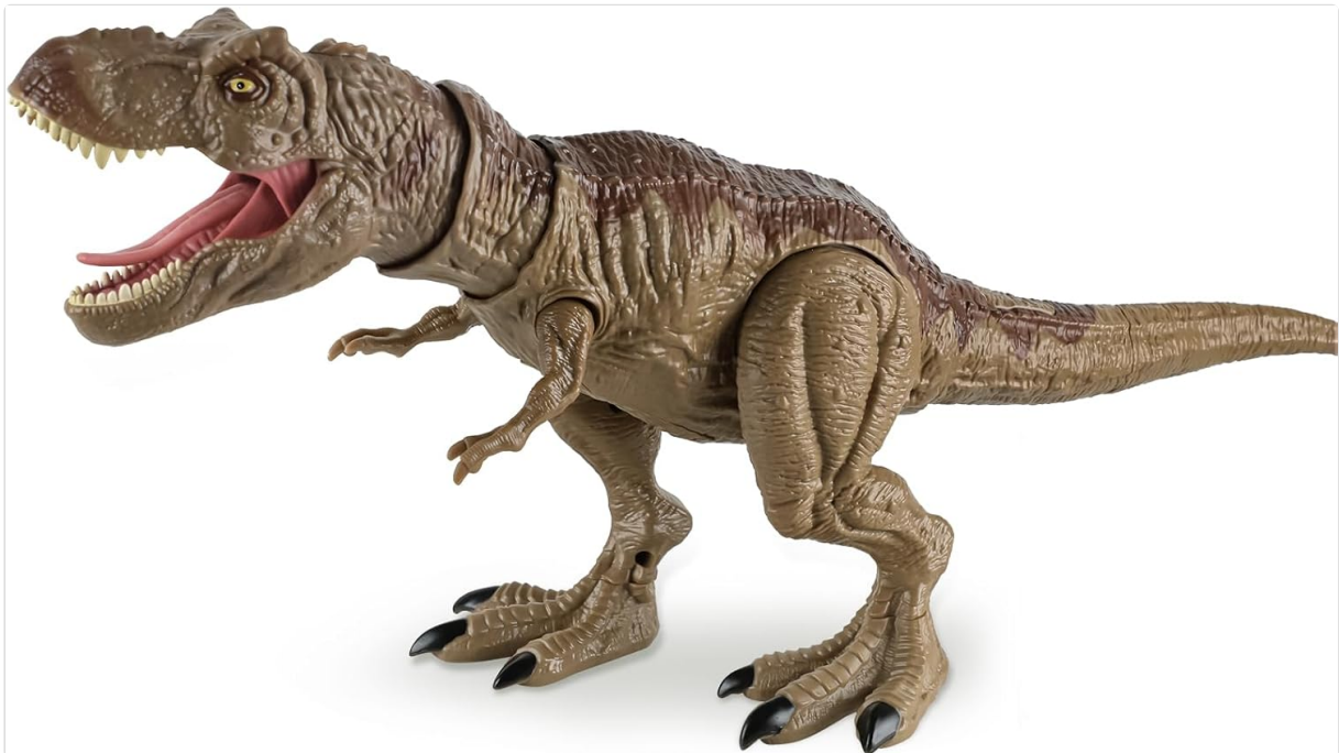
Image 4.2.1: The Tyrannosaurus Rex Action Figure, ready for setup.