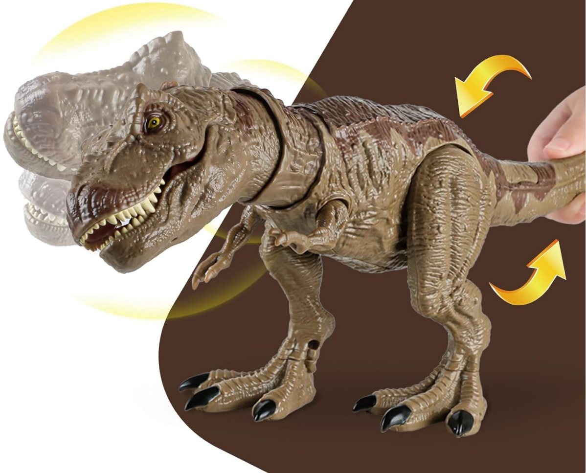
Image 5.3.1: Demonstrating how to wag the tail to activate the head-thrashing motion.