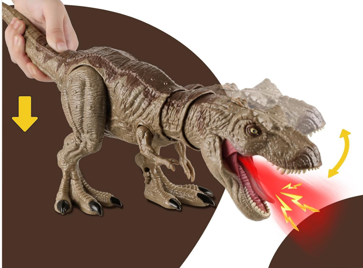
Image 5.2.1: Illustration of the Tyrannosaurus Rex activating its roaring, vibration, and light-up features.