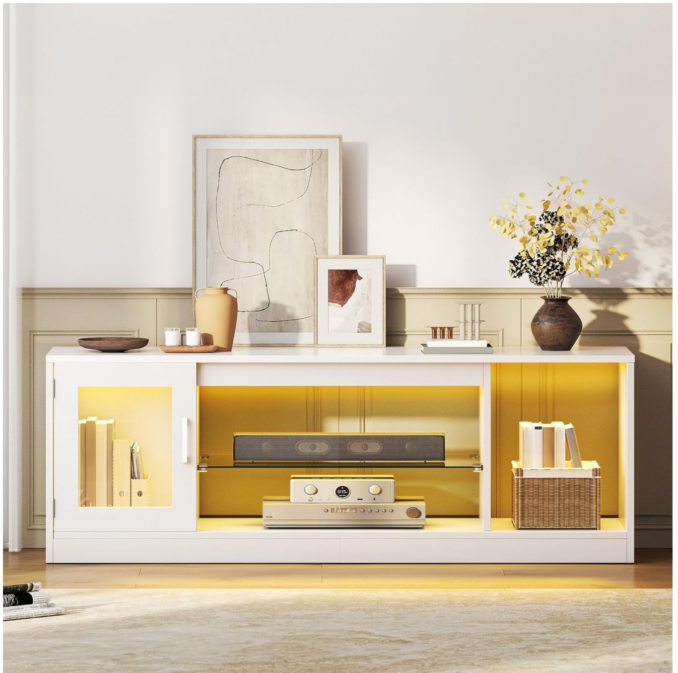
Image: YITAHOME TV Stand in white, set up with a television, gaming consoles, and decorative items, highlighting its functional design.