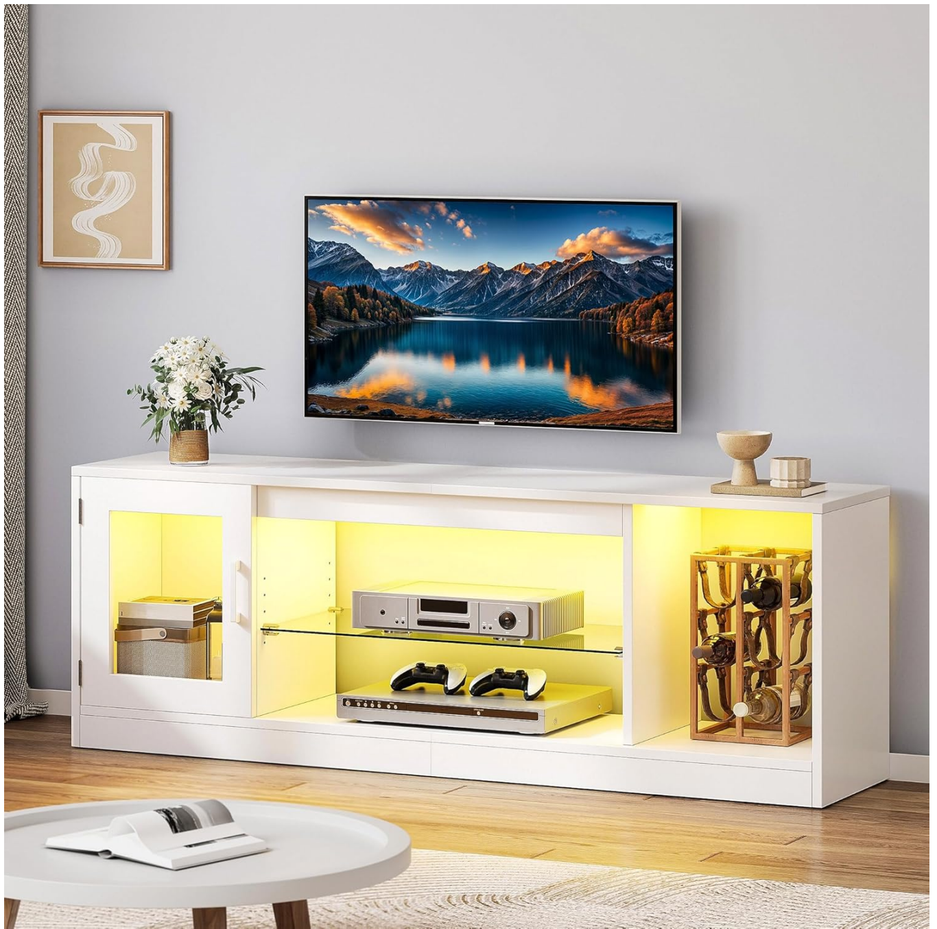
Image: YITAHOME TV Stand in white, featuring a television, gaming setup, and a small wine rack, demonstrating its adaptable storage solutions.