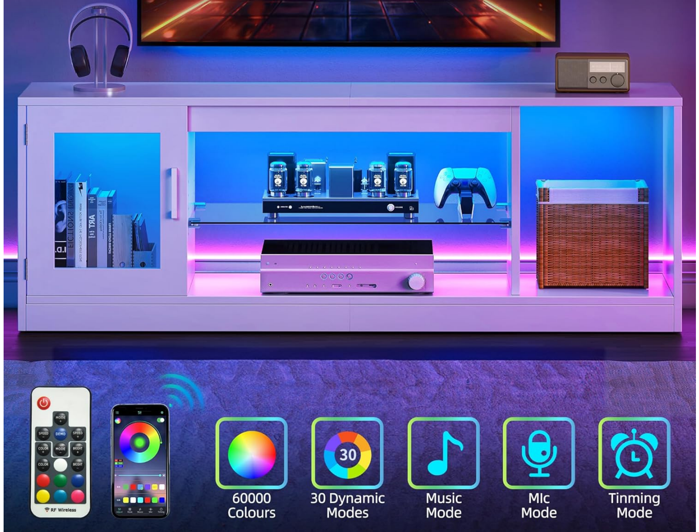
Image: YITAHOME TV Stand showcasing multi-color RGB light strip, controllable via remote and app, creating a dynamic gaming ambiance.

You can DIY more color as you like with APP