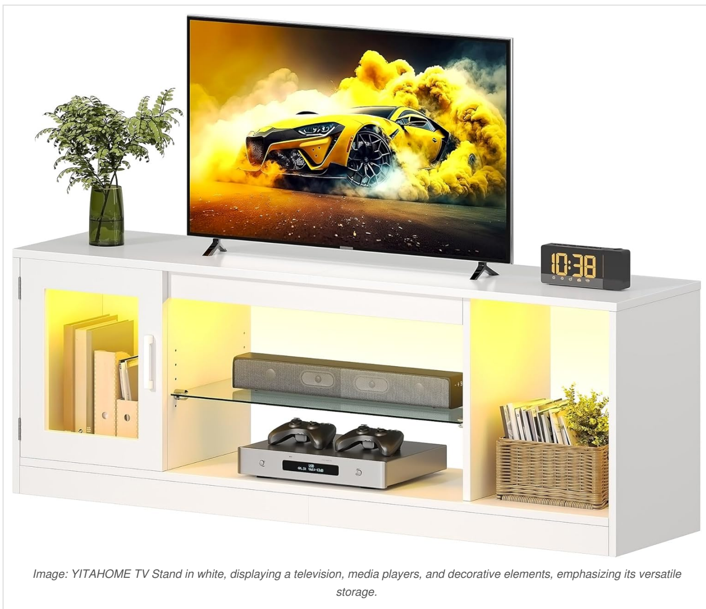
Image: YITAHOME TV Stand in white, displaying a television, media players, and decorative elements, emphasizing its versatile storage.