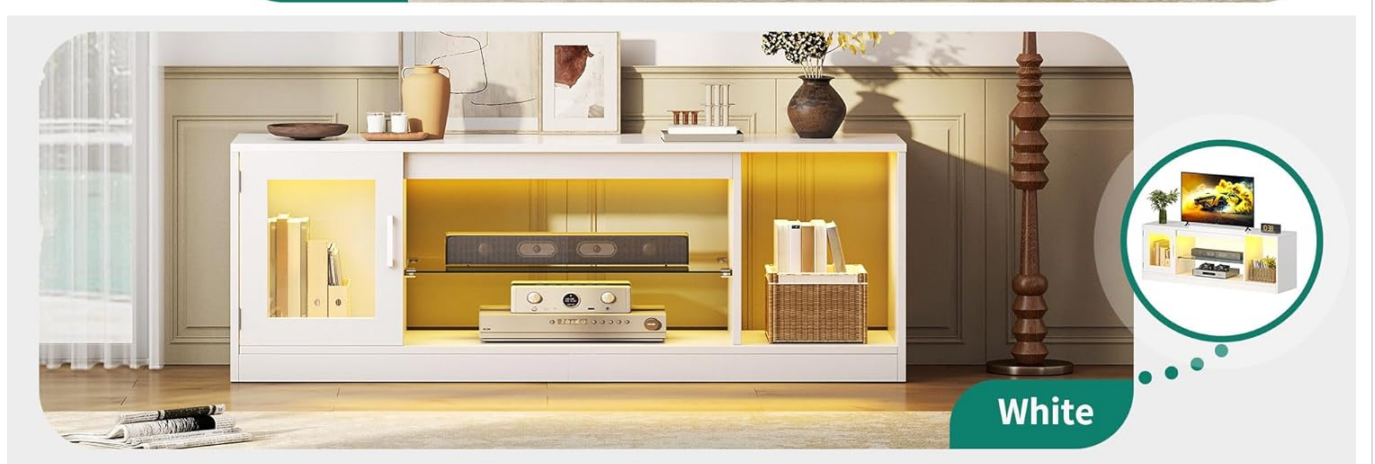
Image: YITAHOME TV Stand in white, featuring warm LED lighting and organized media storage.