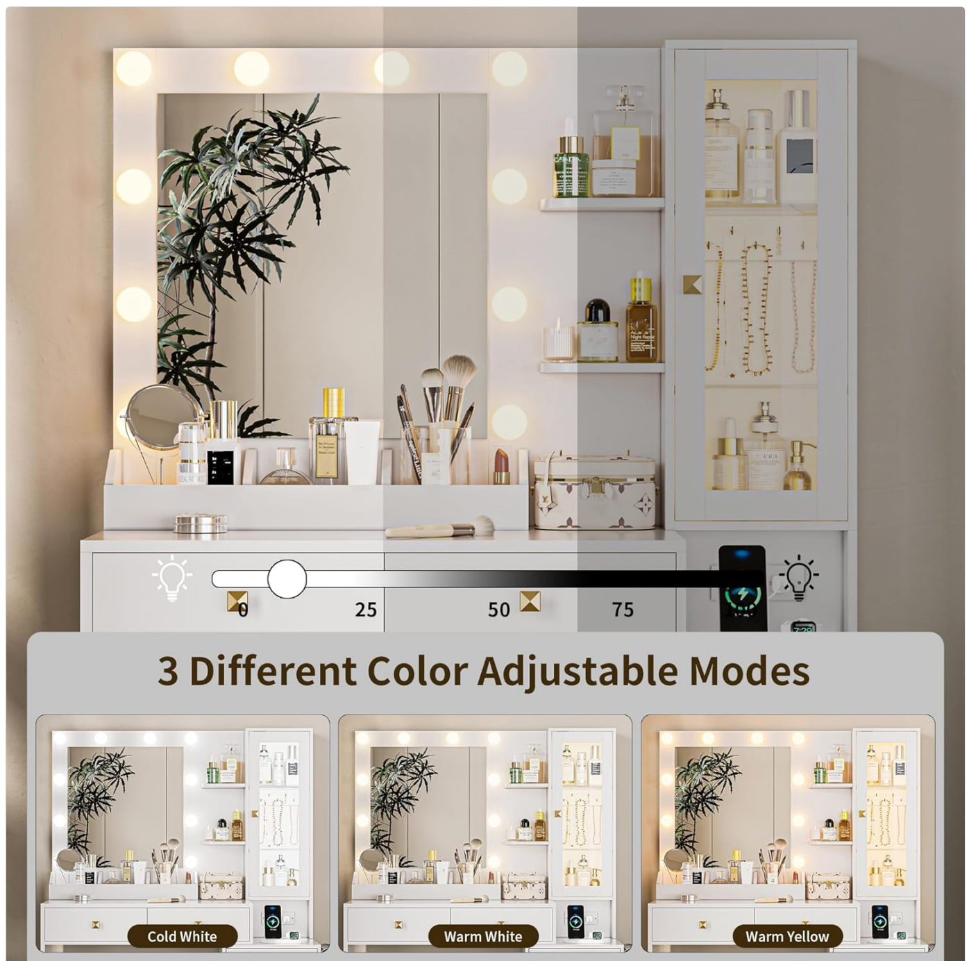
Image 6.1: Illustration of the vanity mirror's three adjustable light modes. This image demonstrates the visual difference between cold white, warm white, and warm yellow light settings.