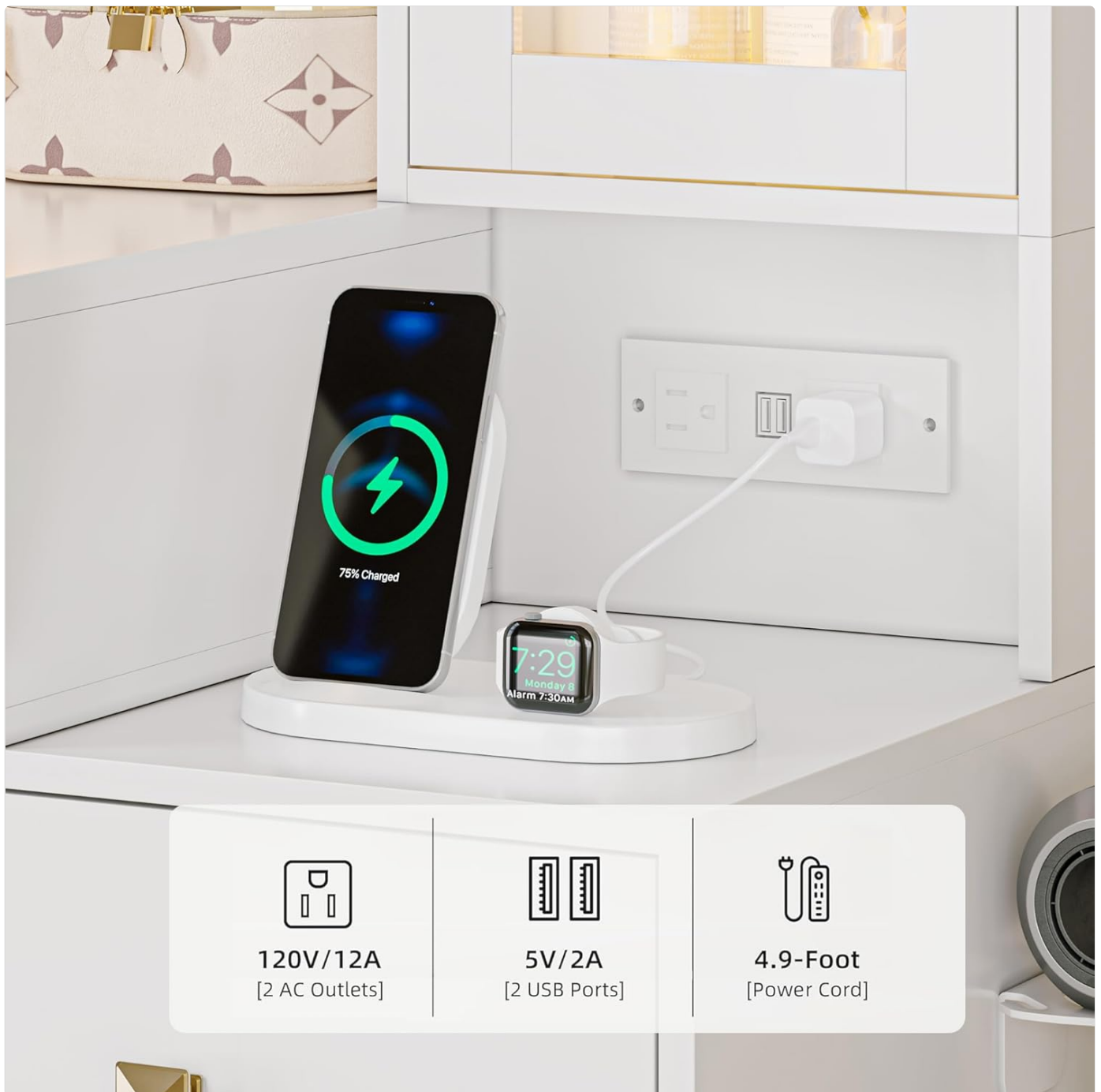
Image 6.3: Detail of the built-in charging station, showing the two AC outlets and two USB ports. This image also indicates the power specifications and cord length.