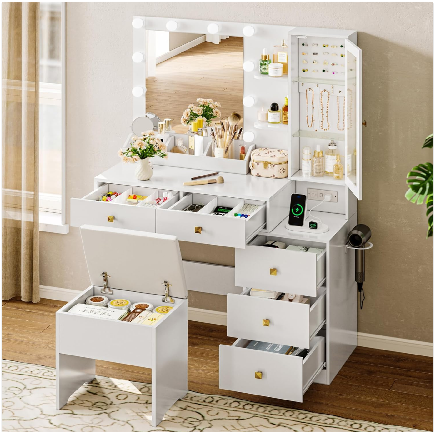
Image 3.1: The vanity desk with drawers and the stool opened to show internal storage. This image highlights the extensive storage options, including multiple drawers and a lift-top storage compartment within the stool.