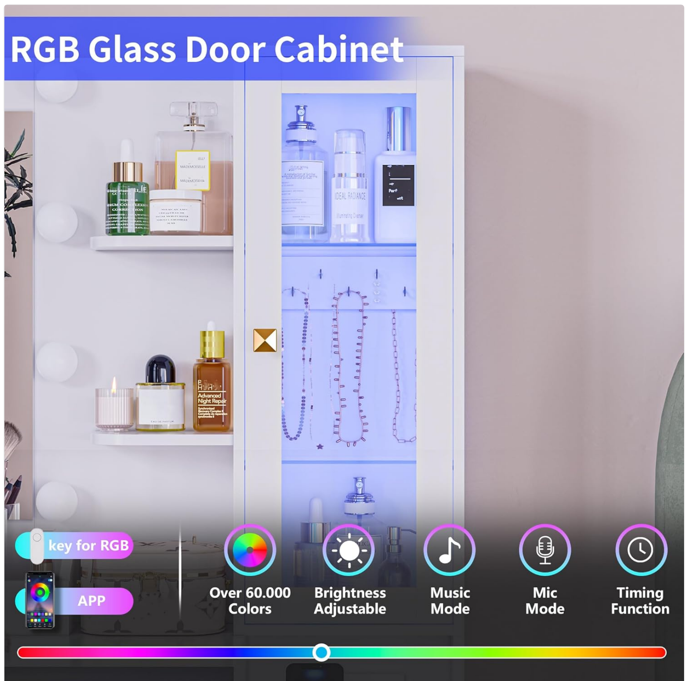
Image 6.2: Close-up of the RGB glass door cabinet, showing the LED lighting and various control options. This image highlights the customizable RGB lighting, including app control, color selection, brightness adjustment, music mode, microphone mode, and timing function.