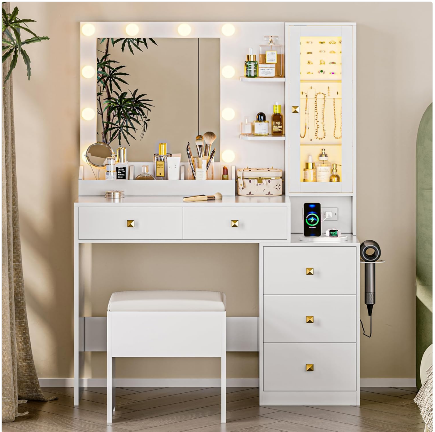
Image 1.1: Fully assembled HUANLEGO Vanity Desk with Mirror and Lights. This image displays the complete vanity desk setup, including the mirror with bulbs, multiple drawers, a side cabinet, and a matching stool.