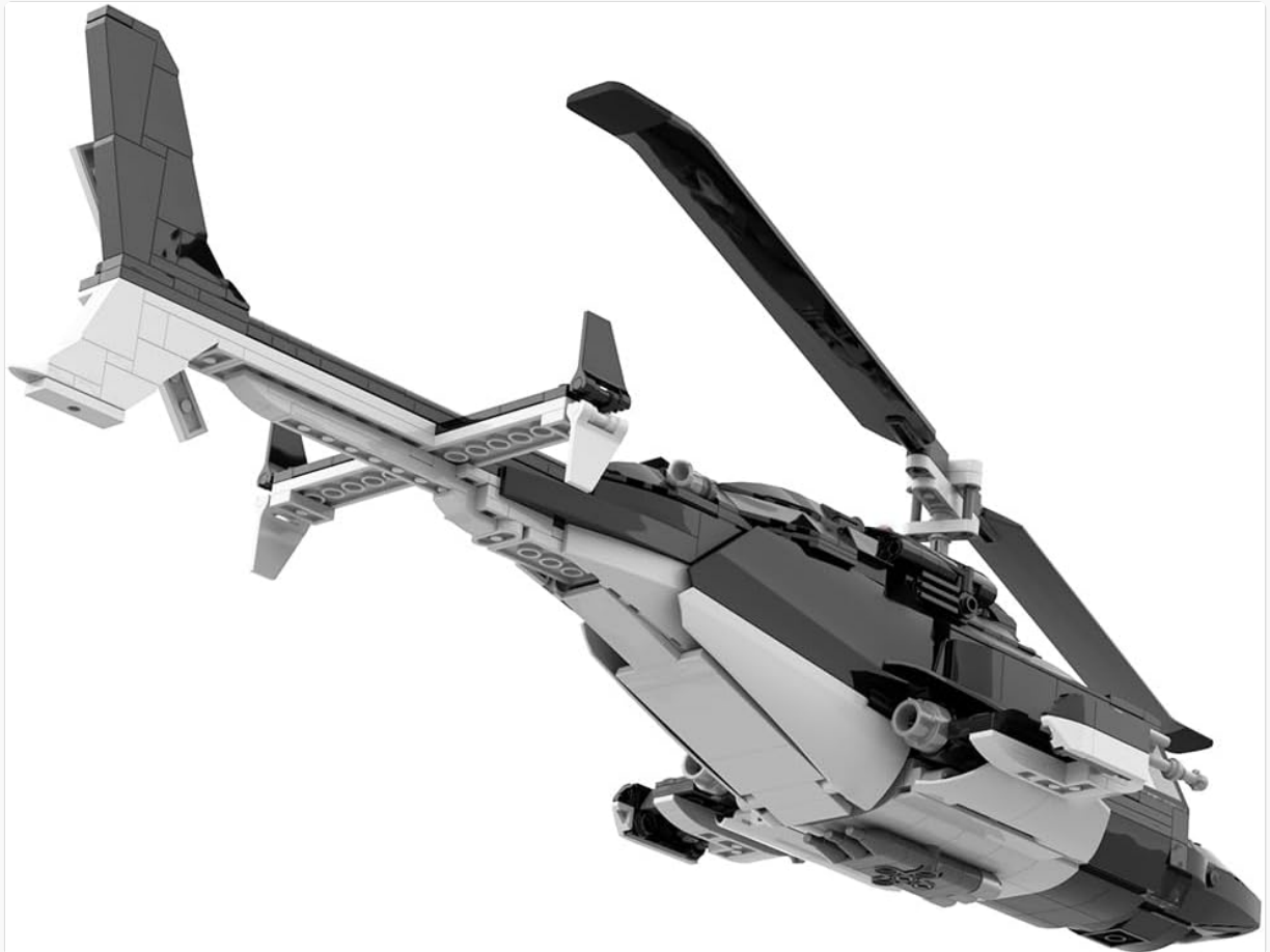
Figure 3: Rear view highlighting the tail rotor and rear stabilizers.

This image provides a top-down perspective of the Air-Wolf Helicopter model. The upper section of the fuselage is shown partially open, revealing the internal structure and the main rotor mechanism.