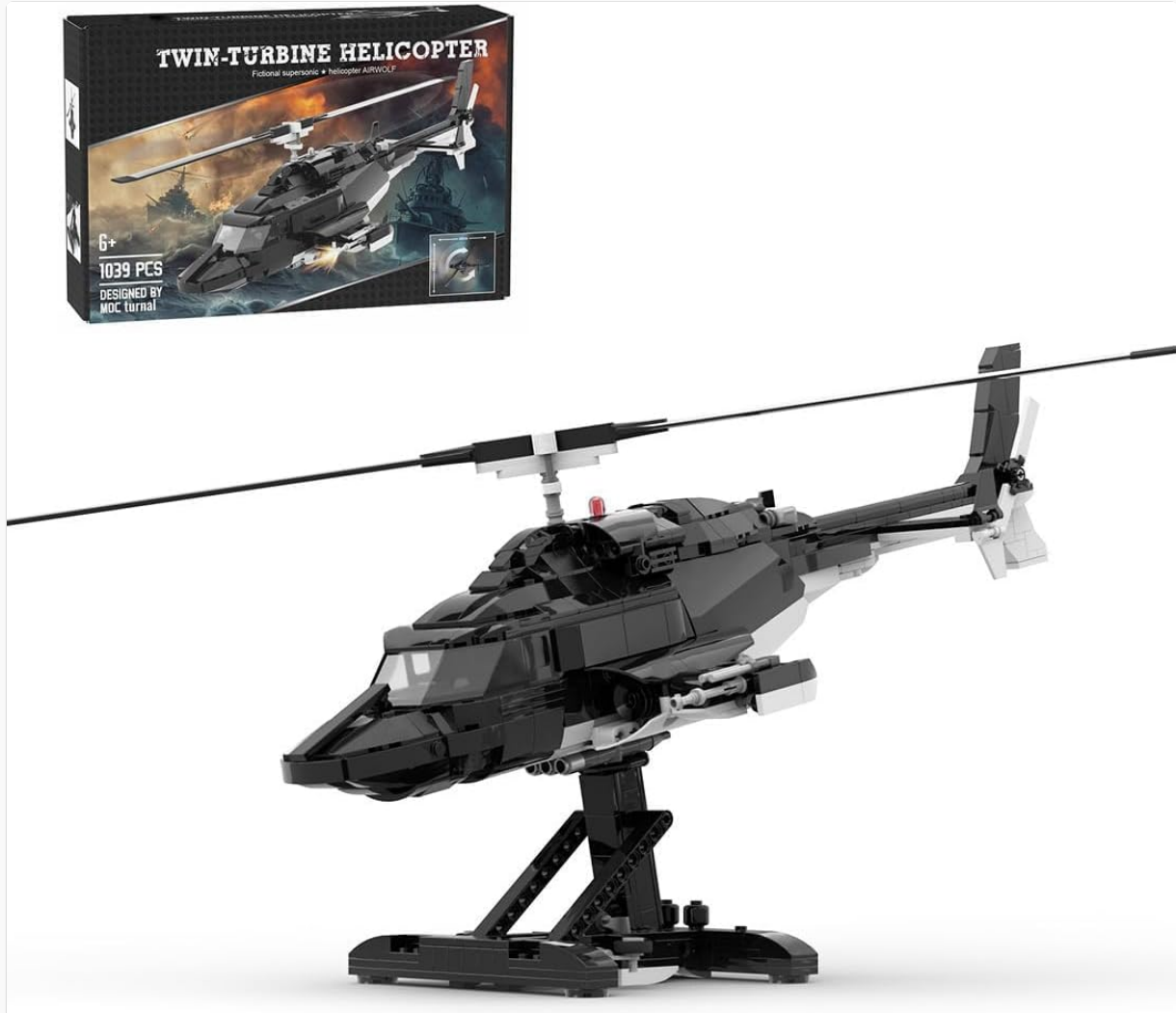
Figure 1: The completed WOWOBONTOY Air-Wolf Helicopter Building Blocks Model on its display stand.

This image shows the fully assembled Air-Wolf Helicopter model, presented on its dedicated display stand. The model features a sleek black and white design, with detailed rotor blades and weapon pods visible.