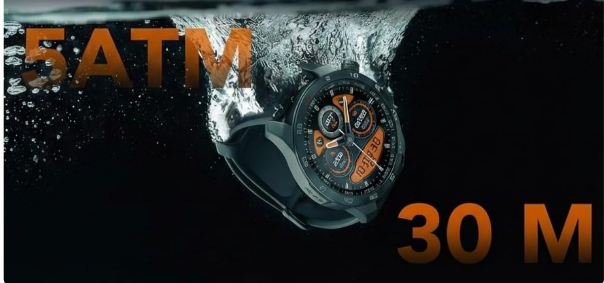
Image: The SKG Smart Watch GT5 demonstrating built-in GPS tracking for steps, calories, and distance, alongside its 5ATM waterproof rating.