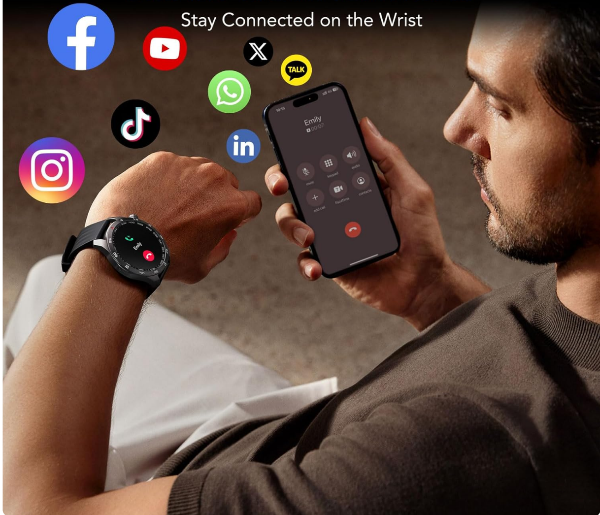
Image: The SKG Smart Watch GT5 displaying its Bluetooth call functionality and showing icons for various social media and messaging app notifications.