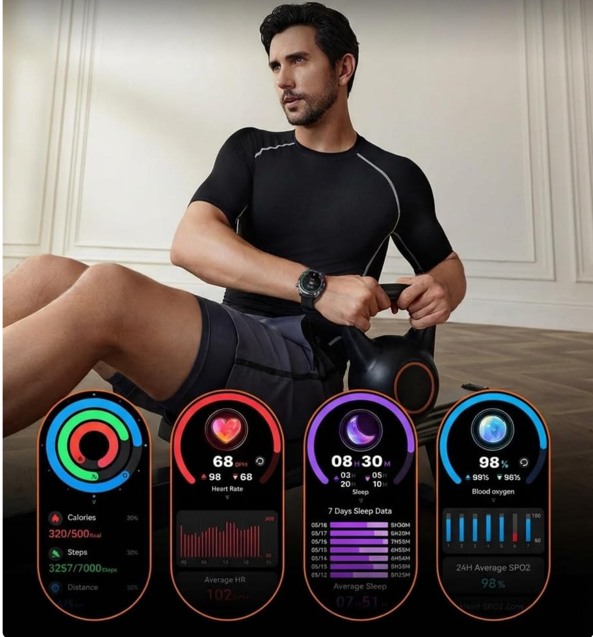
Image: The SKG Smart Watch GT5 showing various health monitoring data points, including calories, steps, heart rate, sleep, and blood oxygen levels.