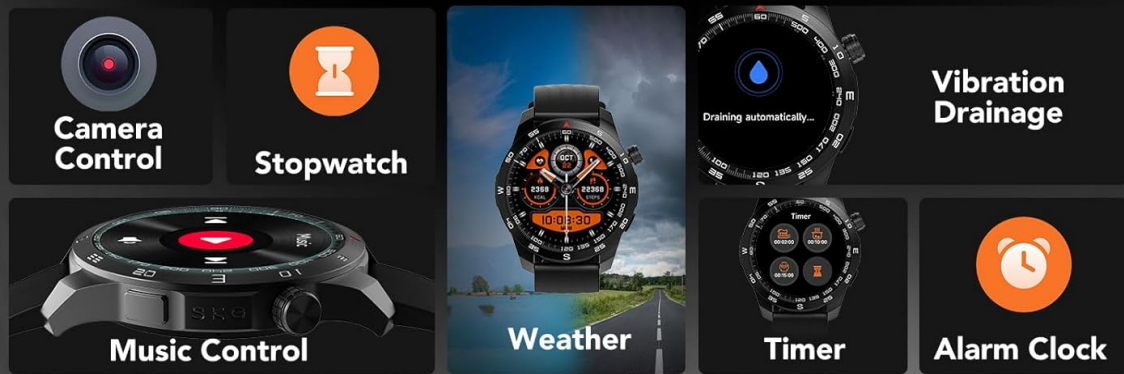
Image: The SKG Smart Watch GT5 showcasing its additional tools, including camera control, stopwatch, weather display, music control, timer, alarm clock, and vibration drainage.