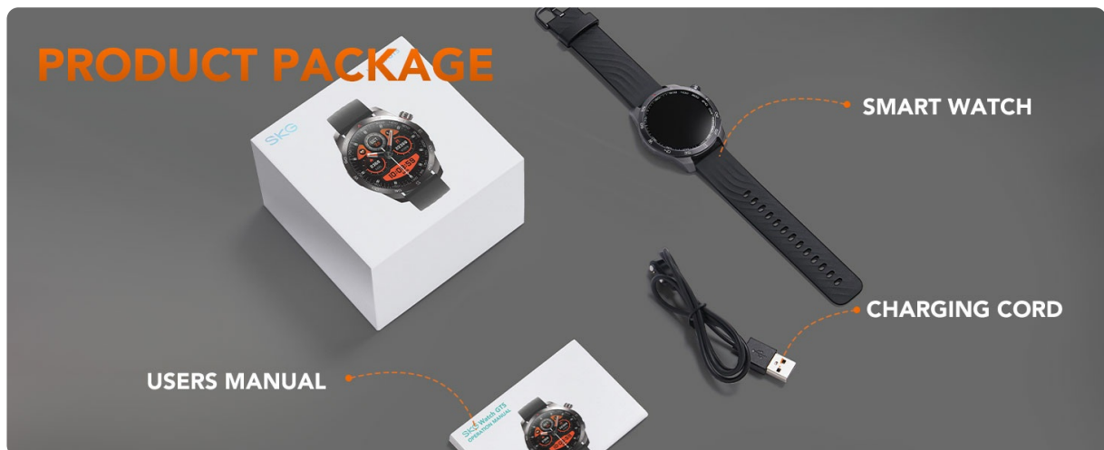
Image: Contents of the SKG Smart Watch GT5 package, including the smartwatch, charging cable, and user manual.