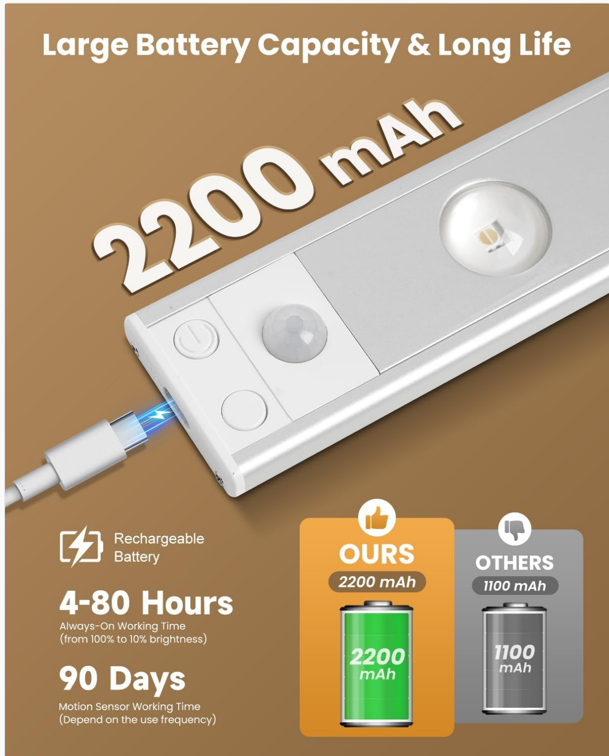
Figure 6: The light features a high-capacity rechargeable battery, providing extended operation time depending on the selected mode and brightness level.