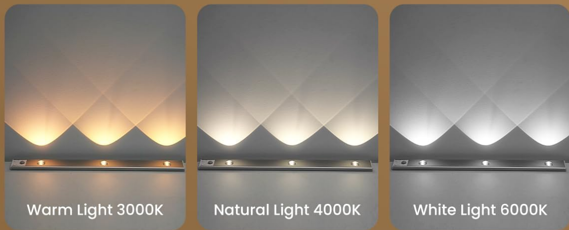
Figure 4: Users can fine-tune the light output and choose between warm, natural, or cool white light to suit their preferences or environment.