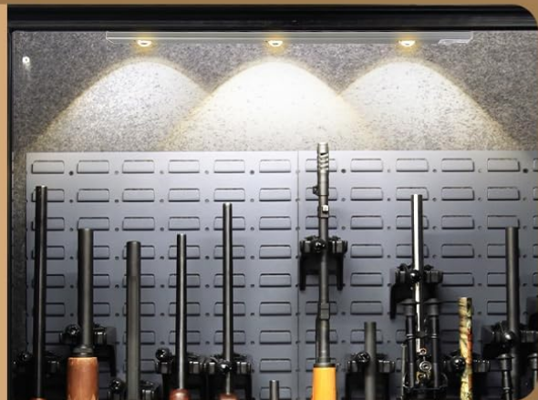
Figure 2: The light offers Always-ON for continuous use, Always-OFF to conserve battery, and Auto ON/OFF for motion-activated lighting in low-light conditions.

The light turns on automatically when motion is detected in low light environment, and it will automatically turn off after 20 seconds of no motion detected