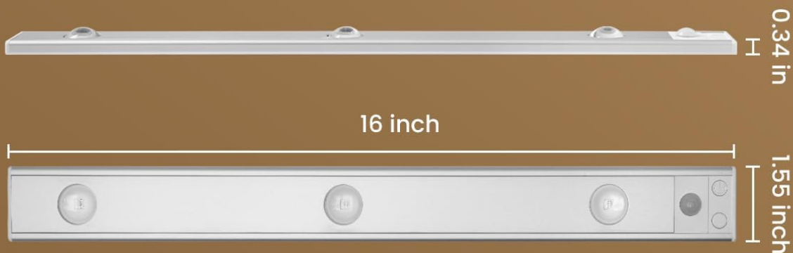
Figure 5: The specialized LED design projects a distinctive light pattern, ideal for highlighting decorative objects, and the light bar itself features an ultra-thin profile.