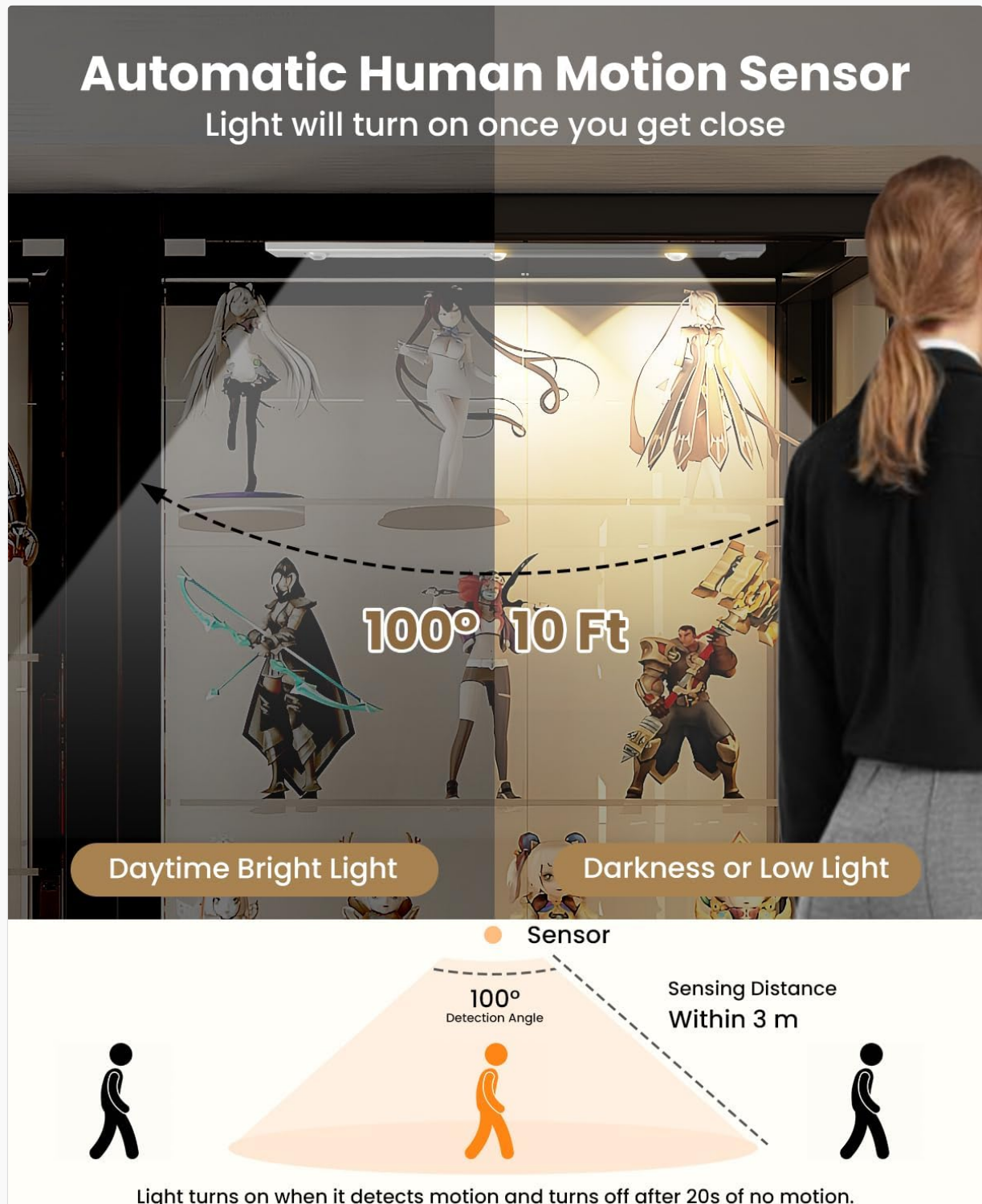
Figure 3: The motion sensor activates the light when movement is detected within its specified range and angle, primarily in dark or dimly lit environments.

The motion sensor detects movement within a 10-foot (3-meter) range and a 100° detection angle. It activates only in darkness or low-light conditions to conserve energy.