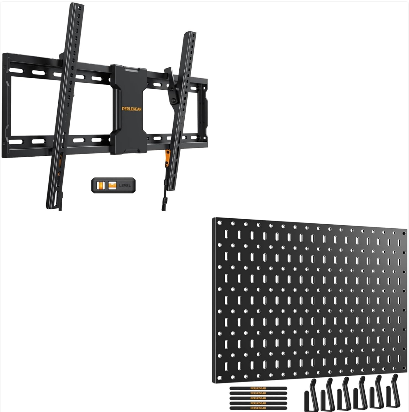
This image displays the complete Perlegear product package, including the tilting TV wall mount, the metal pegboard, and various hooks and cable management strips.