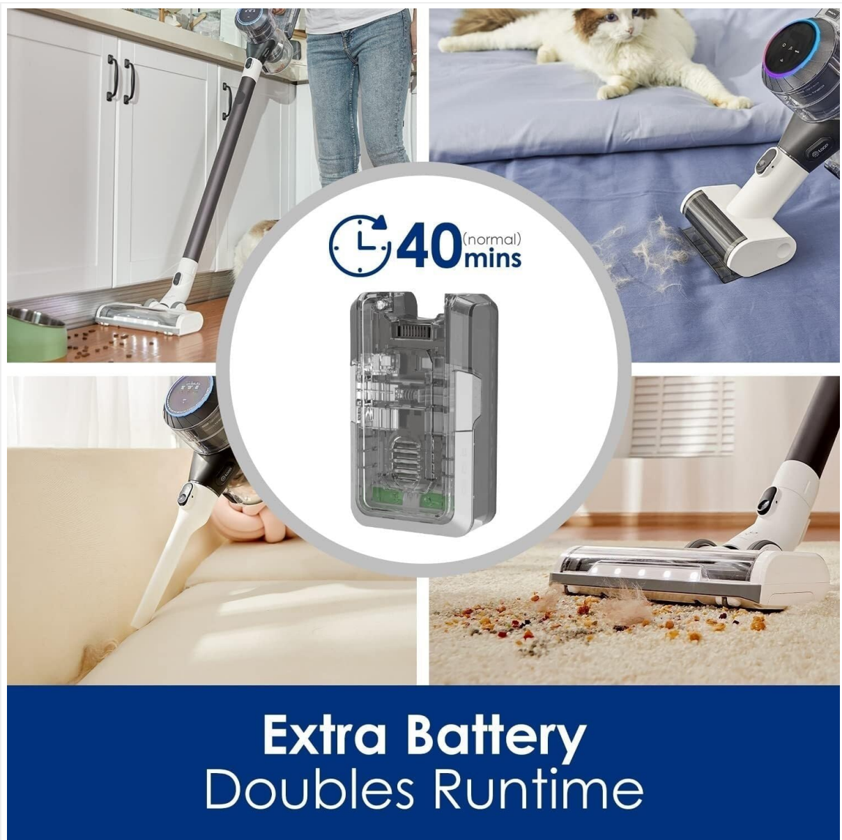
Figure 4: Extended Runtime with GUEIACIK S11-02 Battery

This image illustrates the benefit of the extra battery, showing the vacuum in various cleaning scenarios and highlighting an approximate 40-minute normal runtime.