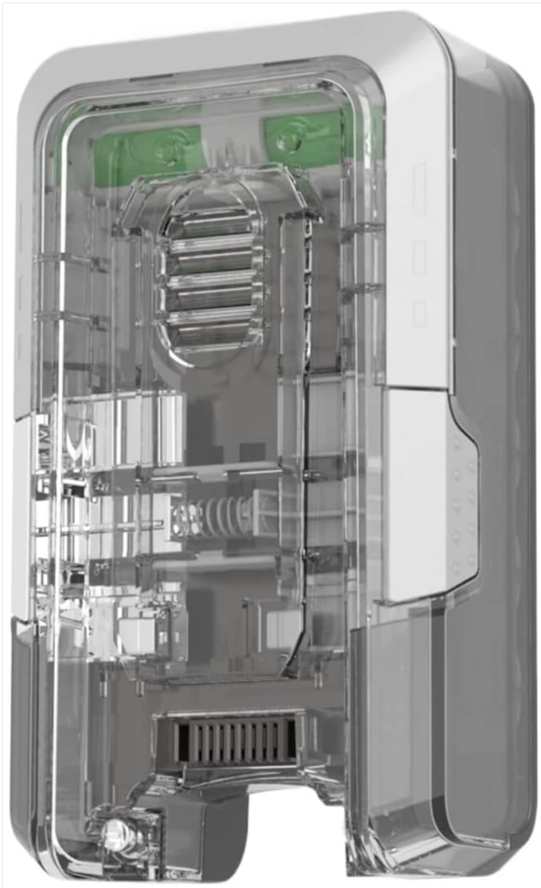
Figure 1: GUEIACIK S11-02 Replacement Battery

This image displays the GUEIACIK S11-02 replacement battery, showcasing its transparent casing and internal components.