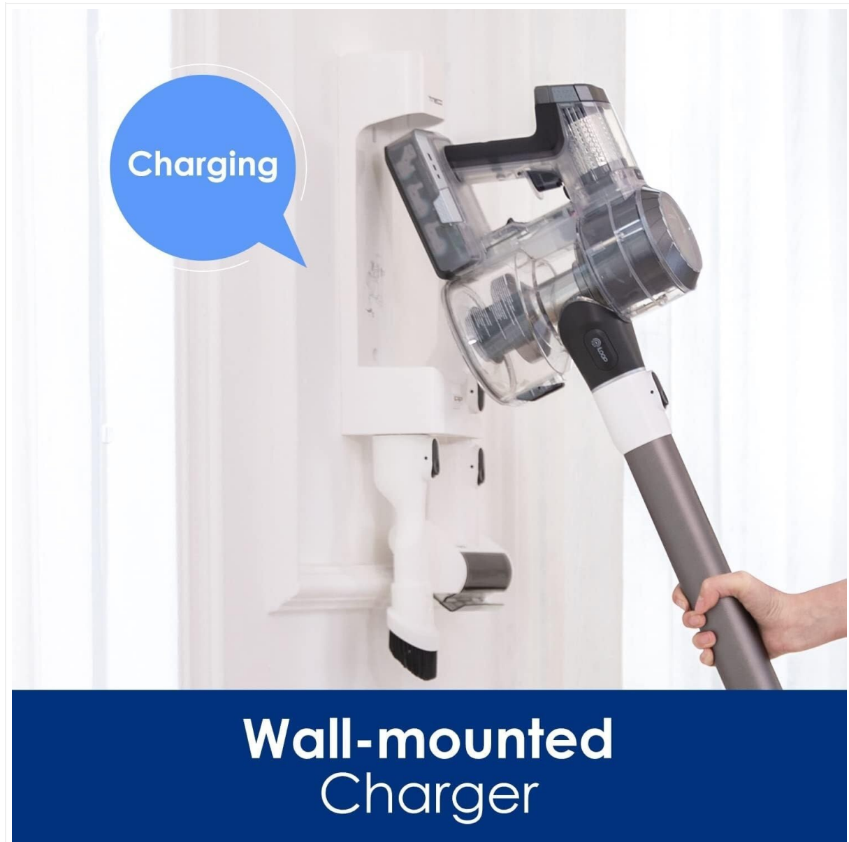
Figure 3: Wall-mounted Charger

This image shows the Tineco vacuum cleaner docked on its wall-mounted charger, indicating the charging process.