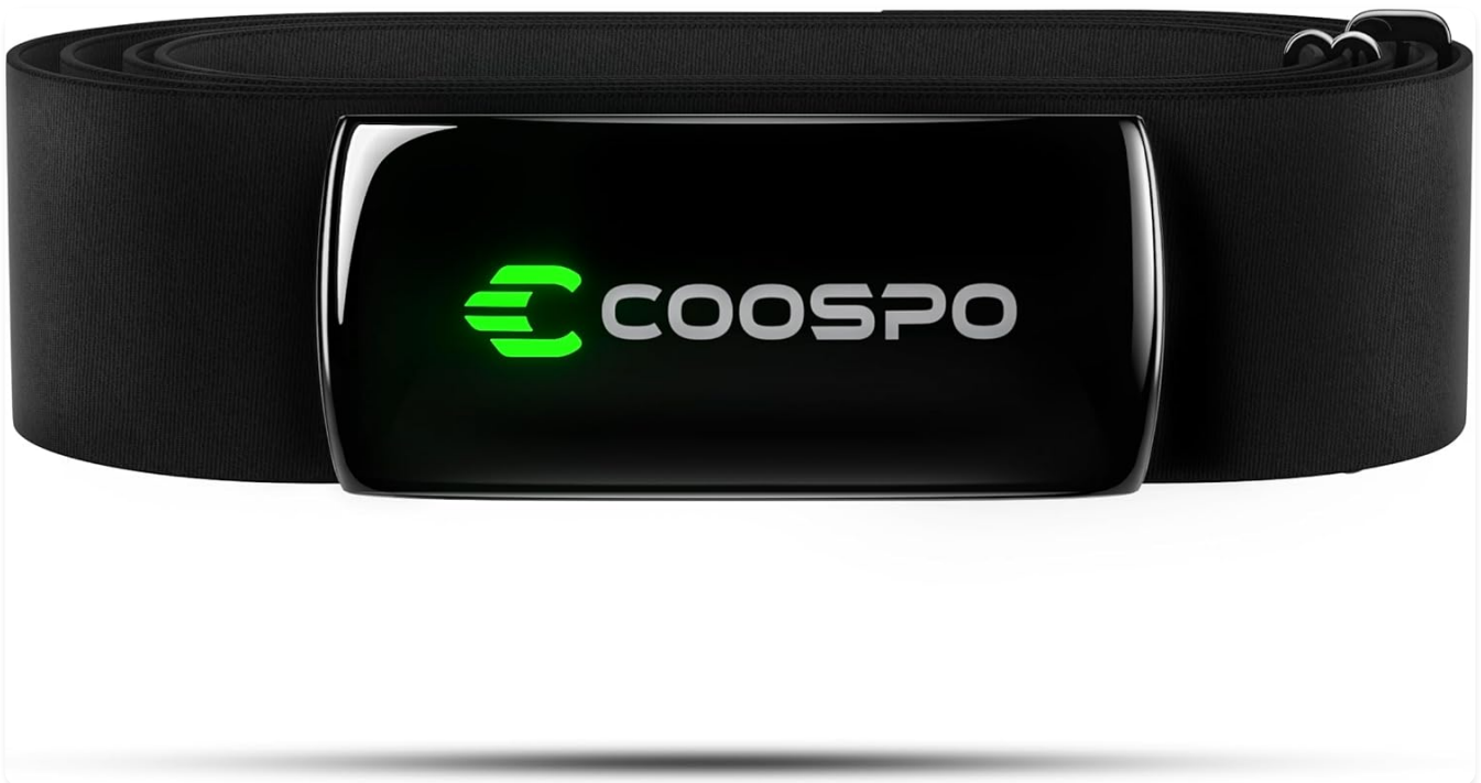
Figure 1: COOSPO H9Z Heart Rate Monitor Chest Strap.

The COOSPO H9Z Heart Rate Monitor Chest Strap is designed to provide ultra-precise heart rate readings for optimizing your training and monitoring progress. It features seamless connectivity via Bluetooth 5.0 and ANT+, a long-lasting rechargeable battery, and a comfortable, adjustable design suitable for various sports activities.