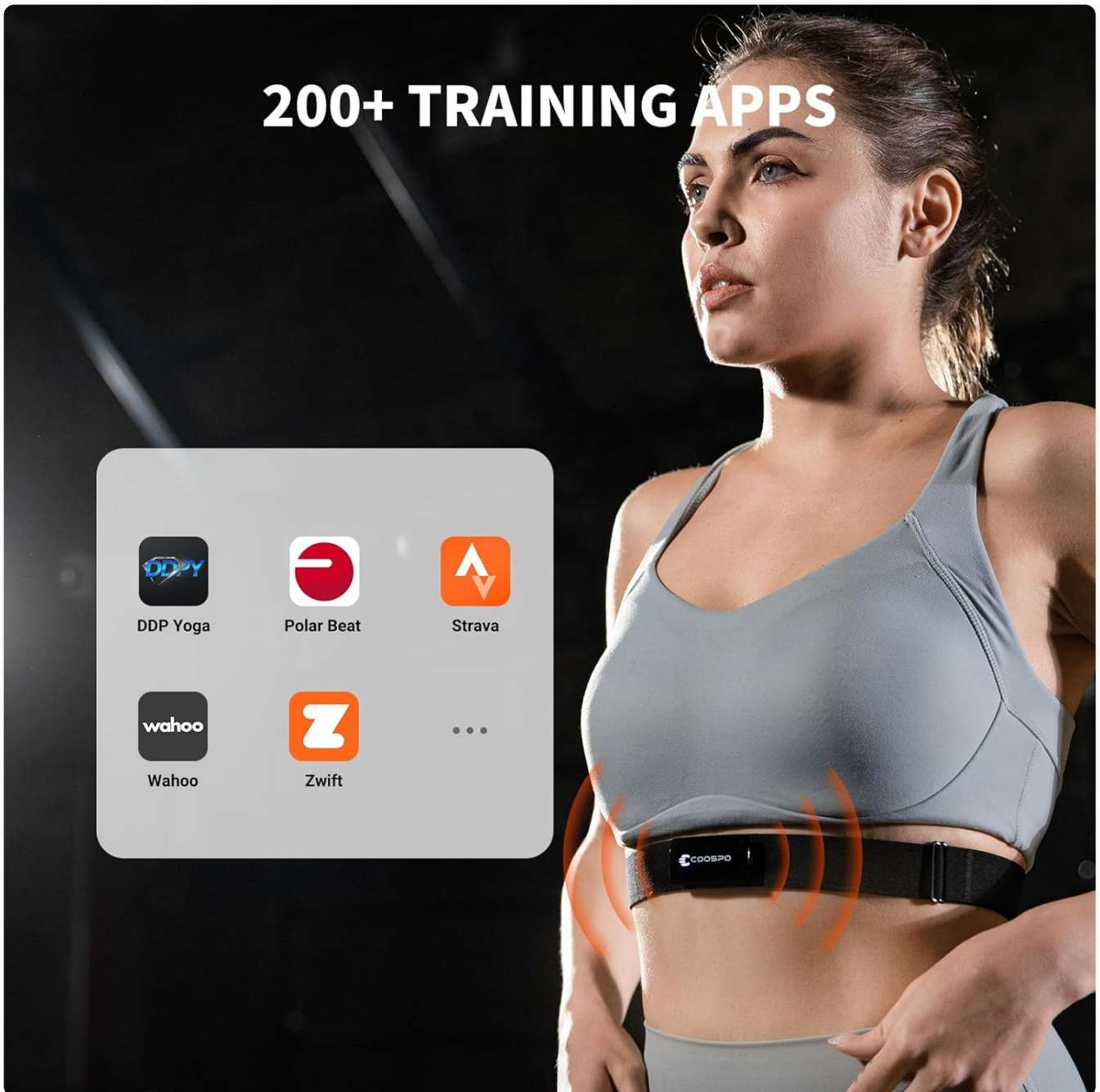
Figure 3: The COOSPO H9Z utilizes both Bluetooth 5.0 and ANT+ for broad compatibility with various fitness devices and applications.

apps, smartwatches, and bike computers. Ensure Bluetooth is enabled on your device before attempting to connect.