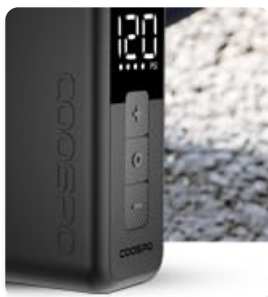
Figure 5: The COOSPO H9Z sensor placed on its magnetic charging dock.

The COOSPO H9Z features a rechargeable battery. To charge, remove the sensor from the chest strap and place it on the provided USB charging dock. Plug the USB cable into a DC 5V power adapter or a computer USB port.