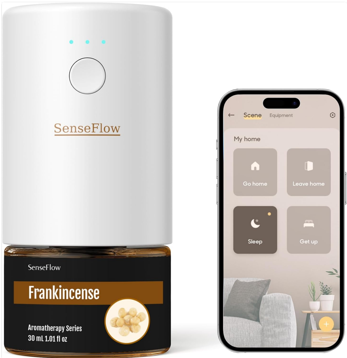
Figure 1: SenseFlow SF101S Diffuser and App Interface

The SenseFlow SF101S is a smart, waterless ultrasonic essential oil diffuser designed to provide a pure and authentic aromatherapy experience. It utilizes PureMist™ Patented Natural Health Fragrance Technology to atomize essential oils directly, without heat or water, preserving their natural scent. The device is controlled via a dedicated smartphone application, allowing for customizable scent intensity, scheduling, and broad coverage.