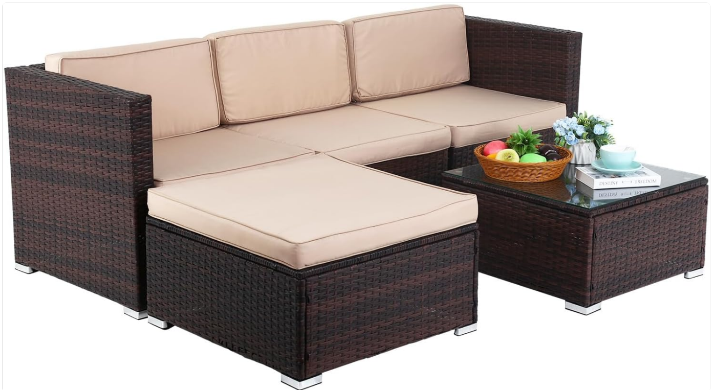
Image: The Dopinmin 5 Piece Rattan Patio Furniture Set, showcasing the assembled configuration with comfortable cushions and a functional coffee table.

This versatile 5-piece rattan patio furniture set is designed to enhance your outdoor or indoor living space. It includes comfortable chairs, a coffee table with a high-quality tempered glass top, and plush cushions. Constructed with a robust steel skeleton and durable rattan material, this set offers exceptional strength and can support up to 250 lbs. Its modular design allows for various customizable arrangements, making it suitable for patios, lawns, gardens, balconies, or even indoor sunrooms. Assembly is straightforward and requires no special tools.