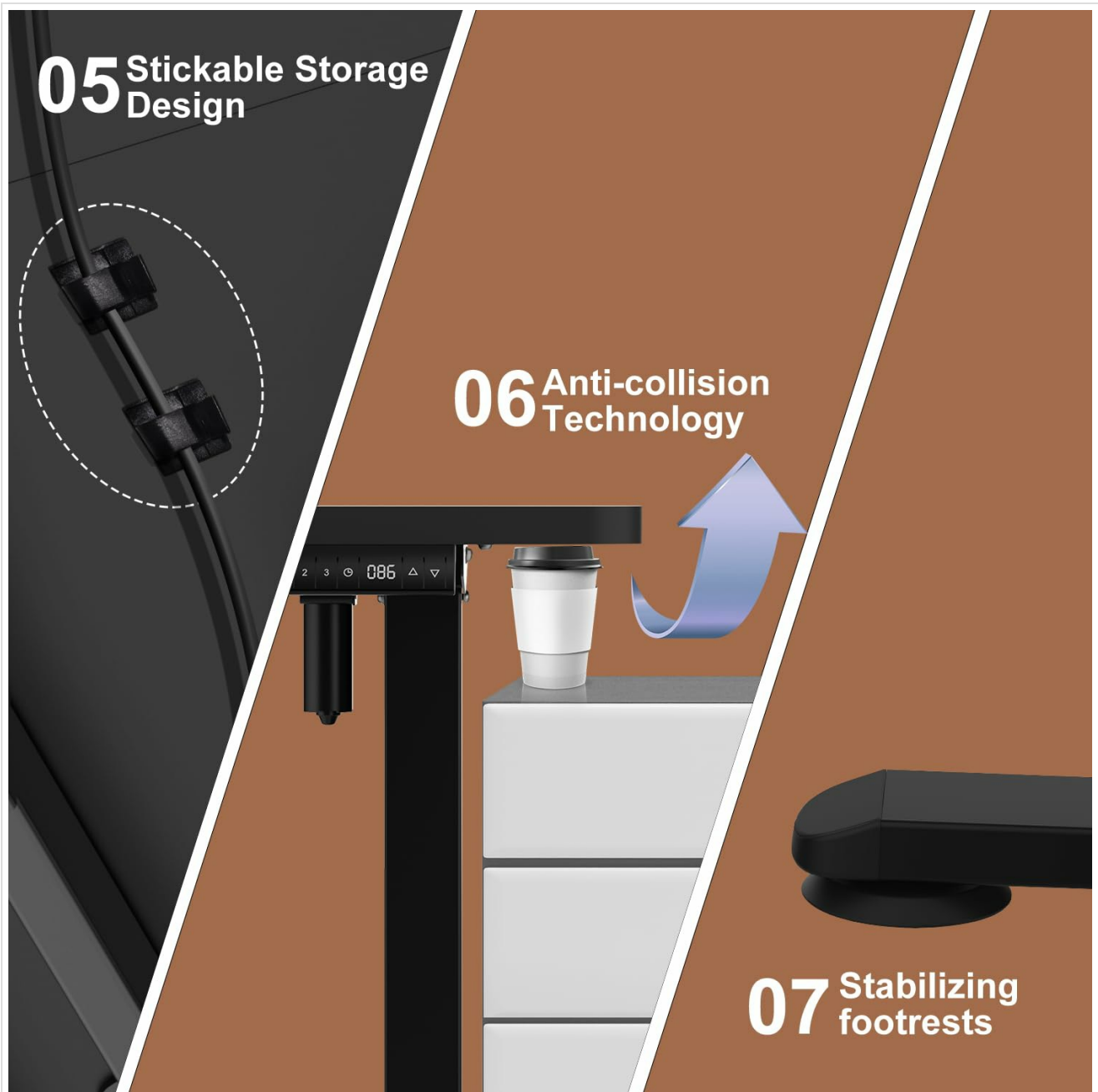
Image: Anti-collision Technology and Stabilizing Footrests. This image demonstrates the anti-collision feature, where the desk stops if an object is detected, and also shows the design of the stabilizing footrests.