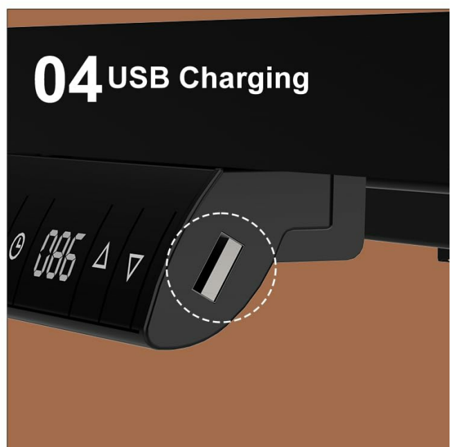
Image: Desk Features. This image illustrates the wire collecting hole for cable organization, the two hooks for hanging items, the cable management tray for tidiness, and the integrated USB charging port.