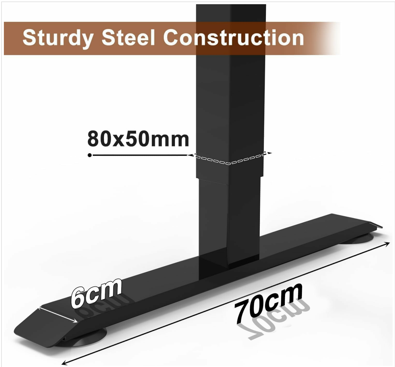
Image: Devoko Electric Standing Desk 140x80cm. This image displays the overall design of the black electric standing desk with its spacious desktop and sturdy frame.