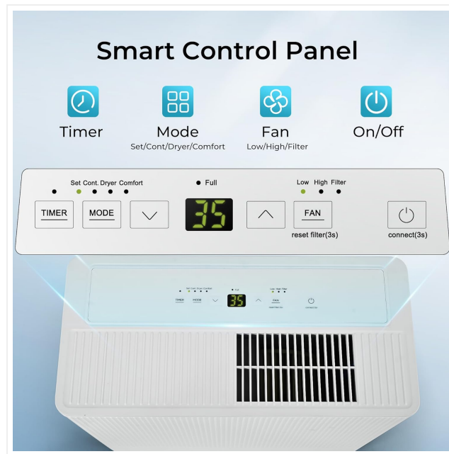
Figure 4: Close-up of the smart control panel, detailing buttons for Timer, Mode, Fan, and On/Off, along with humidity display.

The dehumidifier features an intuitive control panel located on the top of the unit. It includes buttons for power, mode selection, fan speed, humidity adjustment, and timer settings.