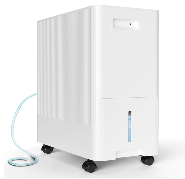
Figure 1: Front view of the Euhomy DH-50 Dehumidifier, showcasing its compact design and continuous drain hose connection.

The Euhomy DH-50 Dehumidifier is an Energy Star-certified appliance designed to efficiently remove excess moisture from indoor environments. Capable of extracting up to 50 pints of moisture per day (72 pints based on 2019 DOE standards, or 110 pints at 86°F 80% humidity), it is suitable for spaces up to 4,500 square feet. This unit features intelligent controls, multiple operation modes, and flexible drainage options to enhance user convenience and maintain optimal humidity levels.