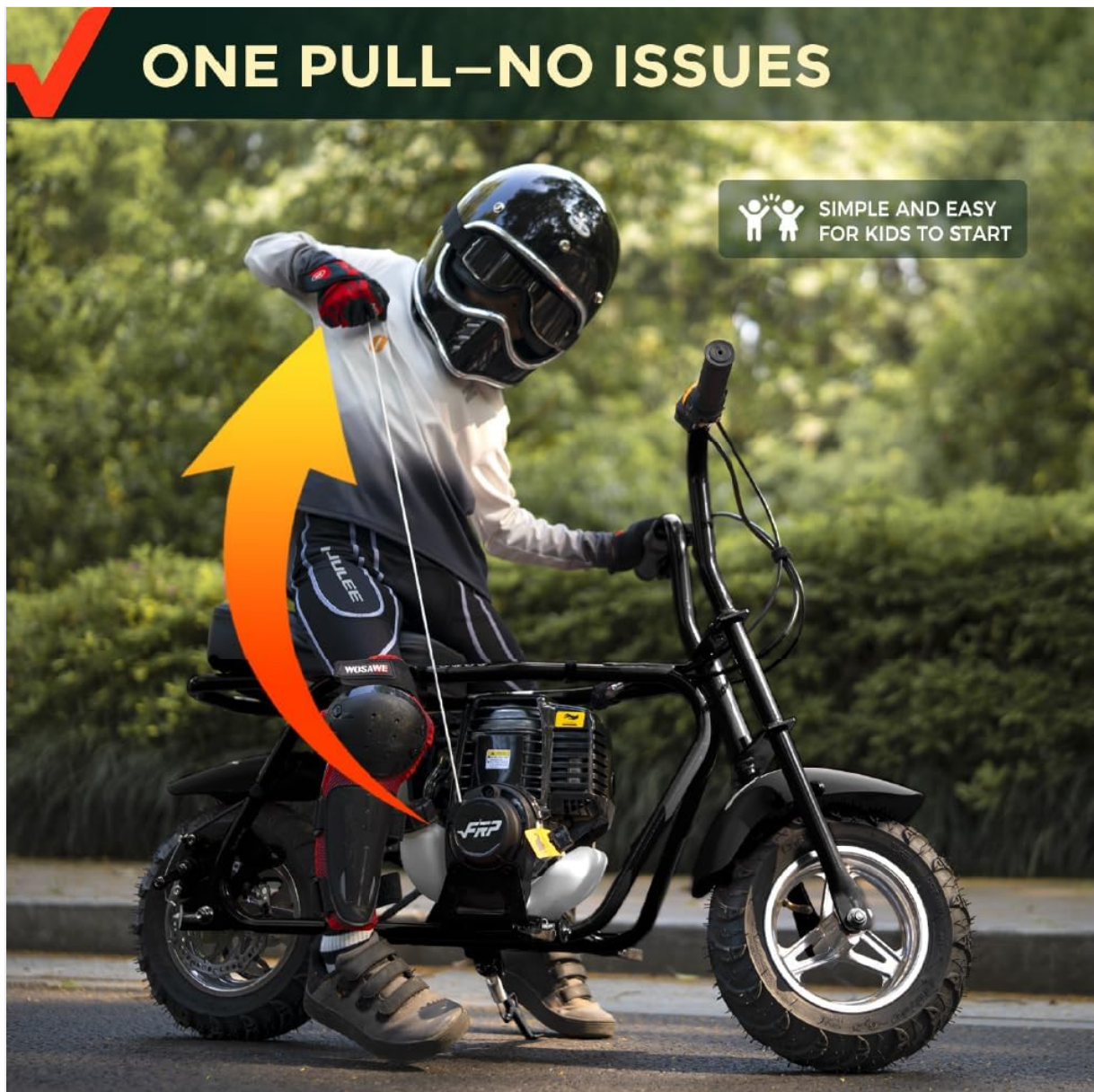
Image: A child demonstrating the simple pull-start method for the FRP Mini Bike, highlighting its user-friendly design.