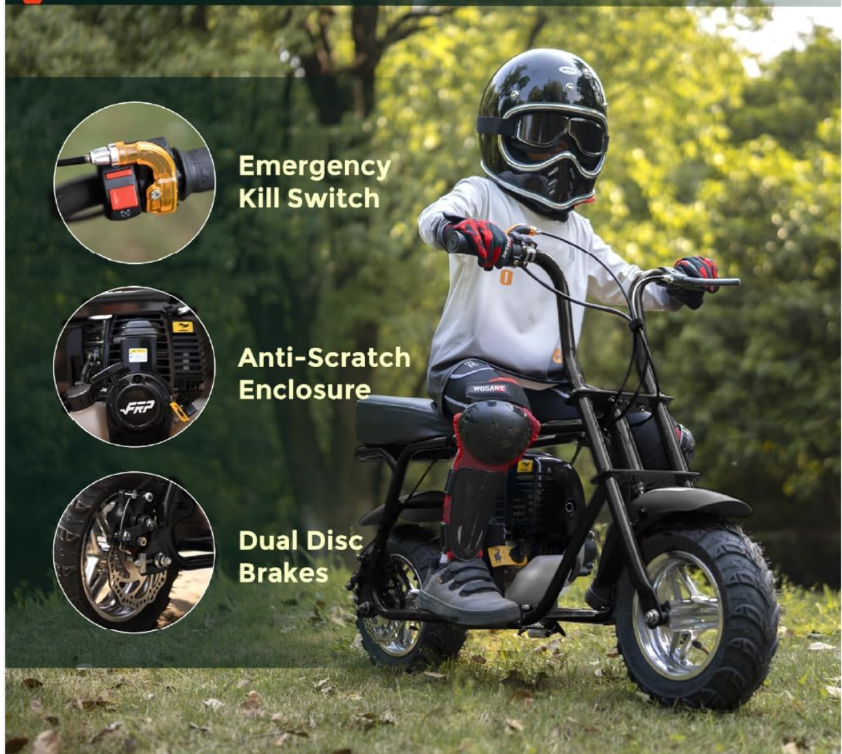
Image: A child riding the FRP Mini Bike, with callouts for key safety features including the emergency kill switch, anti-scratch enclosure, and dual disc brakes.