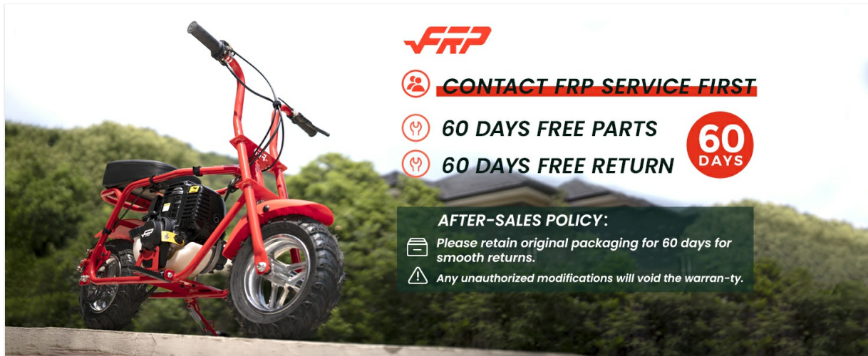
Image: An overview of FRP's after-sales policy, detailing 60 days of free parts and returns, and emphasizing contacting FRP service for assistance.

For support, please contact FRP customer service directly. Visit the FRP Store on Amazon for more information.