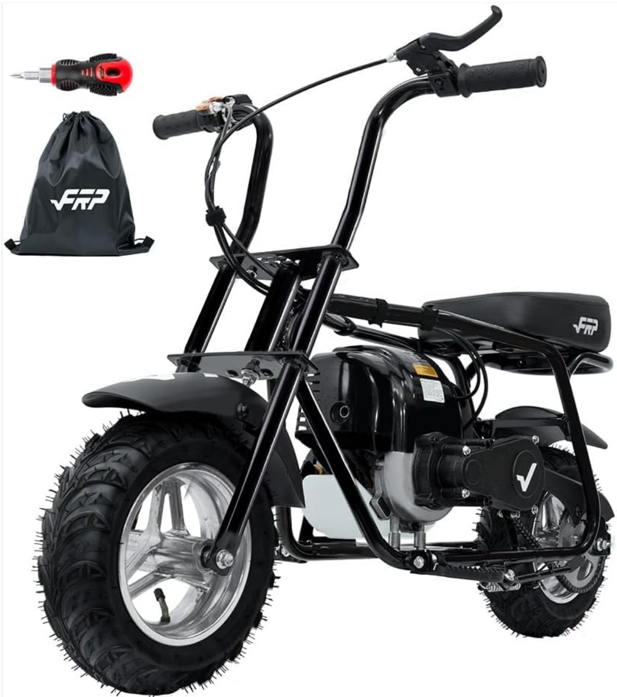
Image: The FRP MB40 4-Stroke Mini Bike, showcasing its compact design and the included basic tools for assembly.