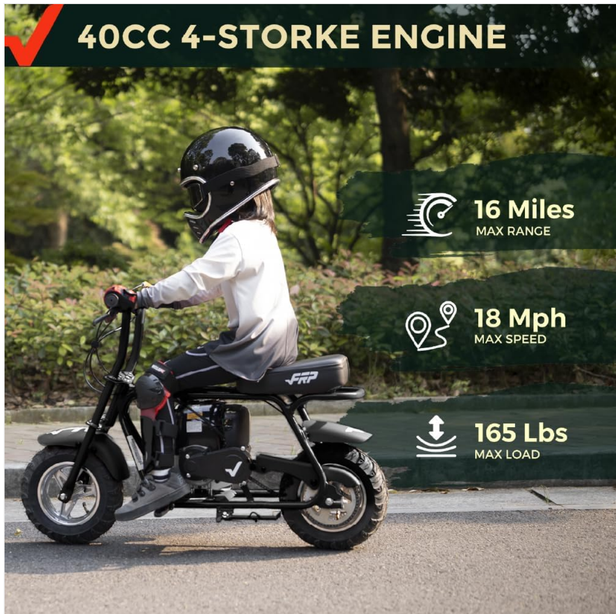
Image: A child riding the FRP Mini Bike, visually representing its 40CC 4-stroke engine capabilities, including a maximum range of 16 miles, a top speed of 18 mph, and a maximum load capacity of 165 lbs.