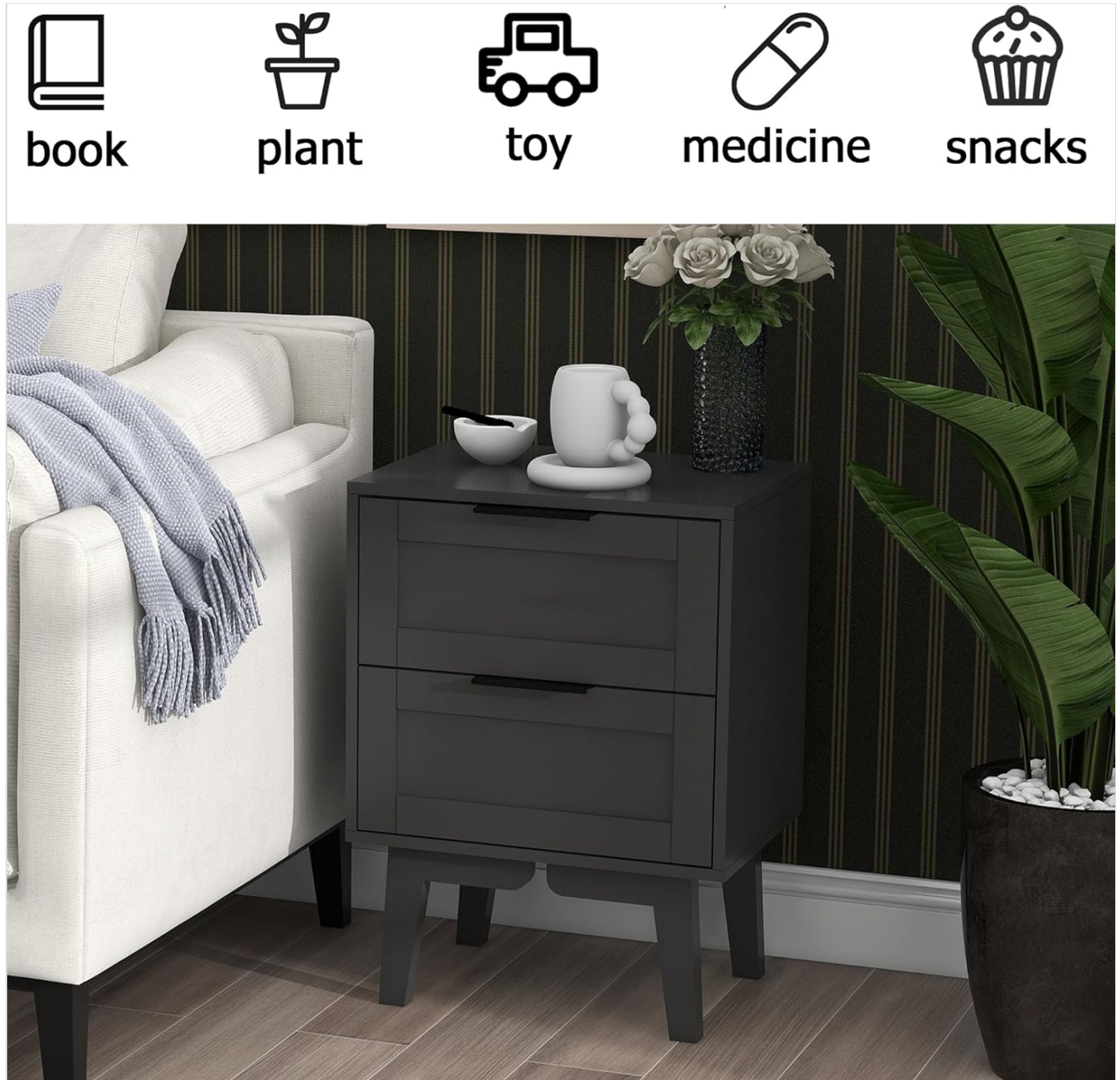
Image: Examples of items that can be stored or displayed on the nightstand.