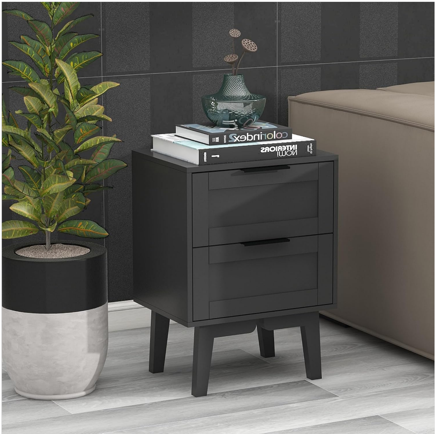
Image: Nightstand in a bedroom setting.