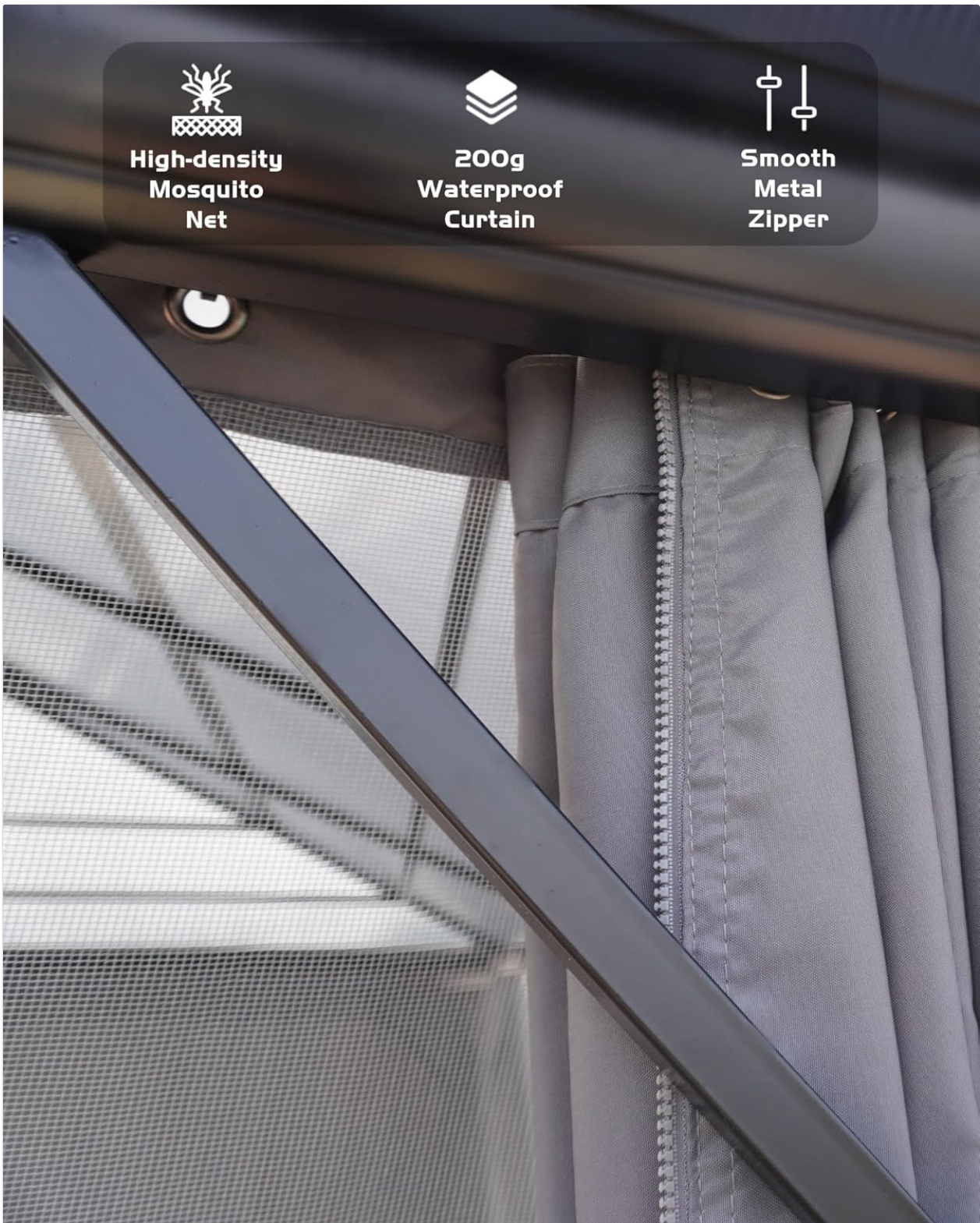
A detailed view of the gazebo's side, showcasing the high-density mosquito net, the waterproof curtain fabric, and the smooth metal zipper mechanism for opening and closing.