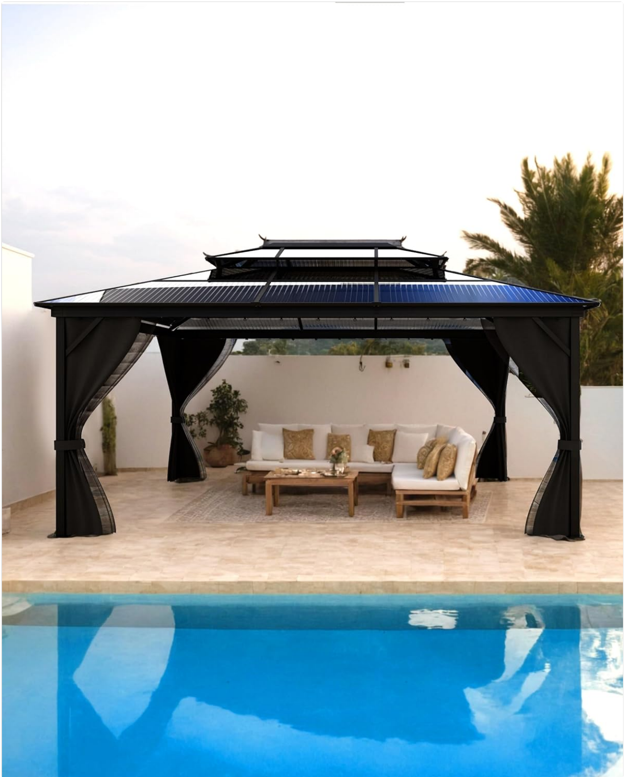
An assembled DEXSO 12x20 ft Hardtop Gazebo, featuring its aluminum frame, polycarbonate roof, and drawn curtains, positioned next to a swimming pool.