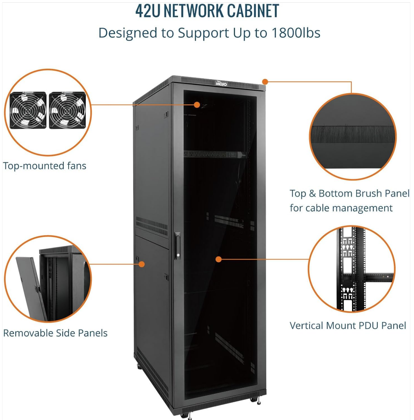
Figure 3: Internal features of the Tecmojo 42U Network Cabinet, highlighting top-mounted fans for cooling, top and bottom brush panels for cable management, removable side panels for access, and a vertical mount PDU panel.