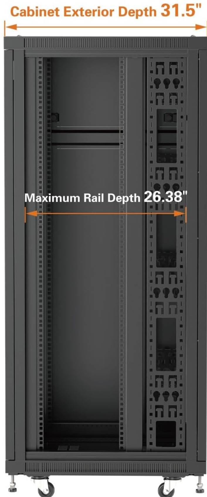
Figure 1: Tecmojo 42U Server Rack with key dimensions. The cabinet has an exterior depth of 31.5 inches and a maximum mountable rail depth of 26.38 inches.