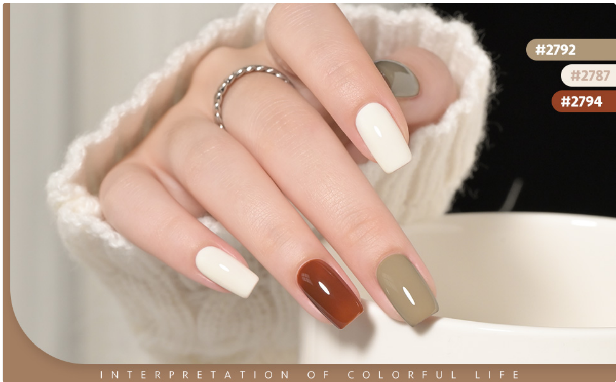
Image: Solutions for common gel nail polish application issues.