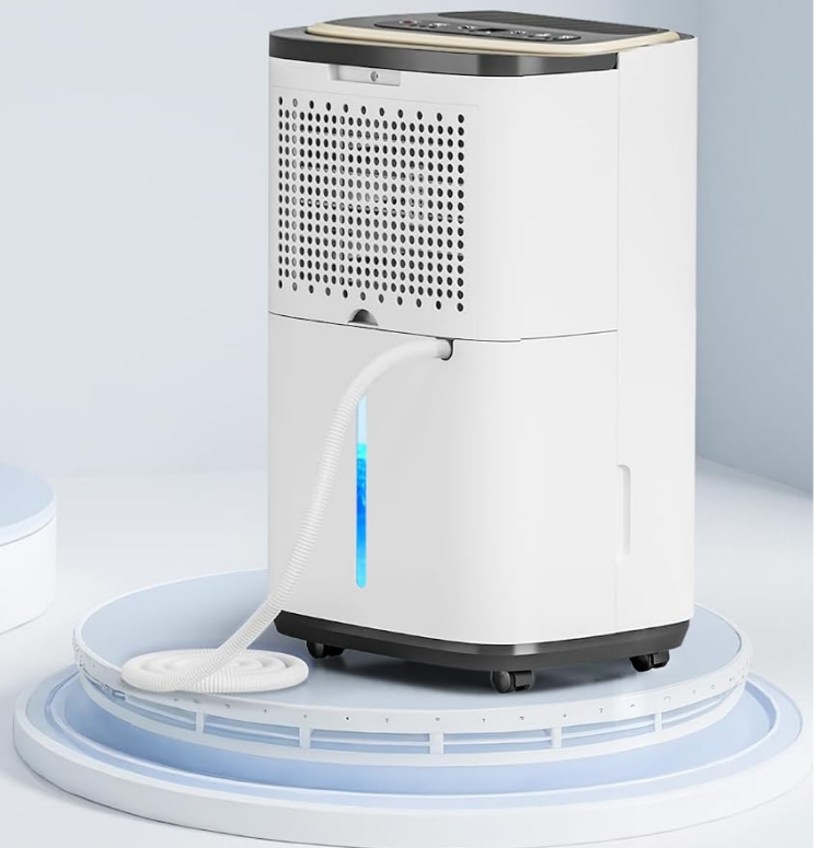
Image: Demonstrates both manual water tank drainage and continuous drainage using the provided hose.