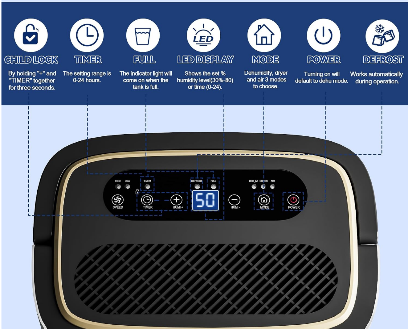
Image: Close-up view of the digital control panel with various buttons and LED display.