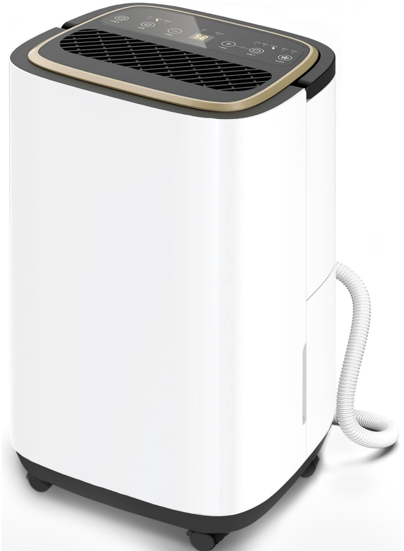
Image: Tehanld 52 Pint Dehumidifier, front view.

Your browser does not support the video tag.