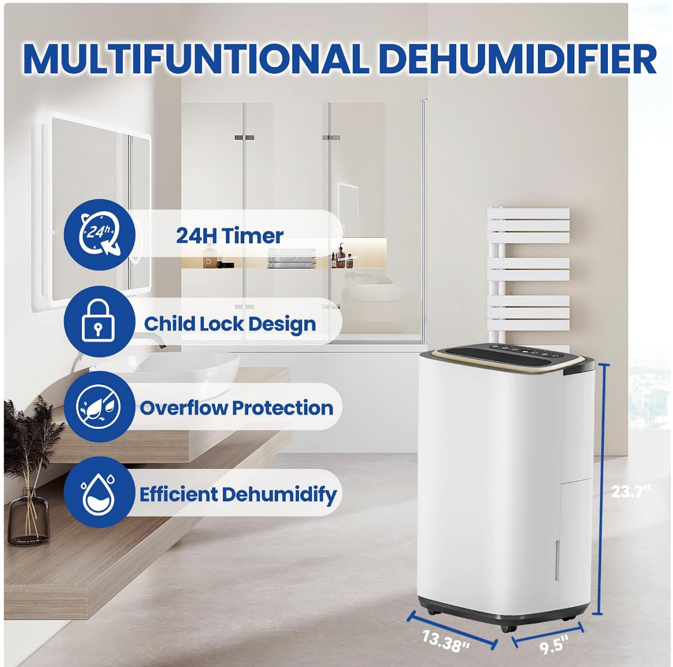
Image: Illustrates the compact dimensions and portability features of the dehumidifier, including its handle and wheels.

Carefully remove the dehumidifier from its packaging. Place the unit on a flat, stable surface in the desired area. Ensure there is at least 8 inches of space around the unit for proper airflow. The unit is equipped with built-in wheels and a handle for easy mobility, allowing you to move it between rooms as needed.