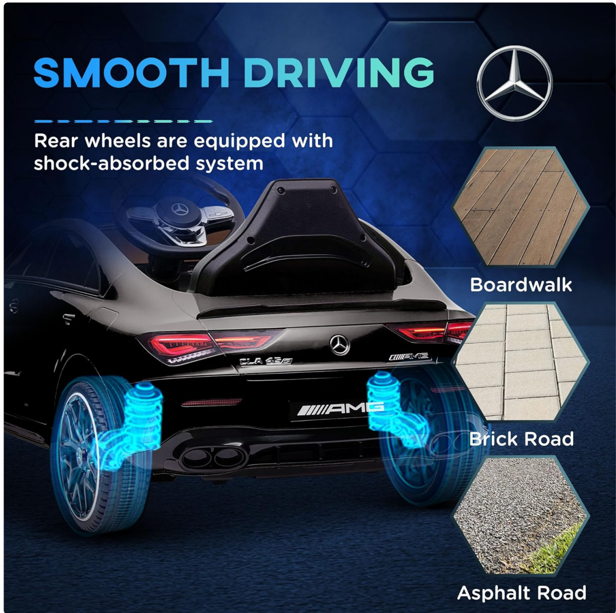
Image: An infographic highlighting the smooth driving experience provided by the rear wheel shock-absorbed system, suitable for various terrains.