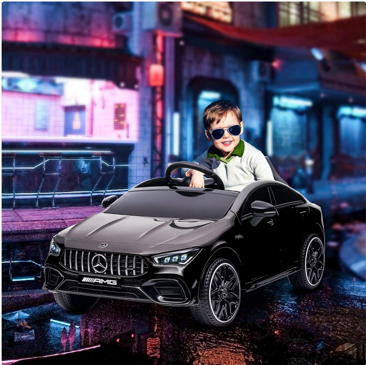
Image: A child in sunglasses sitting in the black Qaba Mercedes-Benz AMG CLA 45 electric ride-on car, showcasing its design.