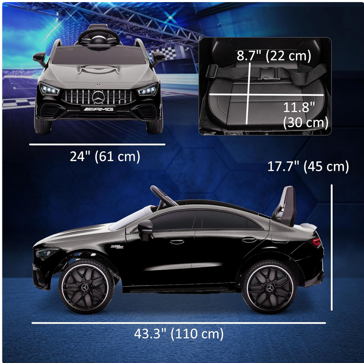
Image: Detailed dimensions of the ride-on car, including length, width, height, and seat measurements.