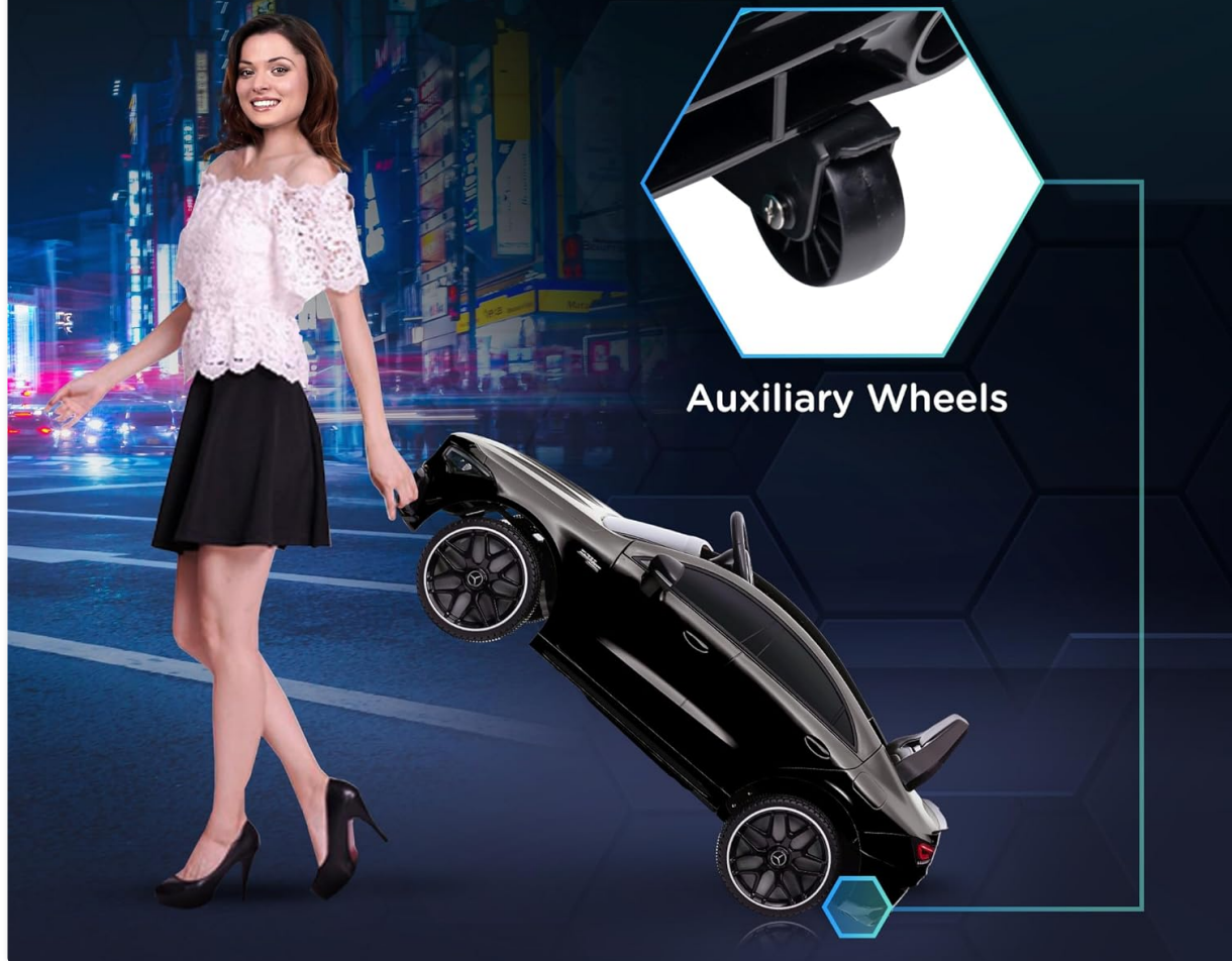
Image: An infographic demonstrating how the auxiliary wheels allow for easy movement of the car when not in use.

It is easy for you to move it when it's off