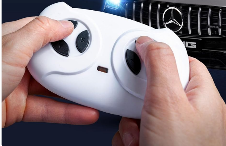
Image: A person holding the remote control, demonstrating its use for controlling the ride-on car from a distance.