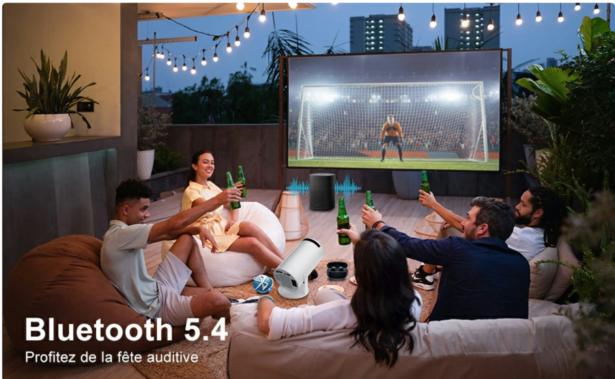
Figure 7: Projector connected to various Bluetooth audio devices.