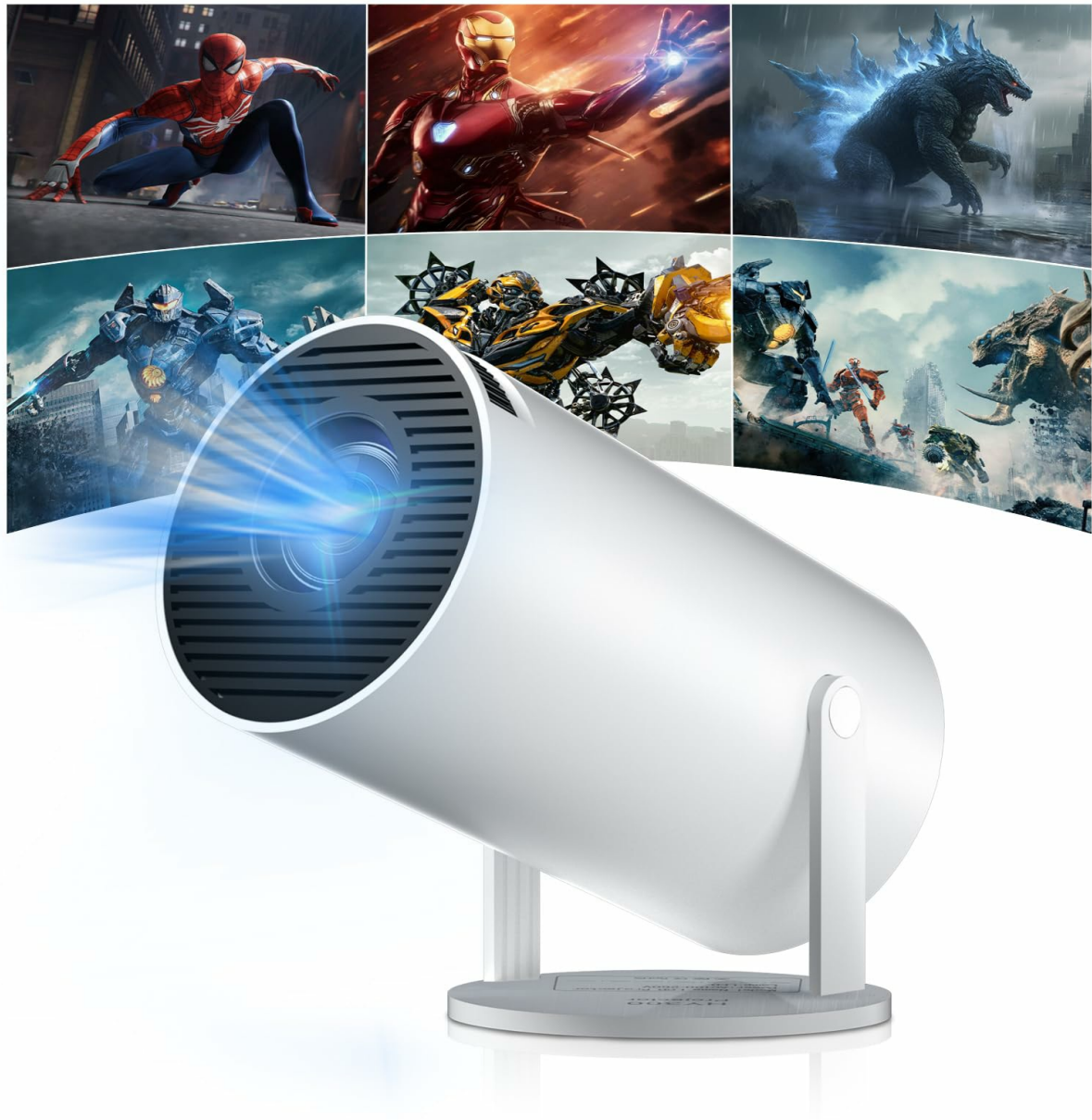
Figure 1: Salange HY300Pro Mini Projector