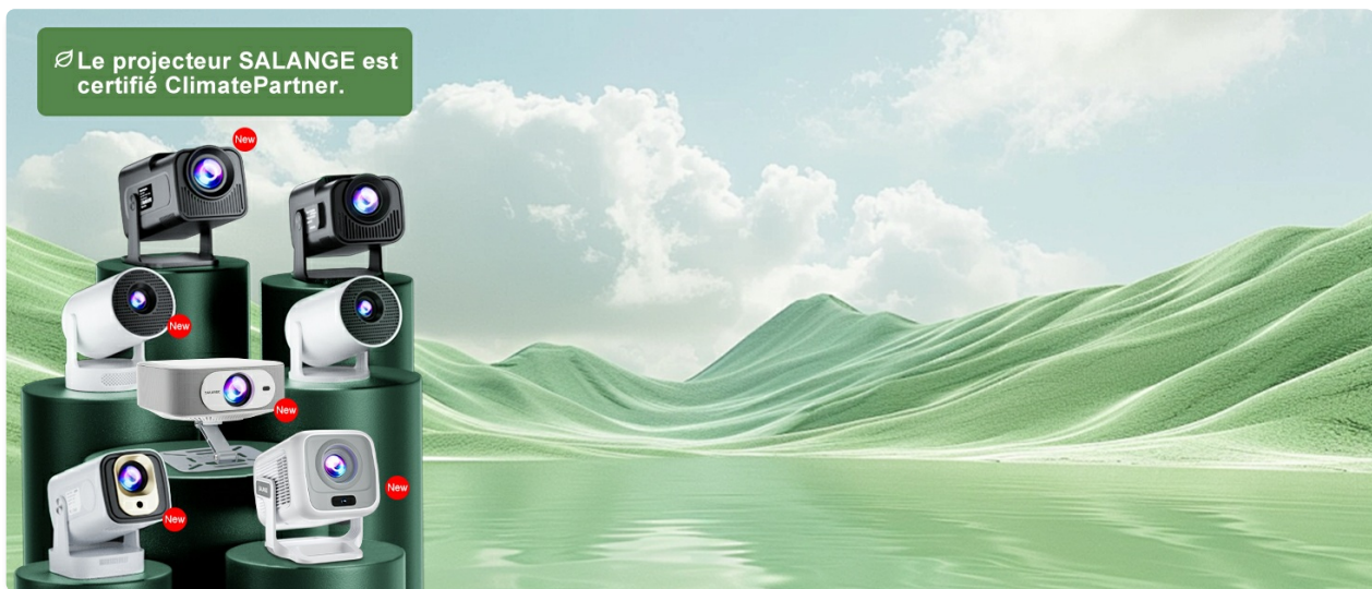
Figure 2: Overview of Salange HY300Pro features including 8K support, WiFi 6, Bluetooth 5.4, 180° rotation, and auto keystone correction.