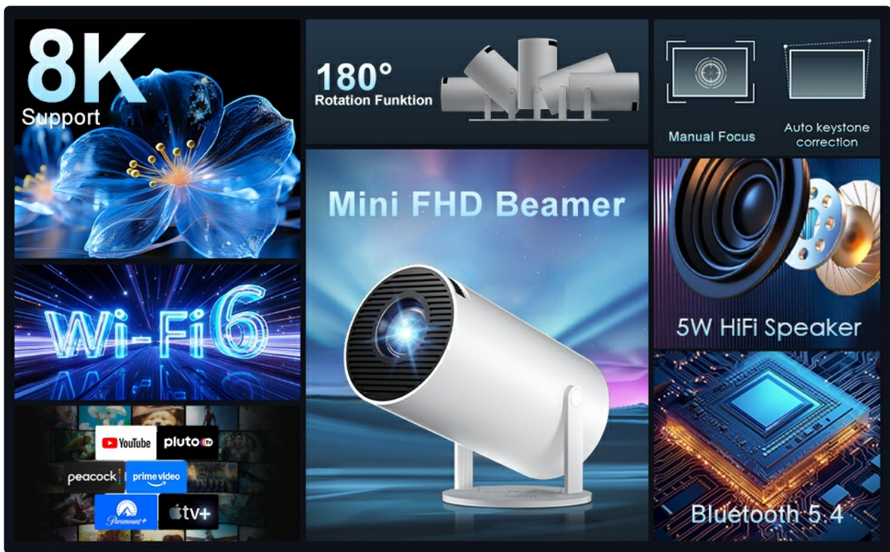
Figure 9: Projector displaying a large image, illustrating its ability to create a home cinema experience.