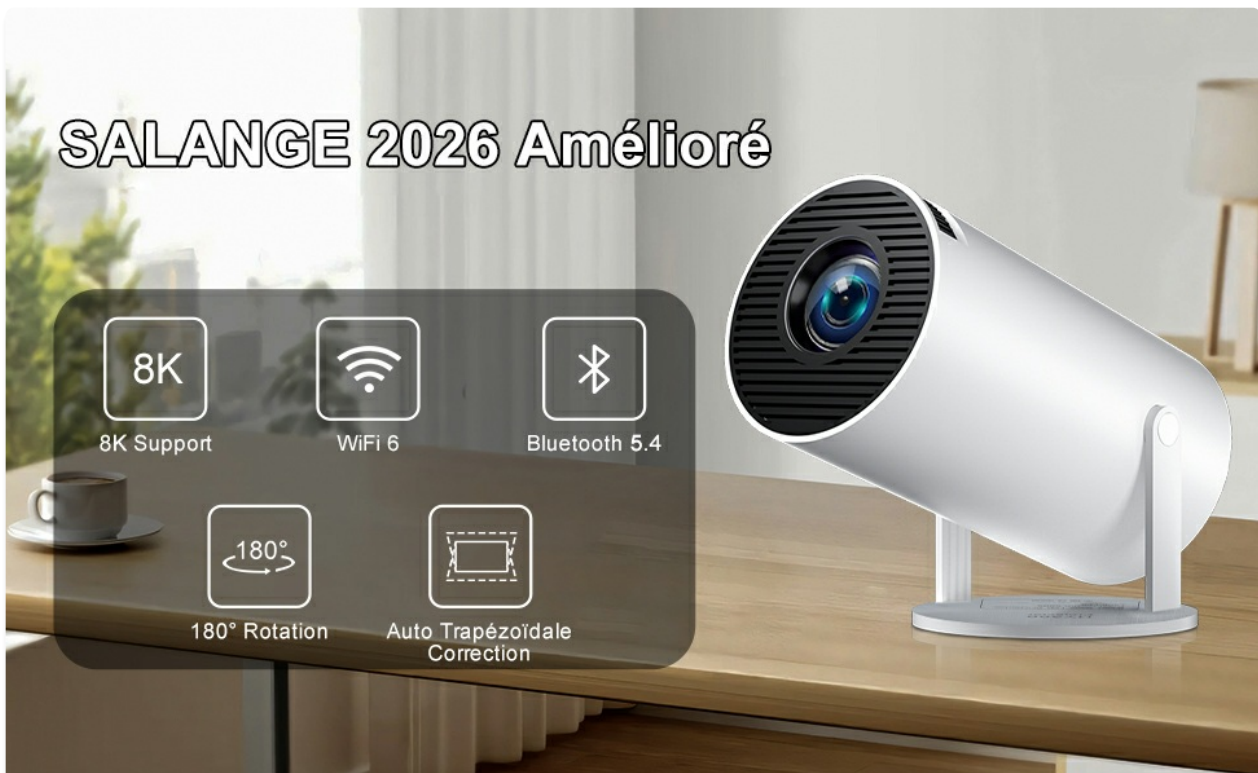
Figure 6: Visual representation of the projector's WiFi 6 capabilities for ultra-fast streaming.