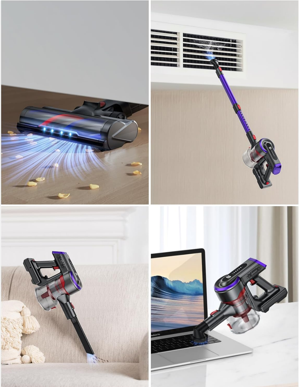
Image: The vacuum cleaner configured for different cleaning scenarios, including floor cleaning, high-reach cleaning, and handheld use for upholstery and keyboards.