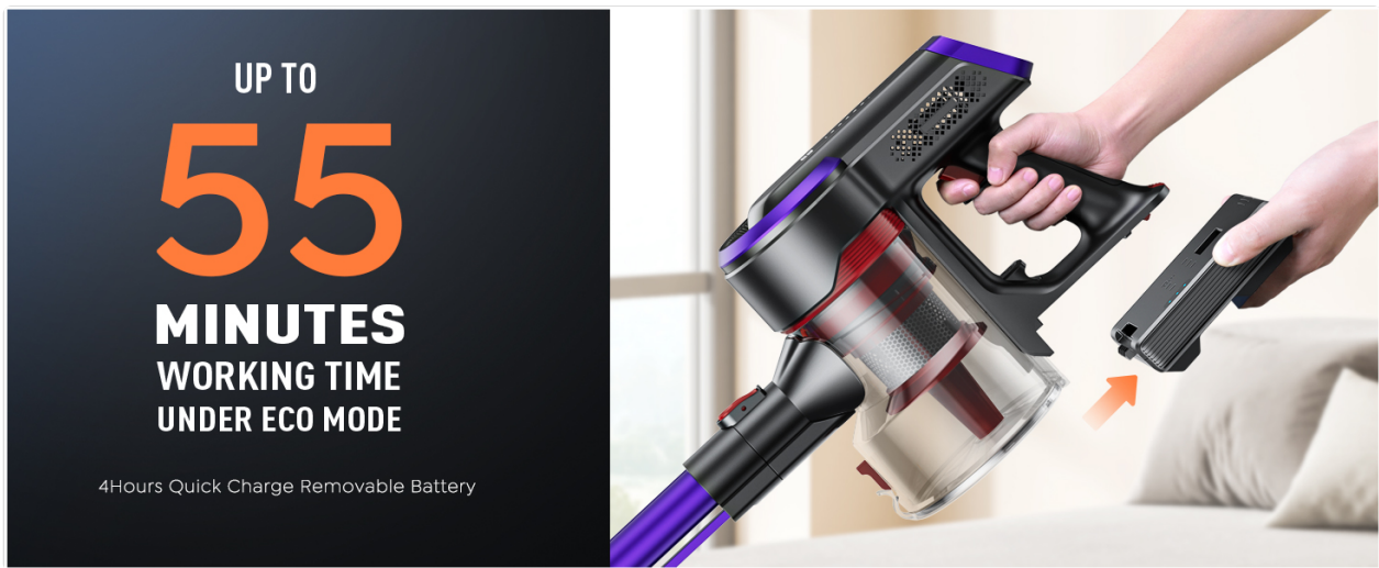
Image: Illustration of the removable battery being inserted into the vacuum, highlighting its capacity and charging time.