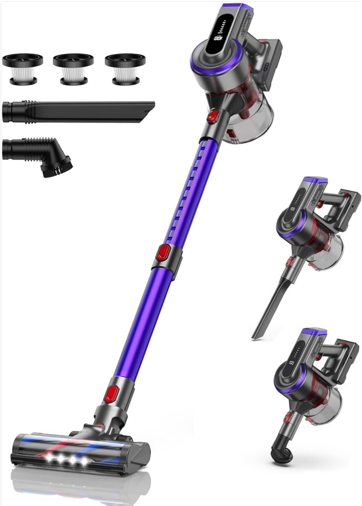
Image: The INTETURE JR400 Cordless Vacuum Cleaner shown with all its components and accessories laid out.