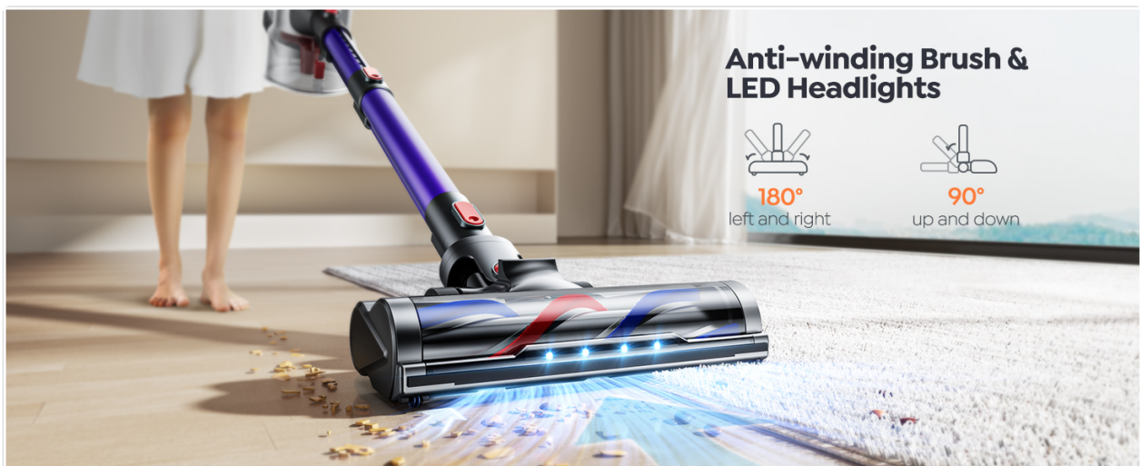
Image: The anti-winding brush head with LED lights, demonstrating its flexible movement for cleaning various areas.