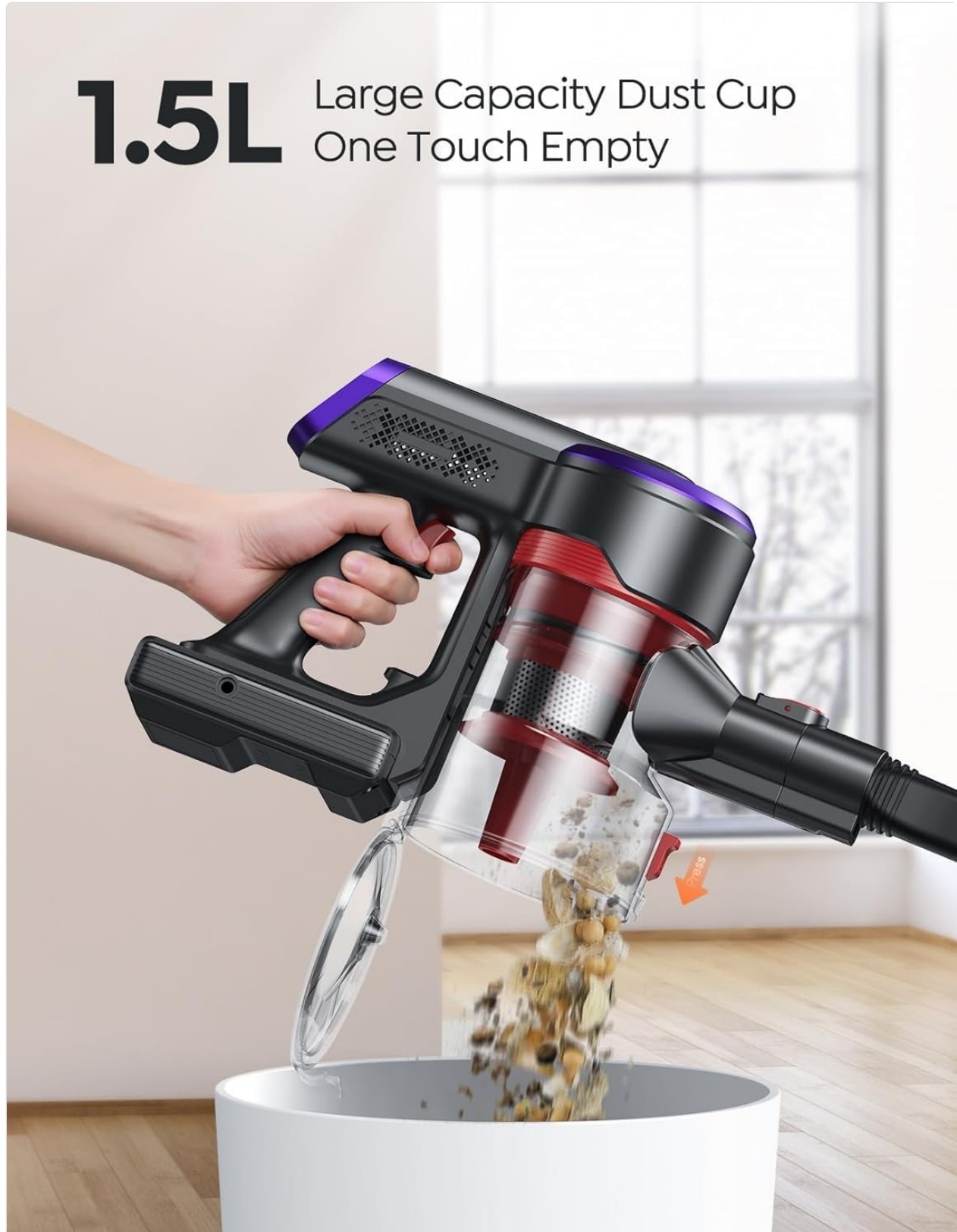
Image: A hand demonstrating the one-touch emptying mechanism of the 1.5L dust cup, releasing collected debris.