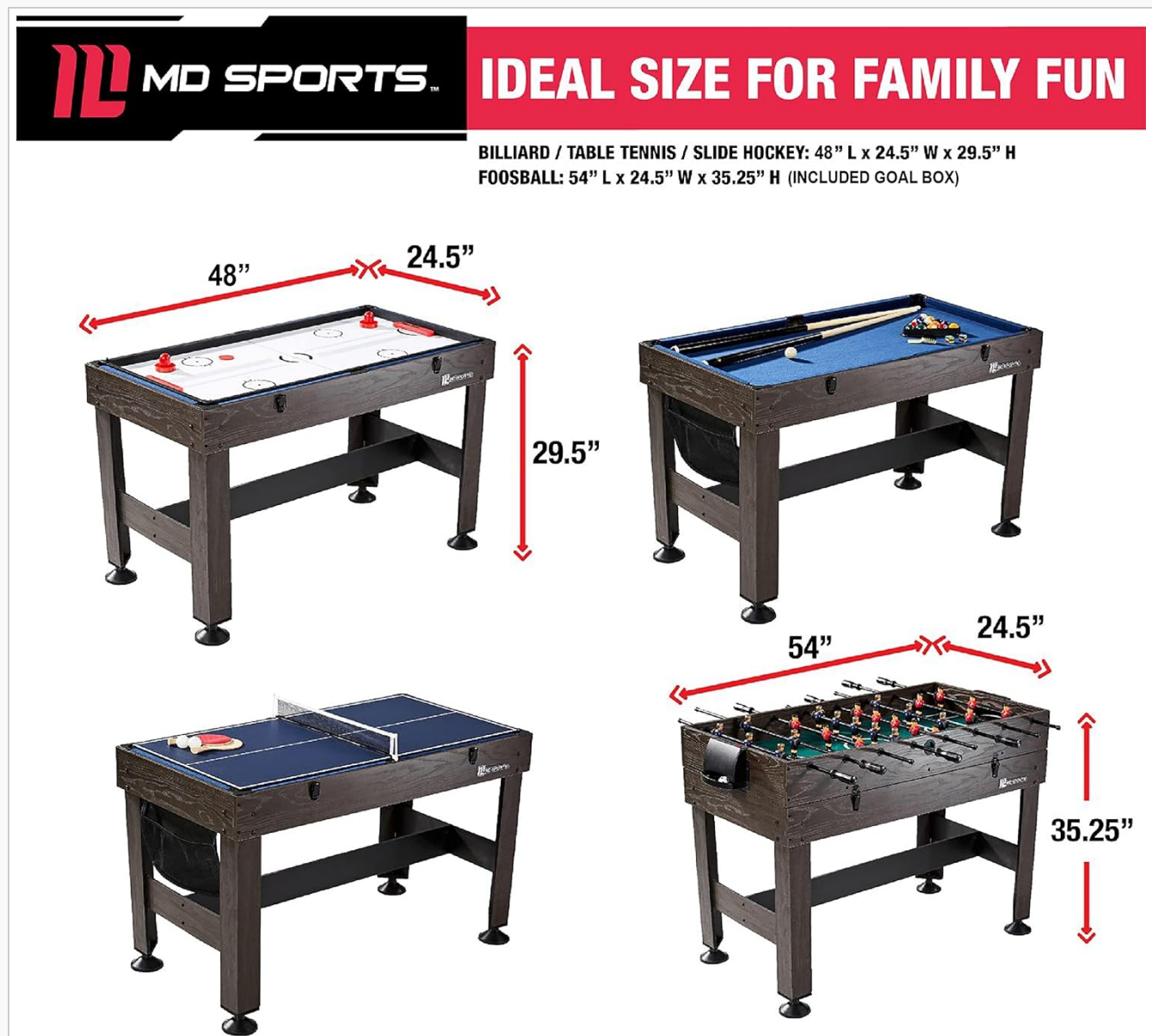
Figure 8.1: Detailed dimensions for each game configuration, providing precise measurements for space planning.

Leg Levelers: 3.5" Oversized Leg Levelers with Rubber Ring