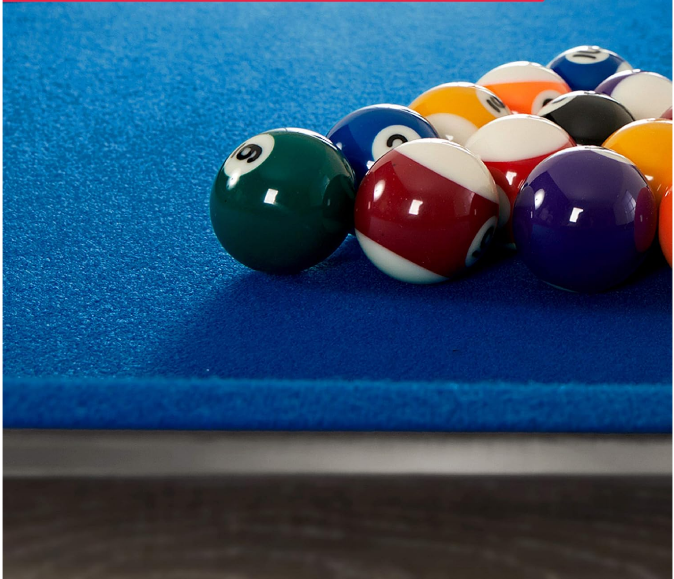
Figure 5.3: The billiard playfield with racked balls, highlighting the 9mm double thickness for optimal ball movement.