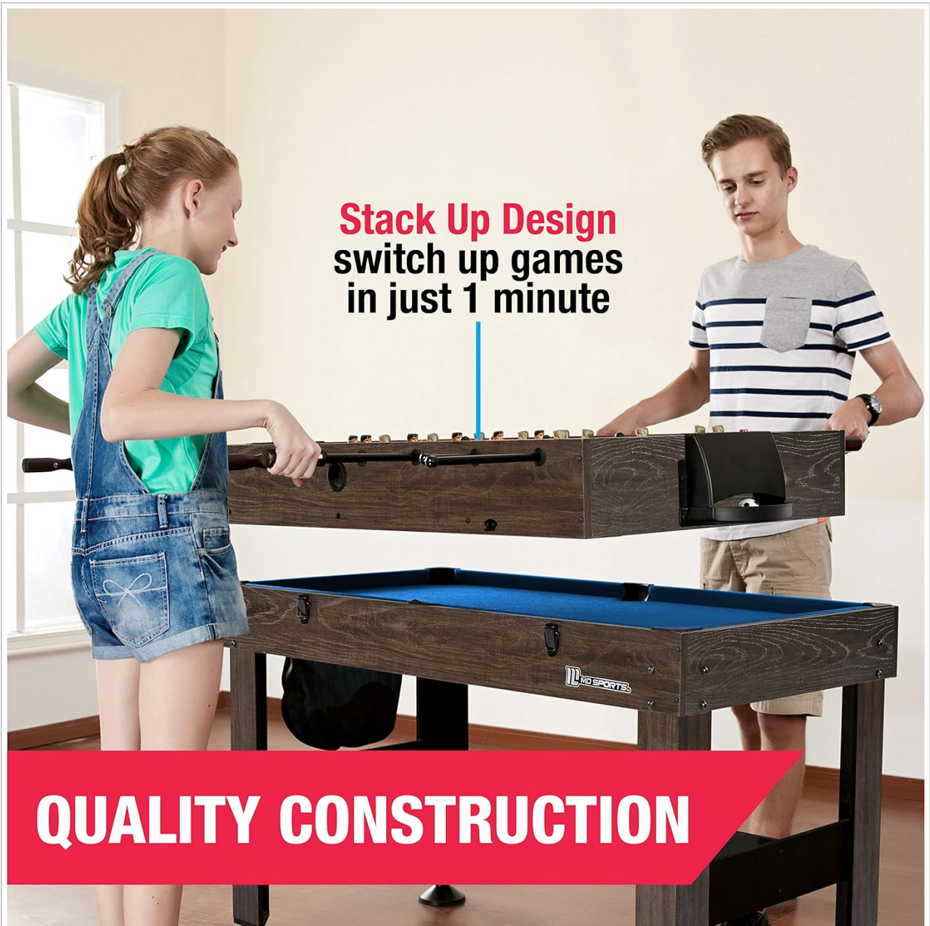
Figure 4.1: The innovative Stack Up Design allows for quick and easy switching between different game modes, making transitions seamless.