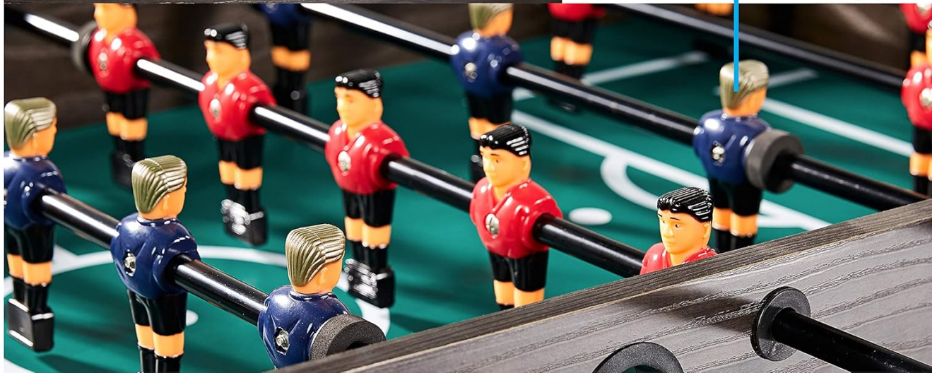
Figure 5.1: Detail of the foosball table's premium steel rods and balanced players, designed for smooth and responsive gameplay.

Balanced Foosball Player for great playing experience