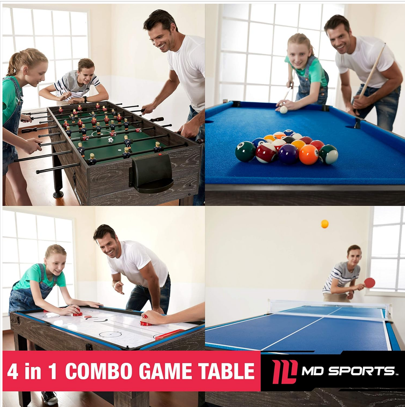
Figure 5.4: Various game modes in action, demonstrating the versatility and family-friendly nature of the 4-in-1 combo game table.