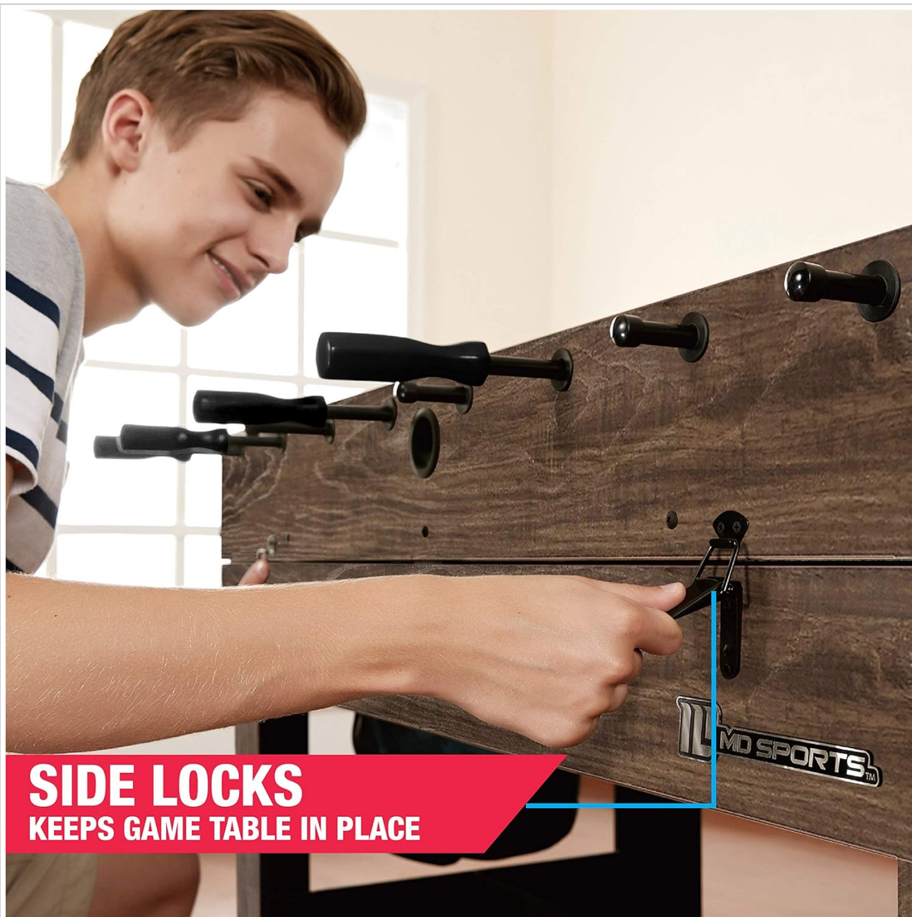
Figure 4.2: The side locks are crucial for stability, ensuring the game table remains securely in place during active play.