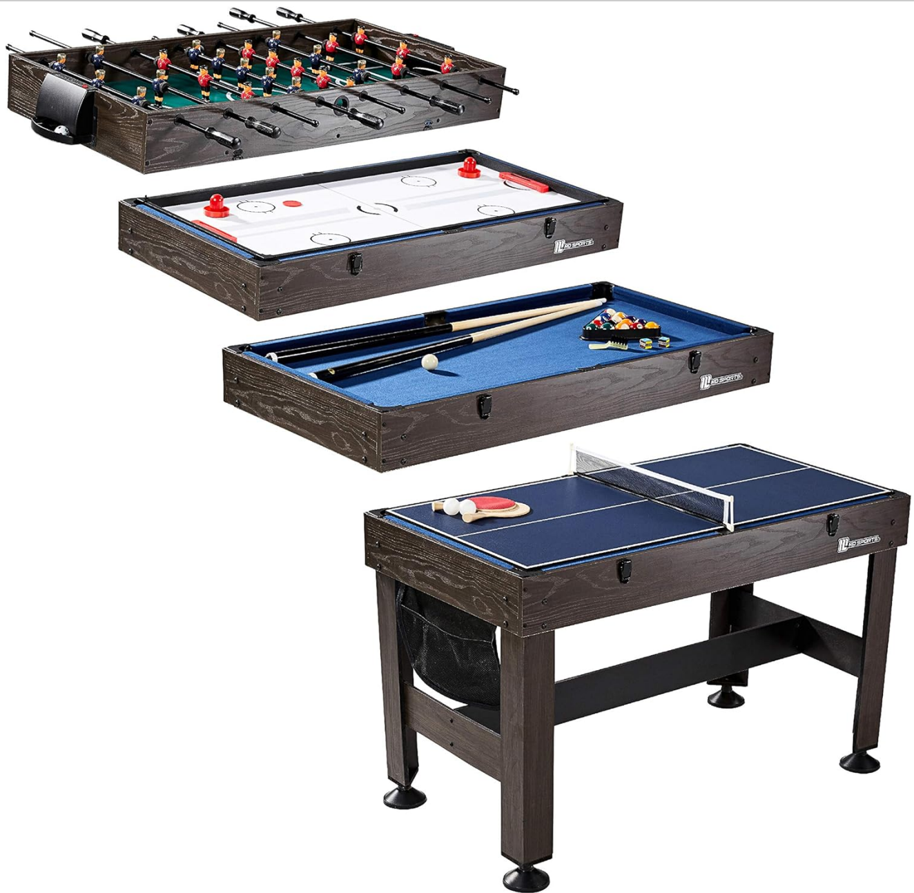
Figure 1.1: The MD Sports 4-in-1 Combo Game Table, showcasing its four distinct game configurations: Foosball, Slide Hockey, Billiards, and Table Tennis. Each game surface is designed for easy interchangeability.