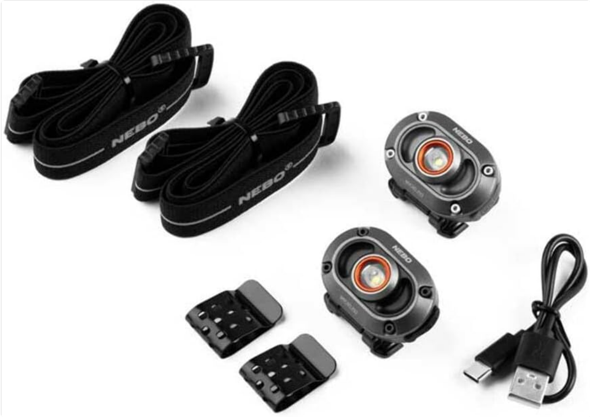
Image 2.1: Contents of the NEBO MYCRO 250 package, including two headlamps, head straps, cap clips, and USB charging cables.