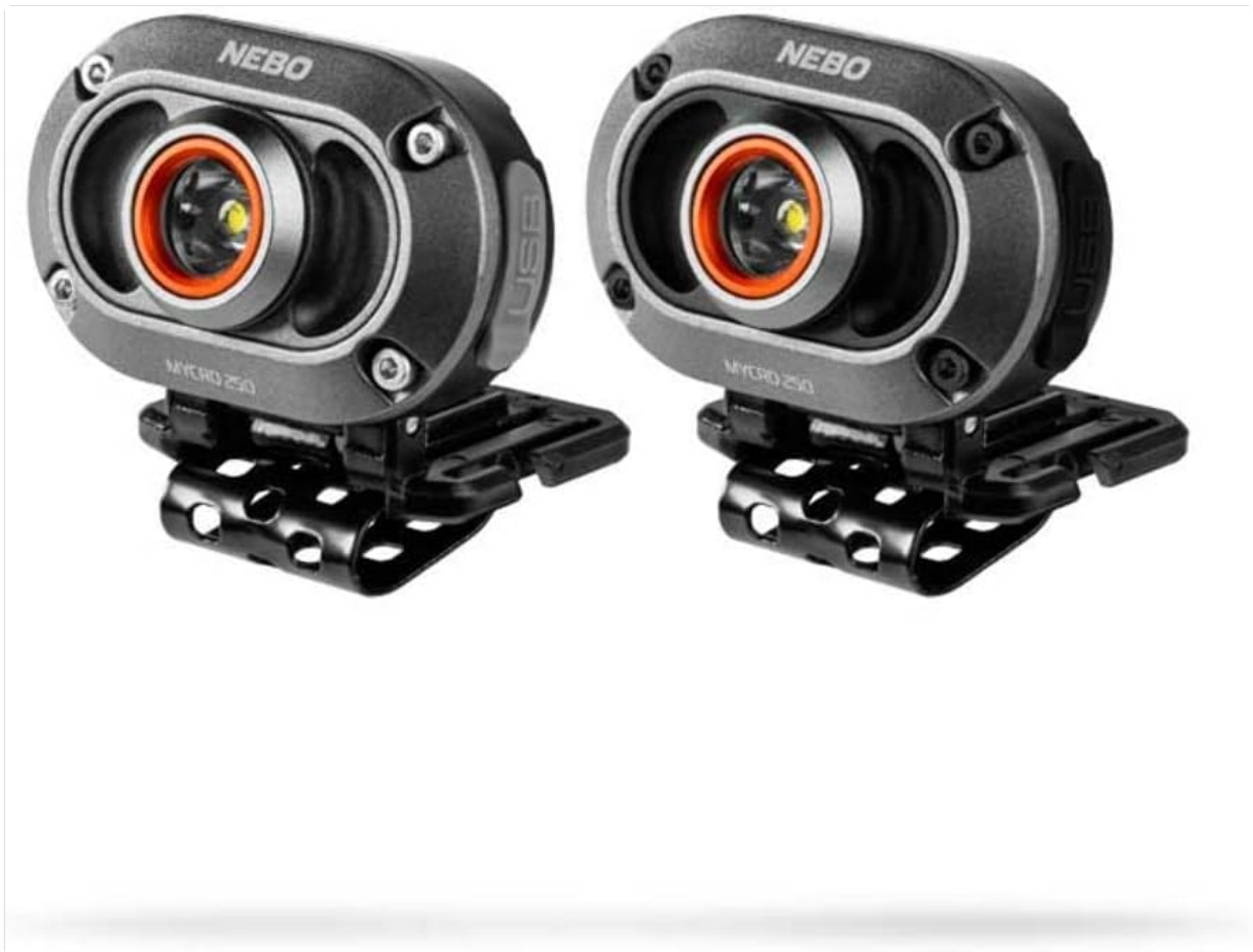
Image 1.1: Two NEBO MYCRO 250 Rechargeable Headlamps, showcasing their compact design.